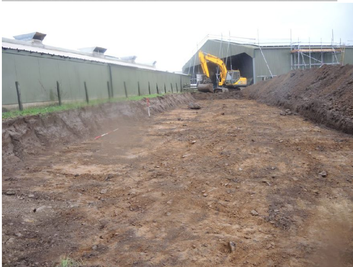
Illus 4 View of soil strip looking W