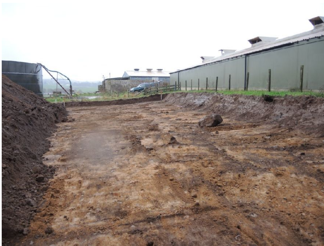
Illus 5 View of soil strip looking E