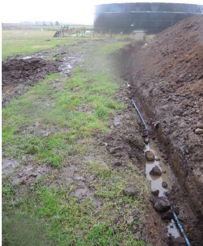
Illus 2 View of pipe and cable trench along N edge of site, looking E