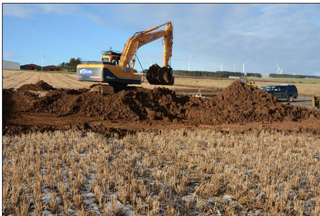
Illus 4: Soil strip in progress, looking W