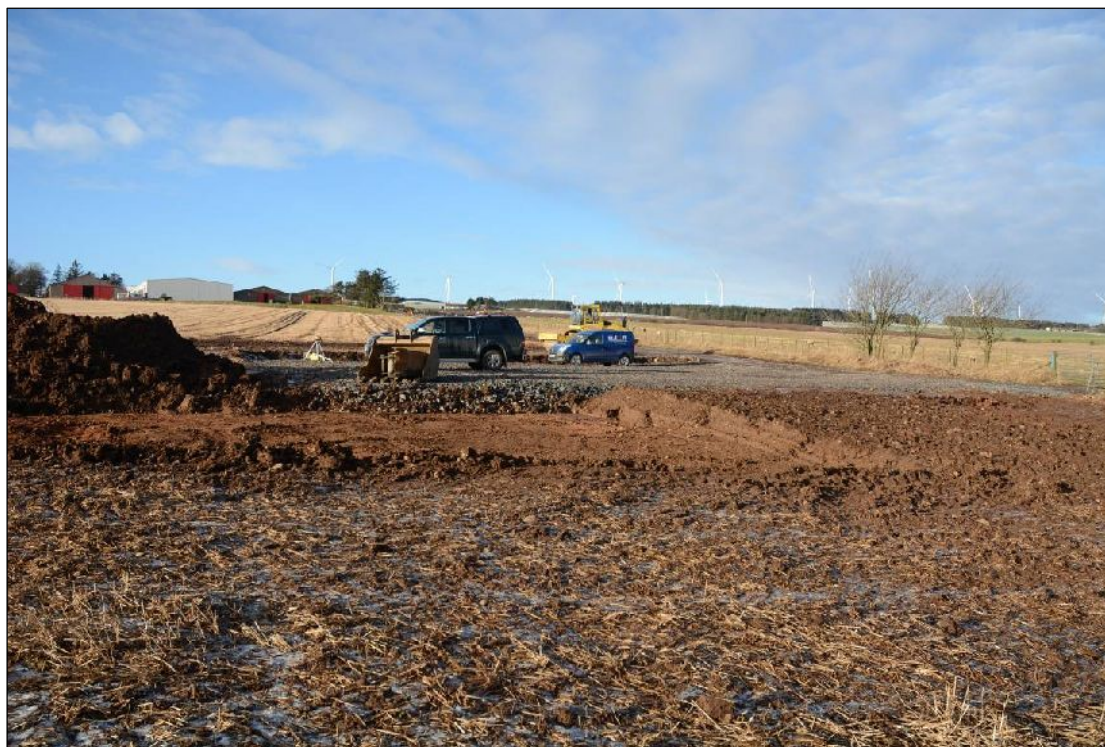
Illus 3: General view, looking W, to Redford farm steadings and Tullo Windfarm.

4.1 Although the site of the turbine is located a short distance to the NW of a known crop mark site, no archaeological features or finds were evident.