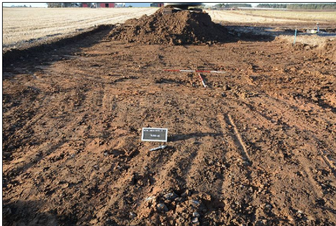
Illus 5: Area of turbine base following soil strip.