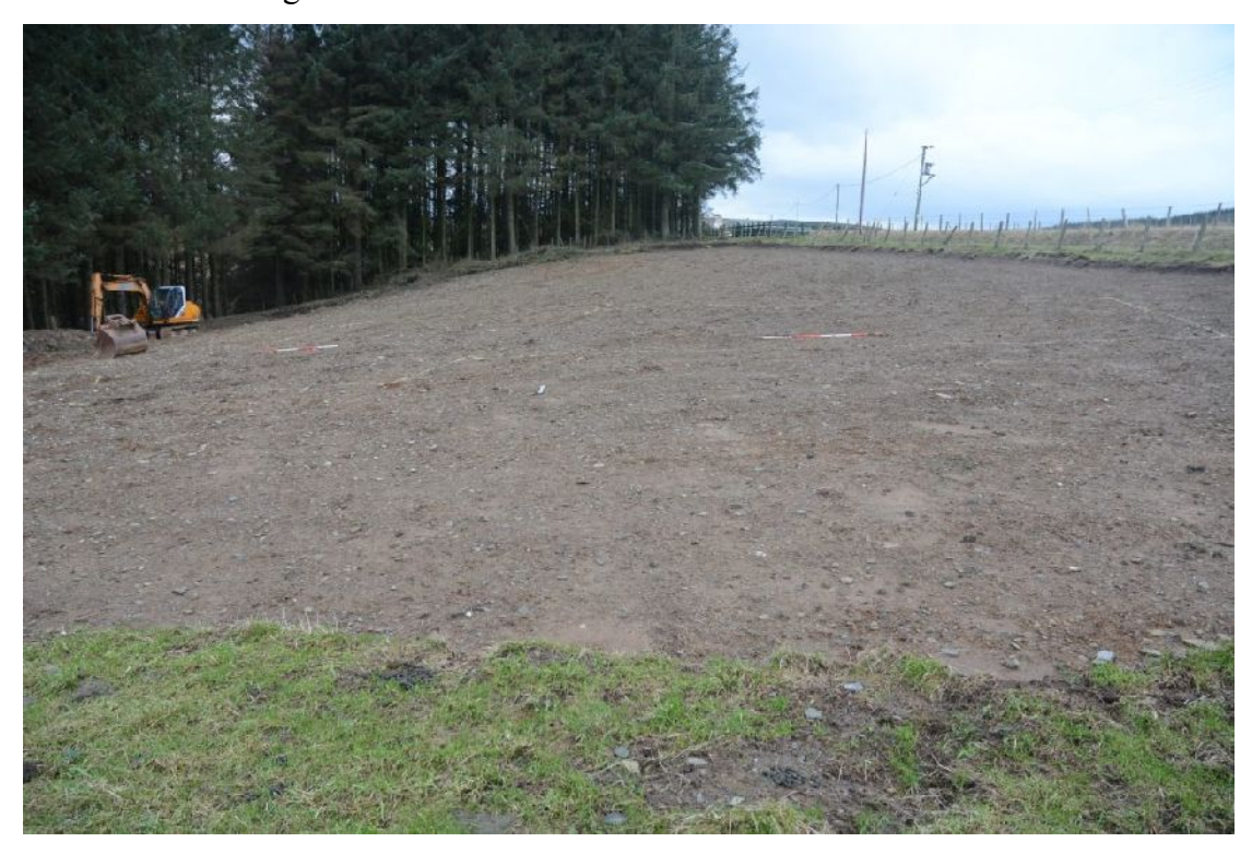
Illus 1 General view of site with topsoil stripped, looking SW