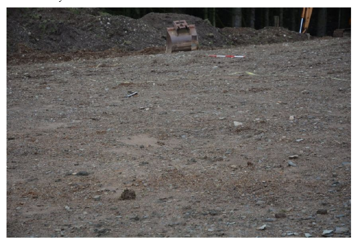
Illus 5 Detail of schist natural.

3.4 No archaeological features were evident, but two sherds of medieval or post-medieval pottery and a sherd of 19<sup>th</sup>/20<sup>th</sup>- century Redware are indicative of some spreading of midden material.