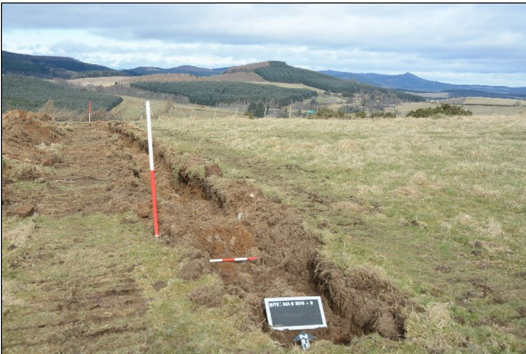
Illus 5: Cable trench on N side of access track, showing rock outcrop below vegetation