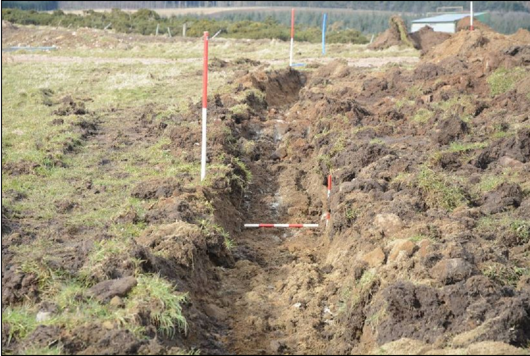
Illus 4: Detail of cable trench on S side of access track