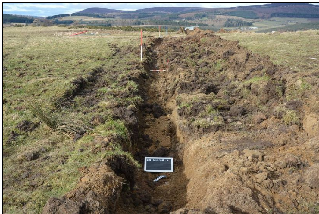
Illus 3: Cable trench on S side of access track

Murray H K and Murray J C, 2015 Auchorrie Windfarm, Midmar, Aberdeenshire, Archaeological desk top and walkover survey 2015 . MAS 2015-31. unpublished archive report.