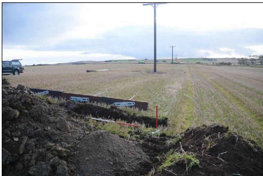
Illus 6: View of line, looking SE.