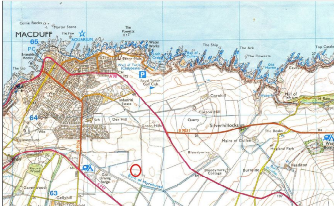
Illus 1: Map showing site location circled in red.

case to the SW of Bloodymire Farm where a crop mark site of ring ditches lay a short distance E of a pole where new ground stays were required (Illus.1, below).