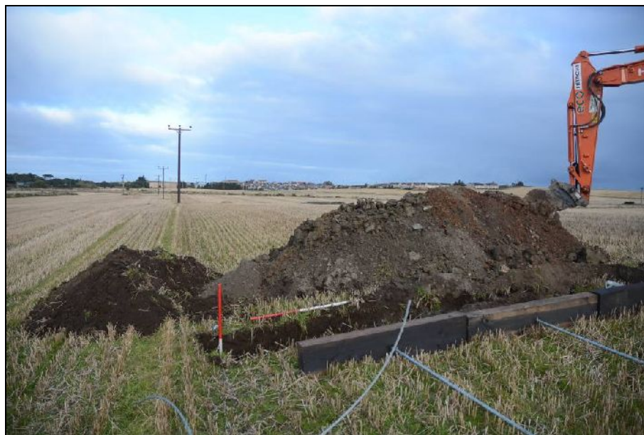
Illus 3: View of line, looking NW.