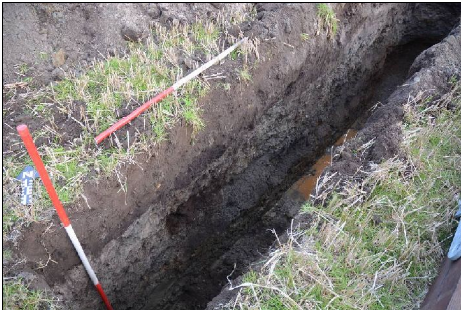
Illus 5: Detail of N section of trench.