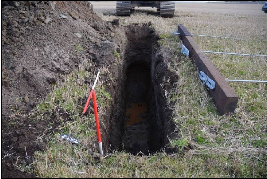
Illus 4: Trench, looking SE.