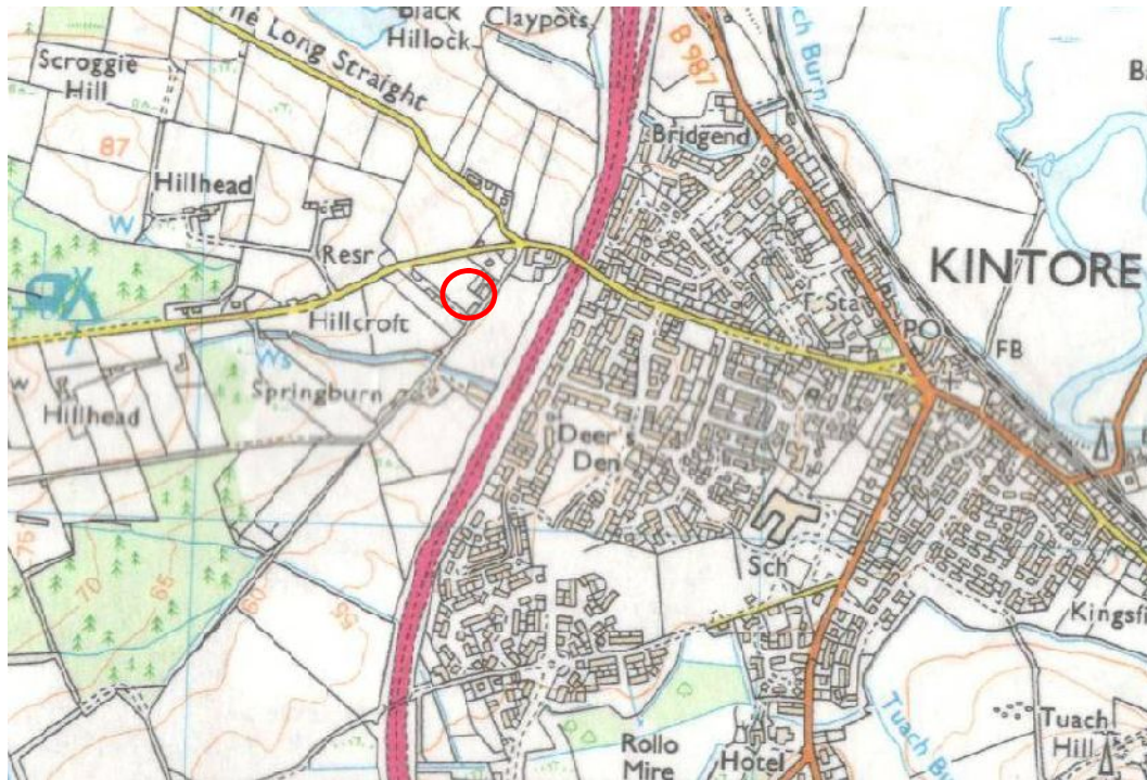
Illus 1 Detail of OS map. Site indicated by red circle