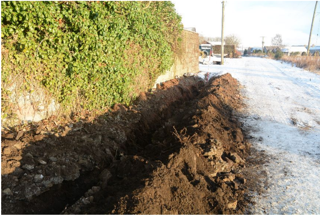
Illus 3 Trench for electric cable looking NE

The trench for the water pipe ran for 79m from the water main at the NW end of the field behind the property at 378392, 816464 to 378453,816414.