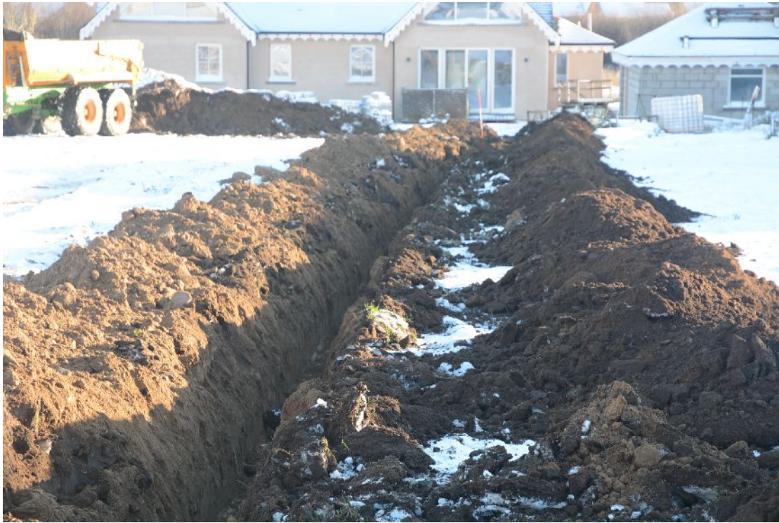
Illus 4 Trench for water pipe, looking SE