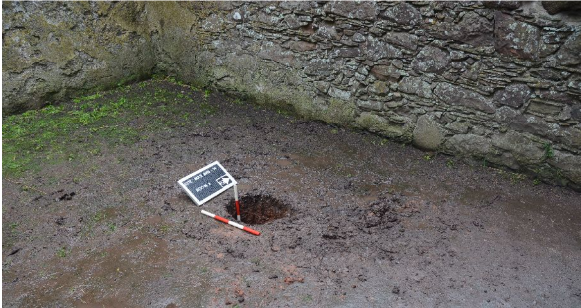
Illus 4 Room 2. Location of sump.

Stratigraphy: 100-110mm earthy gravel make up over natural reddish stoney clay. There was no evidence of any earlier floors and no finds in the fill that was removed.