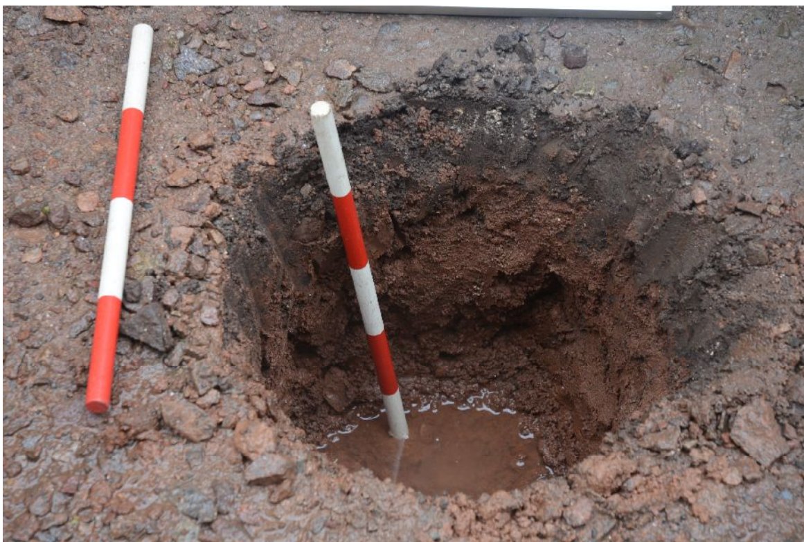
Illus 3 Room 1 detail of sump