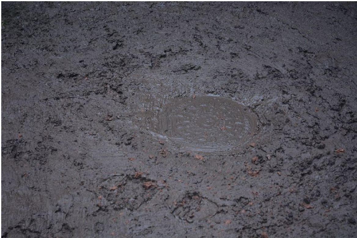
Illus 6 Sump with lid

After excavation the sump linings were inserted with capped lids.