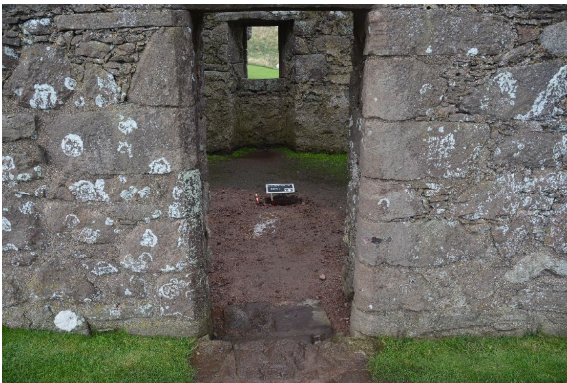
Illus 2 Room 1. Location of sump