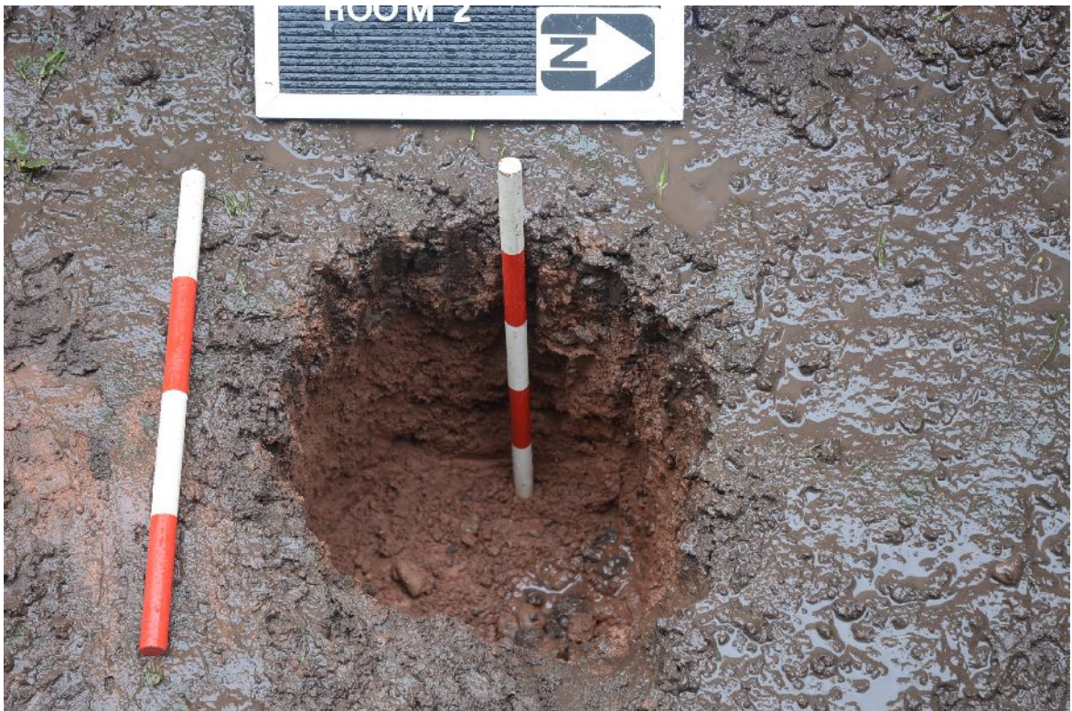
Illus 5 Room 2 detail of sump.