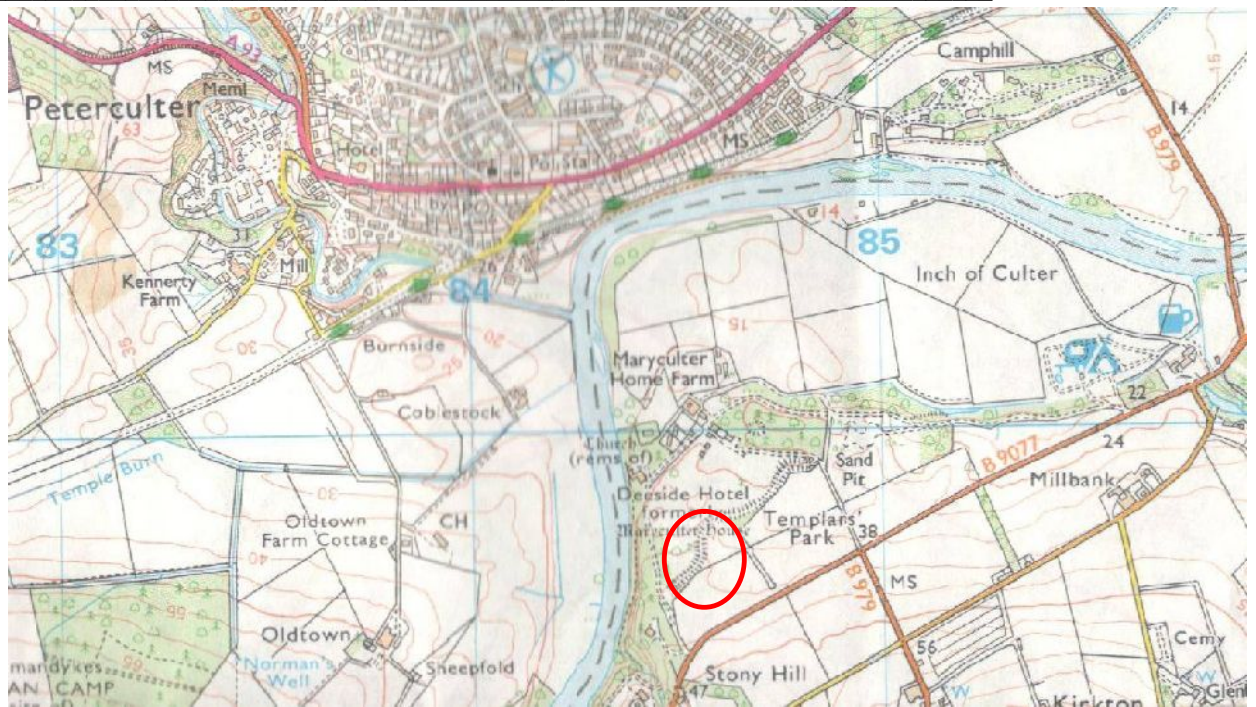
Illus 1 Location of site. Site indicated by red circle.