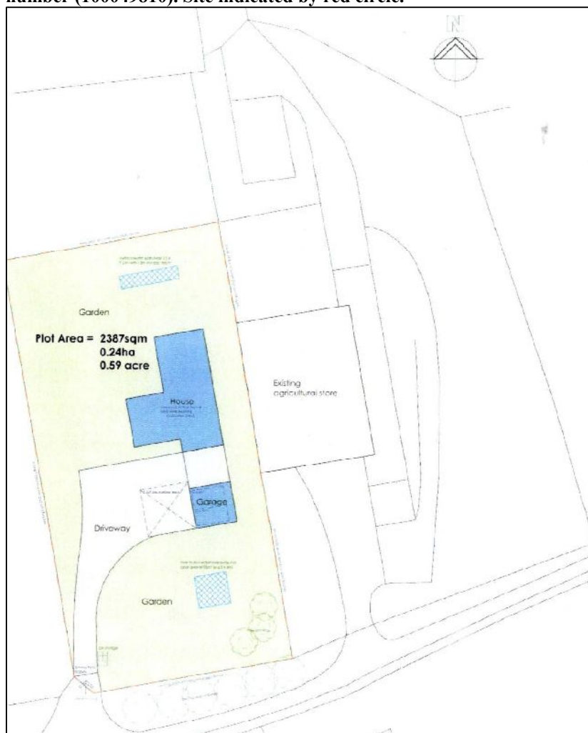
Illus 2 Site plan courtesy of Gerry Robb, Architectural Design Services.