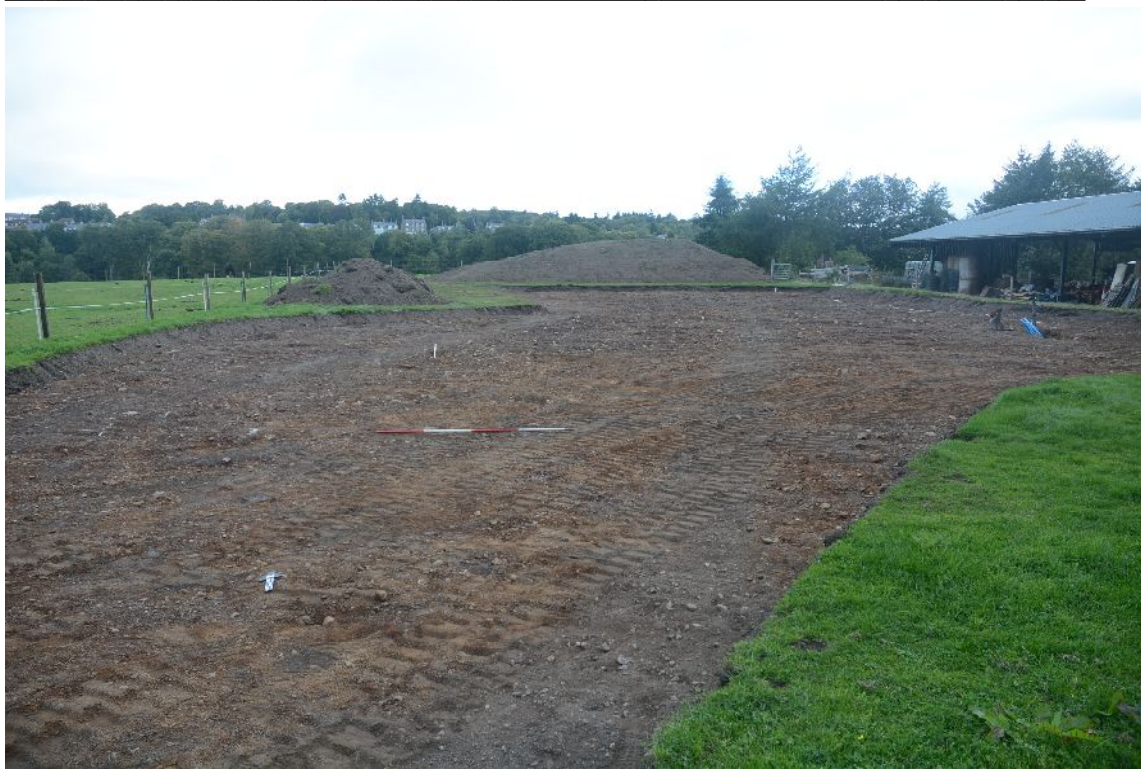
Illus 3 Site with topsoil stripped, looking N