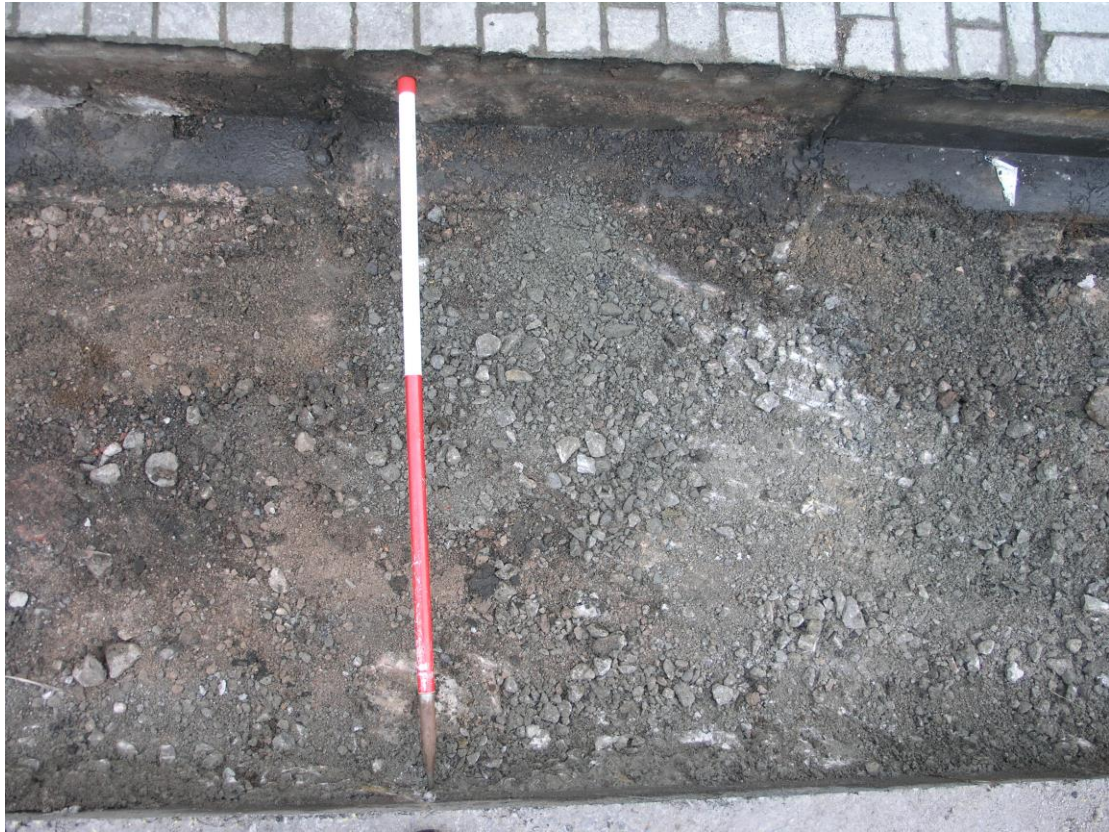
Plate 2: Trench fill showing disturbed gravel and modern deposits at 0.3m below current ground surface.