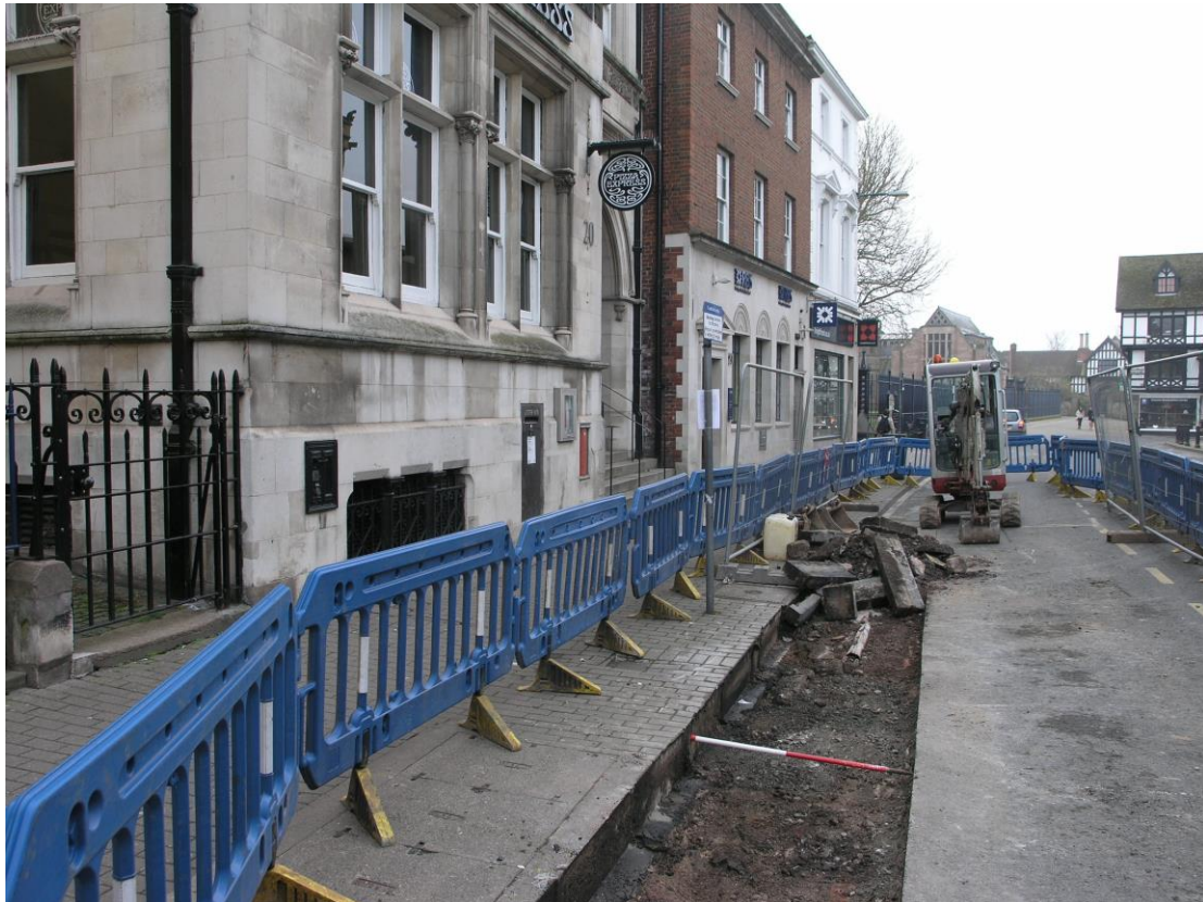
Plate 1: Trench looking South

No archaeologically significant deposits were encountered.