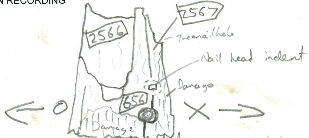
Diagram of Orientation on Inboard face

Notable Features: [tool marks, scribed lines, decoration, repairs] POINTS TO LOOK OUT FOR WHEN RECORDING