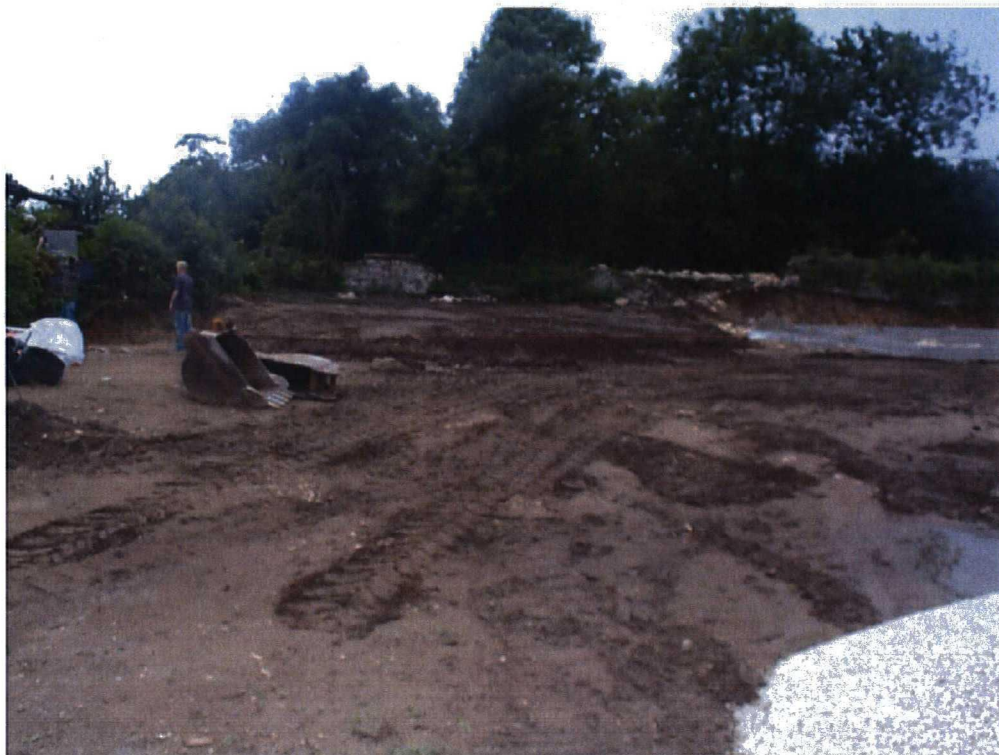
Plate 2. Stripped South West Area of Site. Facing West