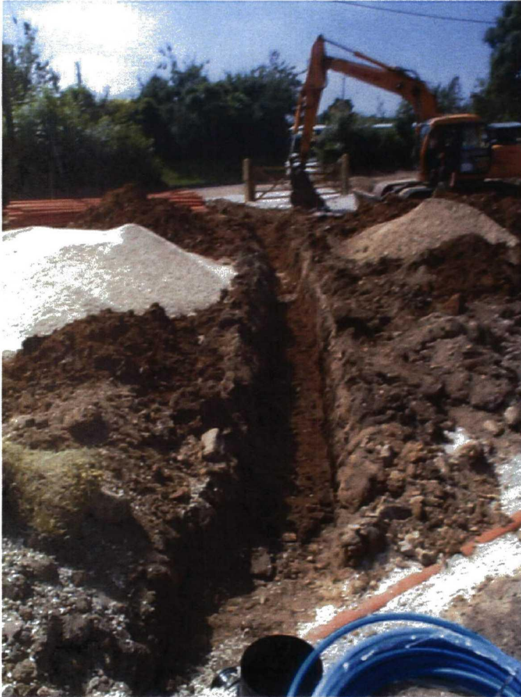
Plate 3. Service Ducts Post Excavation. Facing South