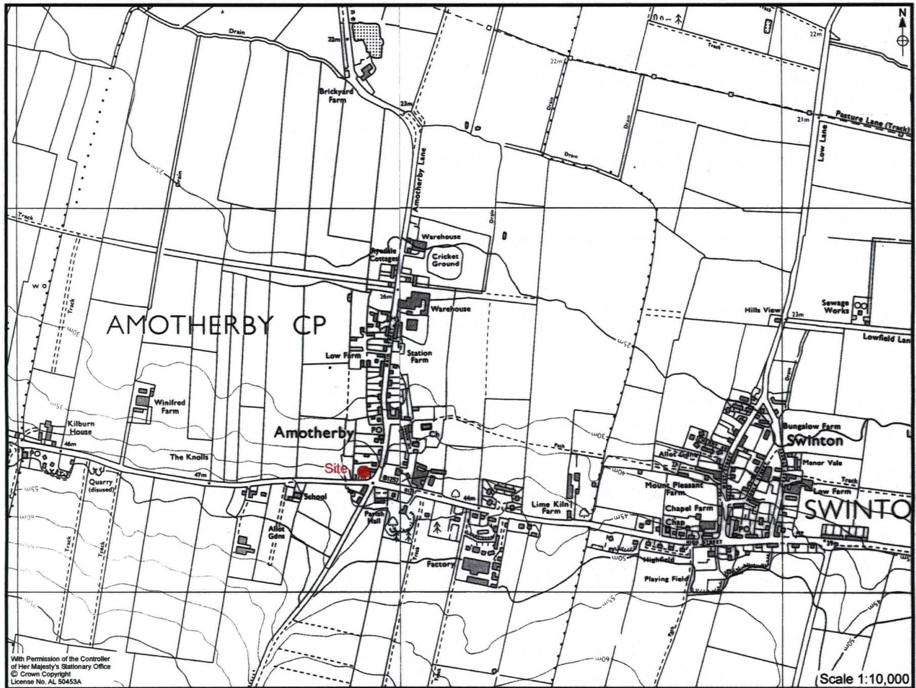
Figure 2. Area of Development