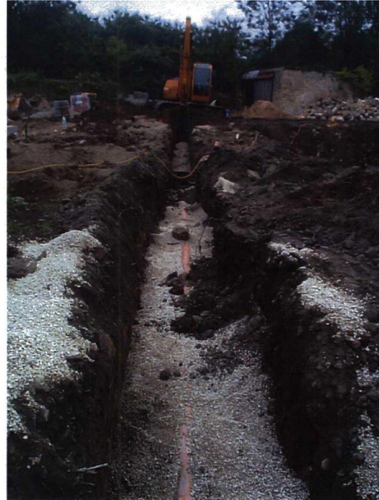
Plate 4. Service Ducts Post Excavation. Facing North