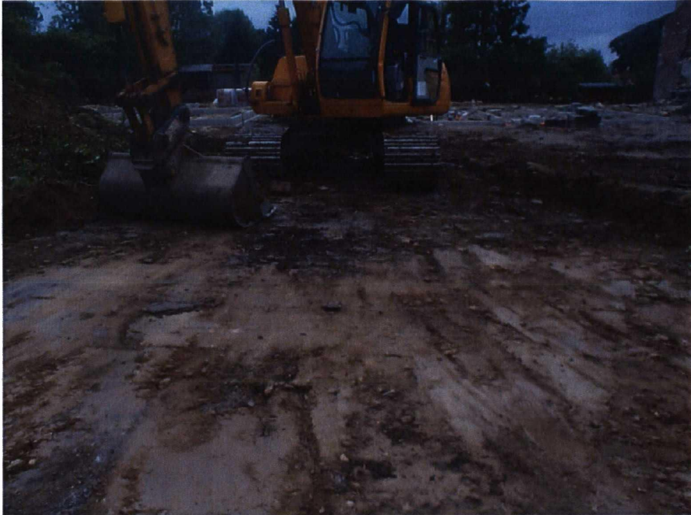
Plate 1. General View of Excavation in Progress. Facing North