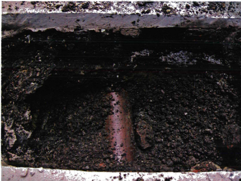
Trench at completion of excavation