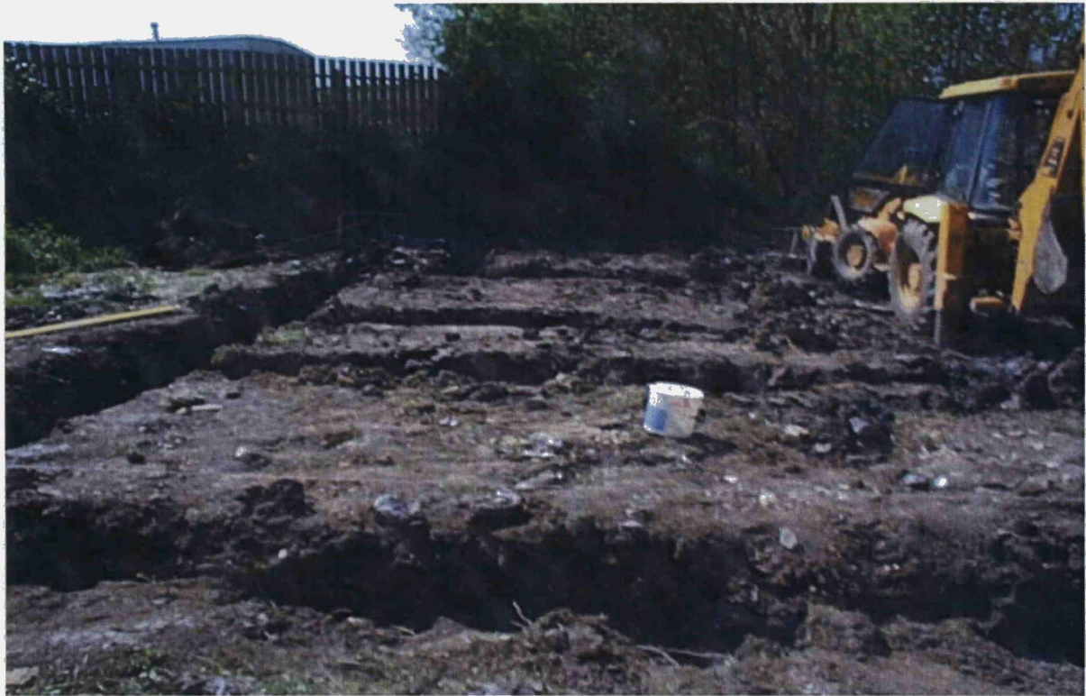
Plate 3. General Working View of Foundations. Facing West