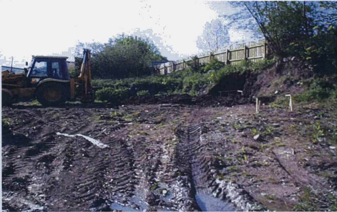
Plate 1. Overall View of Site. Facing South