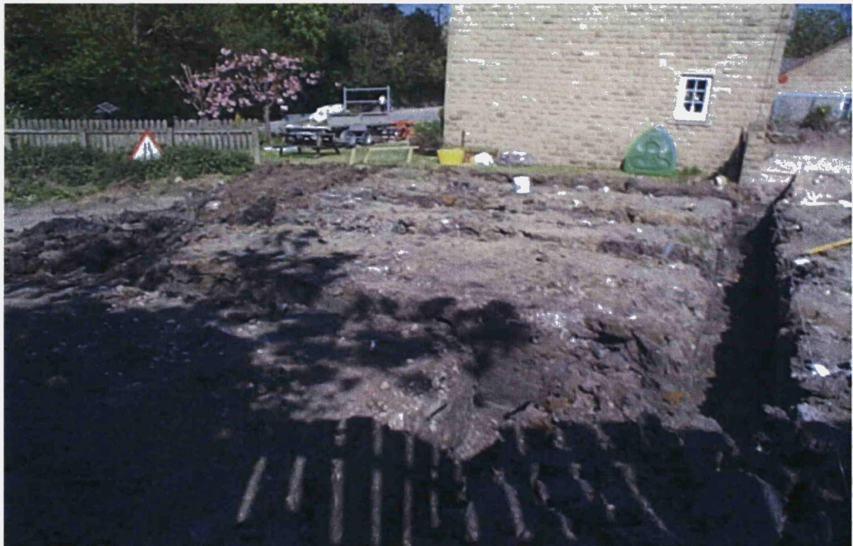
Plate 4. Final Excavation View of Foundations. Facing East