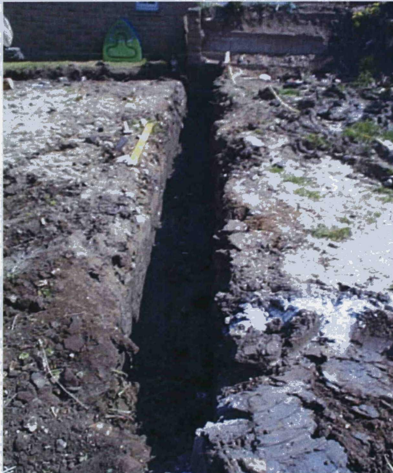
Plate 2. Post-Excavation View of South East Foundation. Facing East