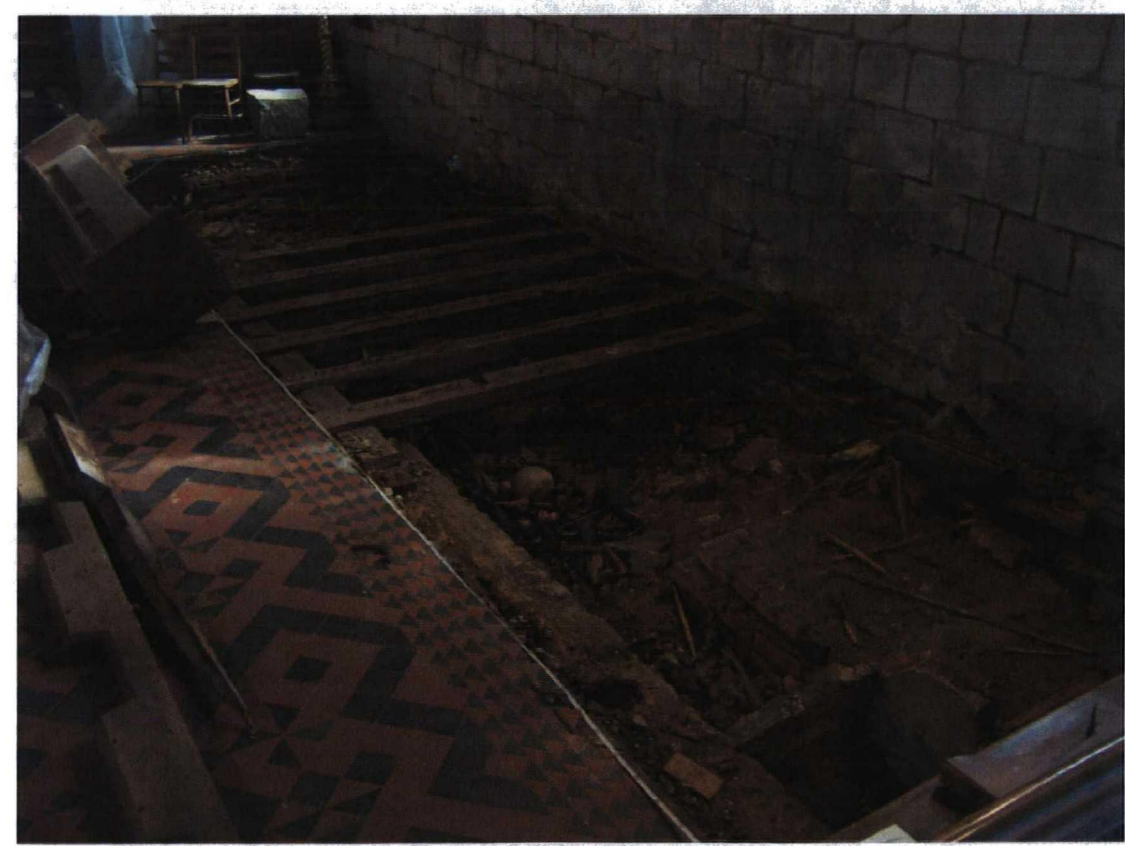
Plate 8 The southern pews, following removal of the seating, viewed from the north-west.