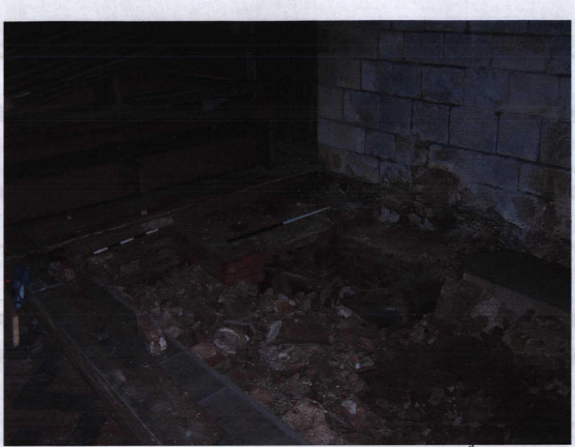
Plate 3 The western end of the northern pews: limestone and chalk foundations, 19<sup>th</sup> century services, church foundations and underpinning, modern concrete beams and rubble, looking northwest.