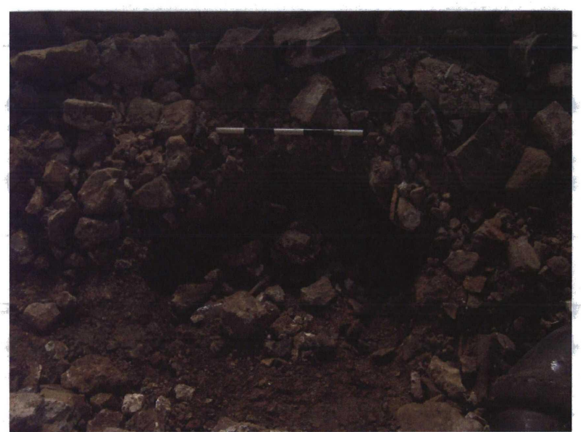
Plate 7 Collapse/depression (1025) within (1013), looking south-west.