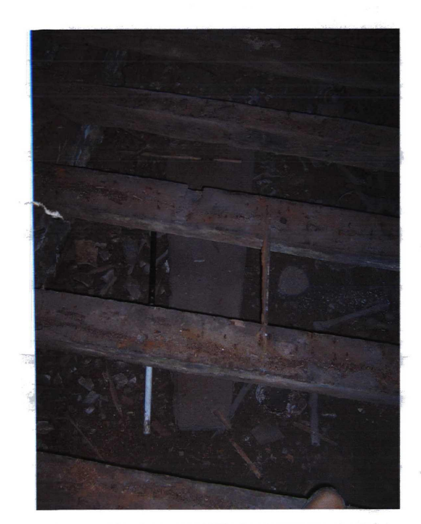
Plate 15 Individual coffin lid within context (2014), looking south-west.