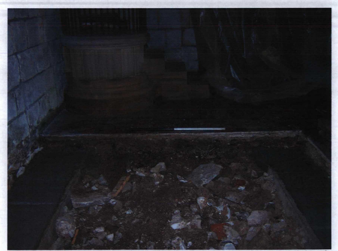
Plate 6 The eastern end of the northern pews showing layers (1003), (1004) and (1002) underlying the black and blood-red floor tiles (1001), looking east. Note modern rubble (1013).