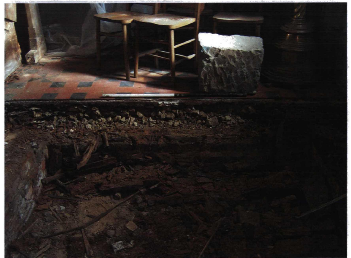
Plate 16 19<sup>th</sup> century floor (2001) and associated hardcore overlying 19<sup>th</sup> century brick foundations (2004), at the eastern end of the southern pews, viewed from the west.