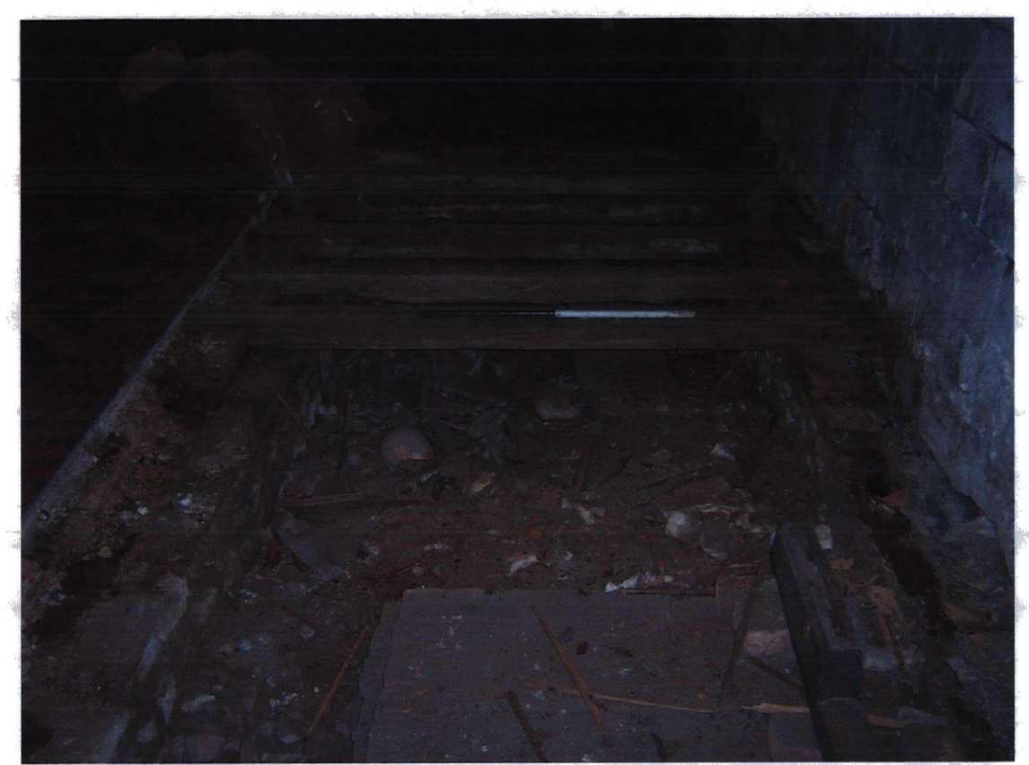
Plate 13 Remains of spoil (2011) leading to the disarticulated human remains (2014) in the western and central area of the south pews, looking east.