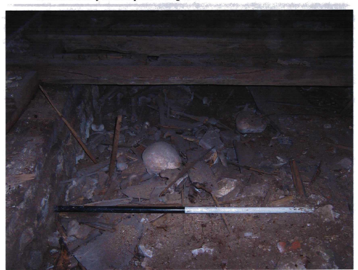
Plate 14 Detail of the arrangement of the disarticulated human remains (2014), viewed from the west.