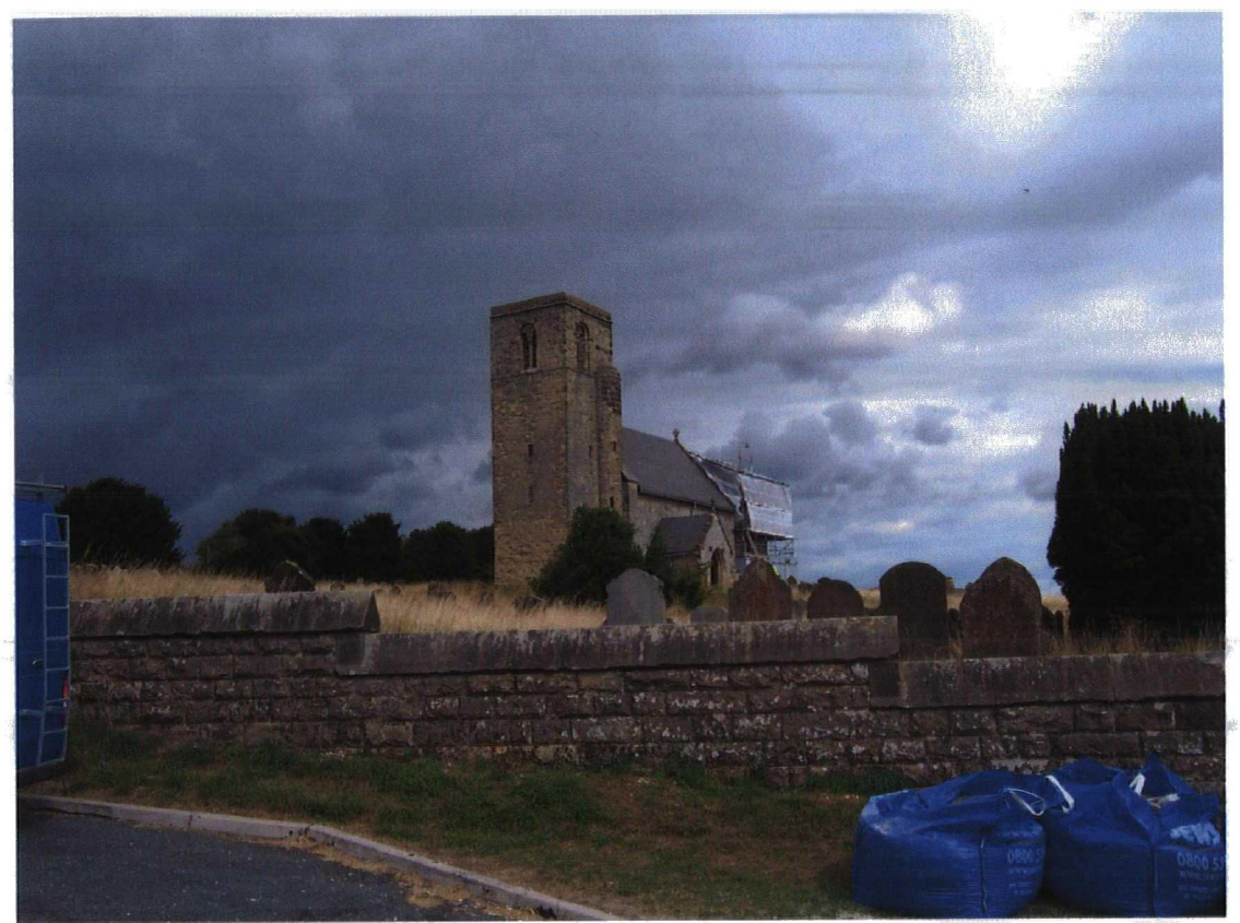
Plate 1 St. Andrew's, Weaverthorpe, viewed from the south-east.