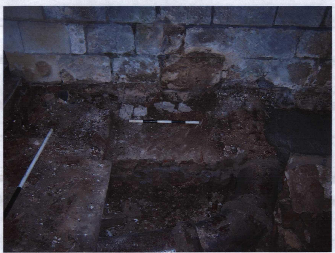
Plate 5 Brick underpinning (1020) for church wall (1021) overlying compact chalky clays (1018), showing 19<sup>th</sup> century air duct (1015) to right and mid left. Viewed form the south.