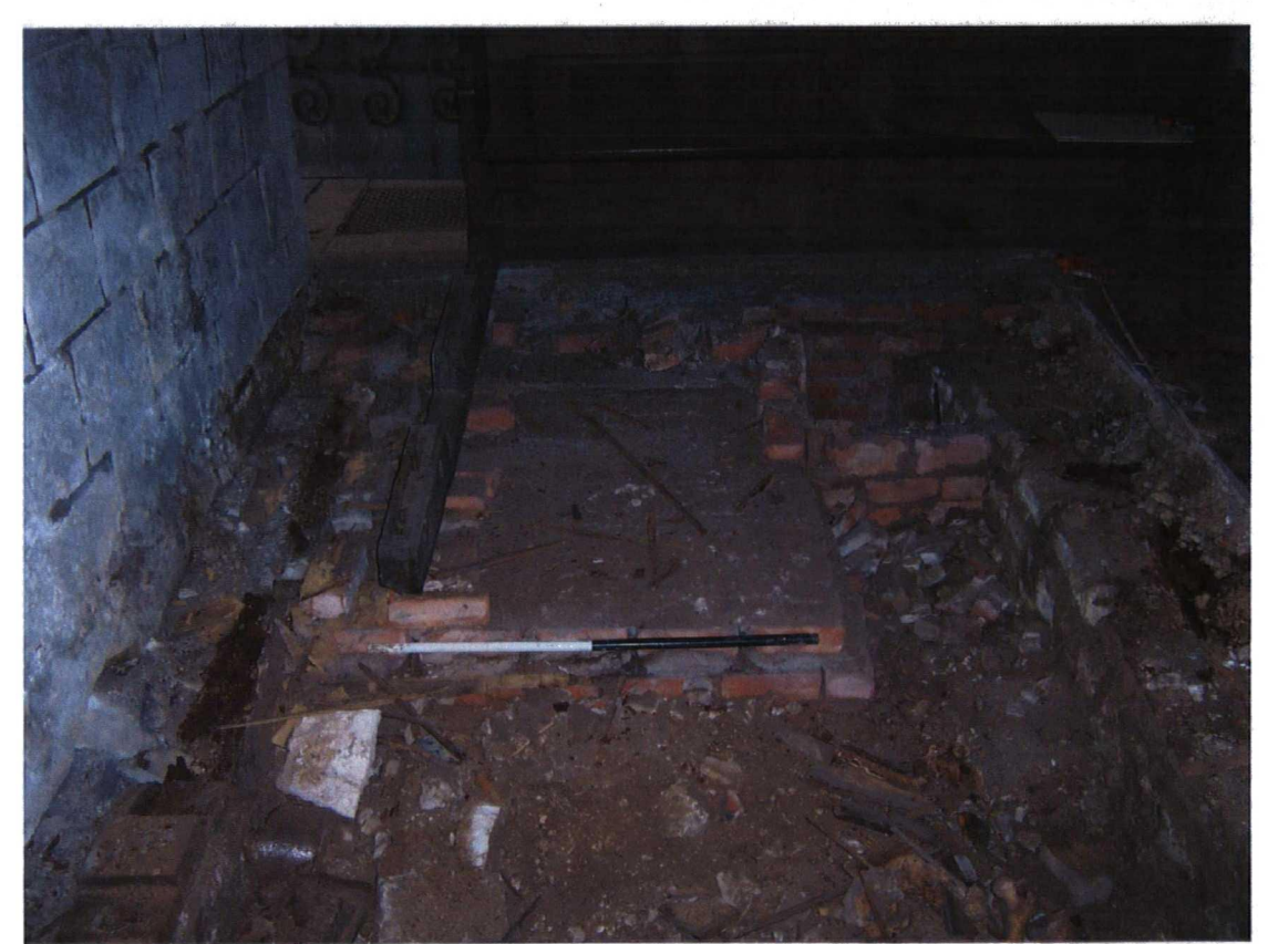
Plate 12 The likely 19th century brick structure (2007), with (2008) to the right, viewed from the east.