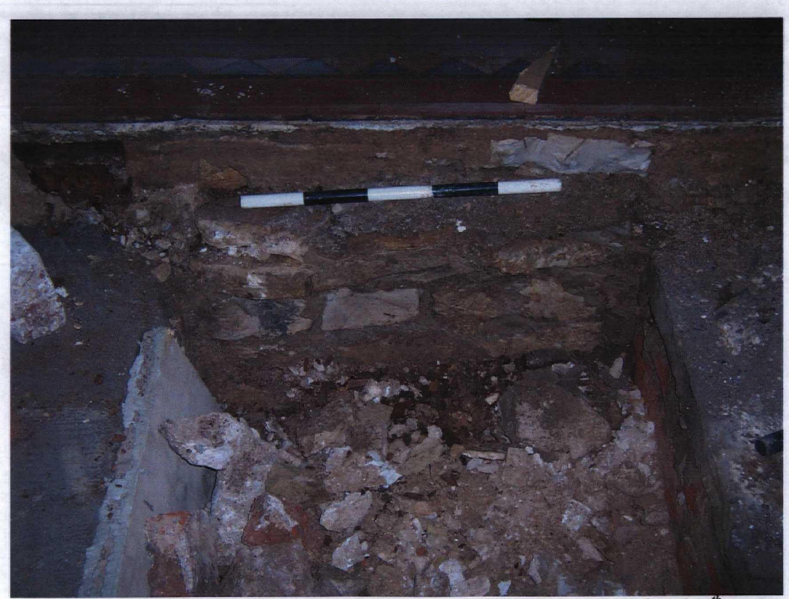
Plate 4 The isolated limestone foundations (1012), with concrete(1005) to the left and 19<sup>th</sup> century brick services to the right, looking west.