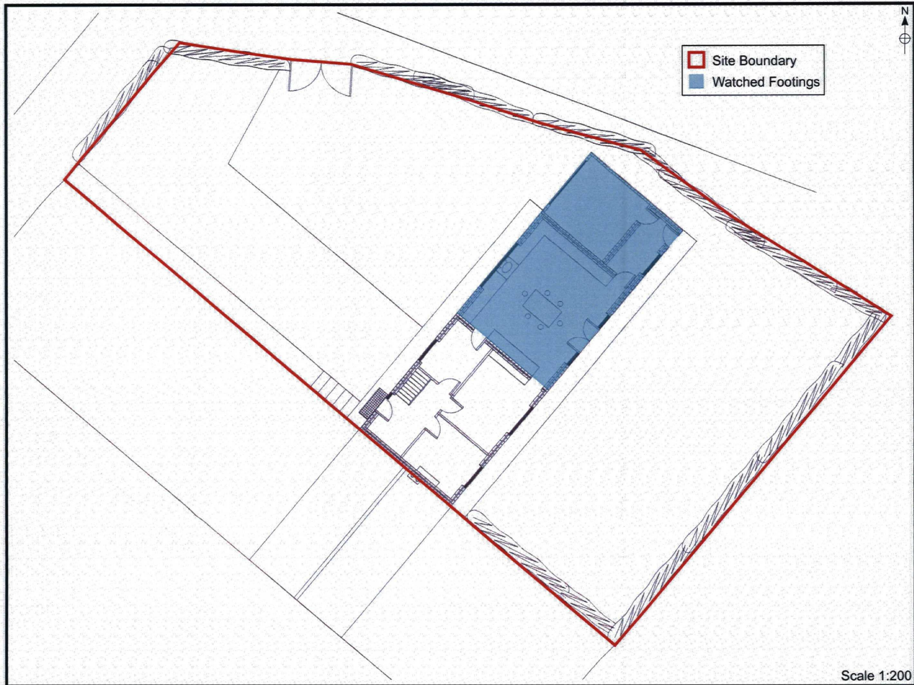
Figure 4. Watching Brief Area