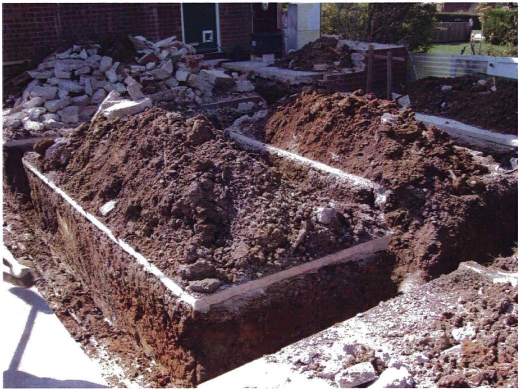
Plate 1. General View of Site. Facing West