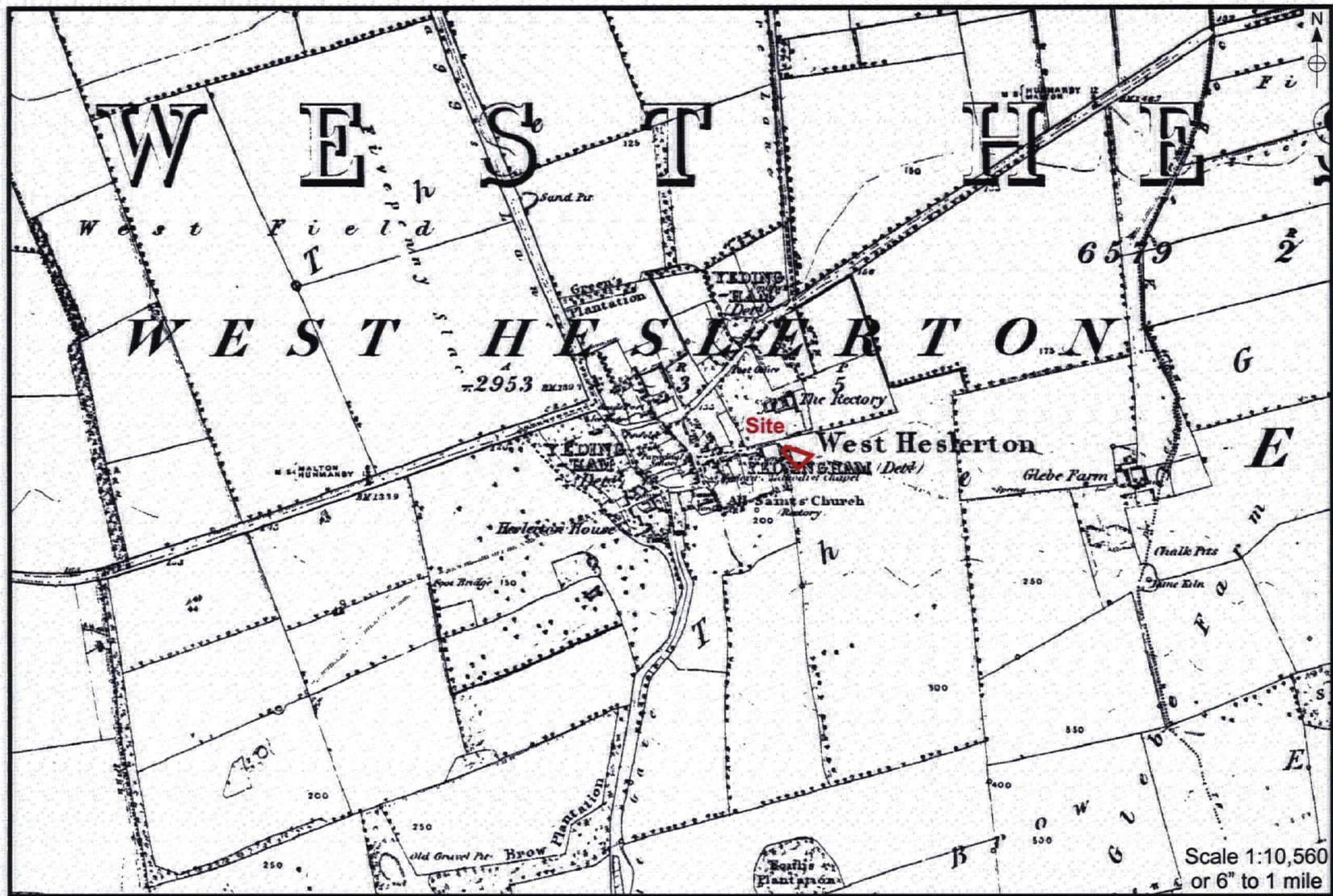
Figure 3. Extract from the 1853 First Edition Ordnance Map