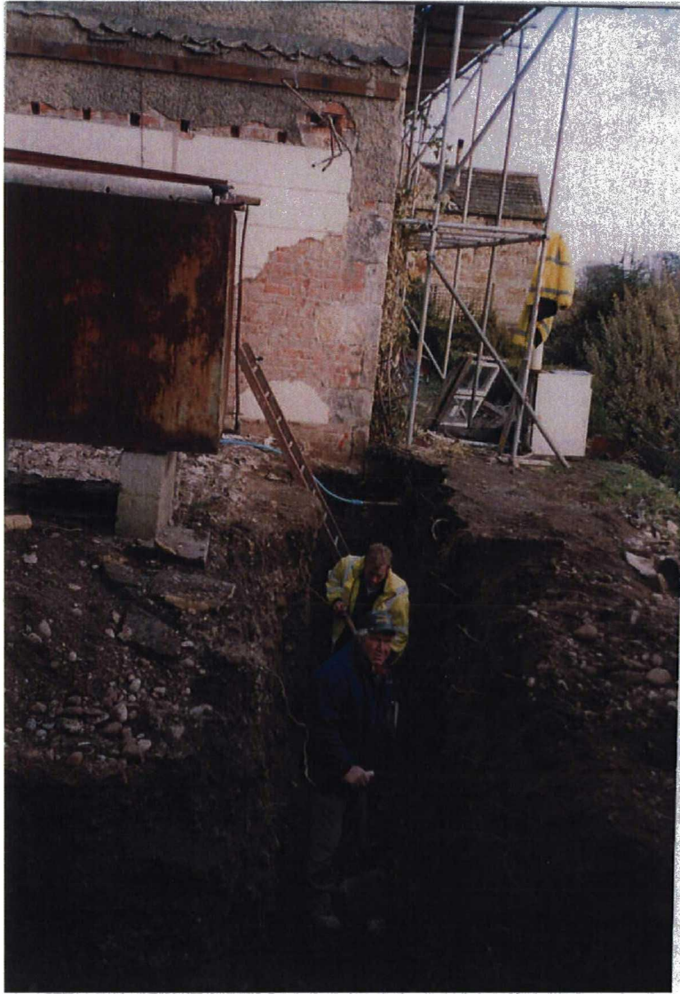
Plate3. Foundation Trench cut through sand and gravel. Facing East.