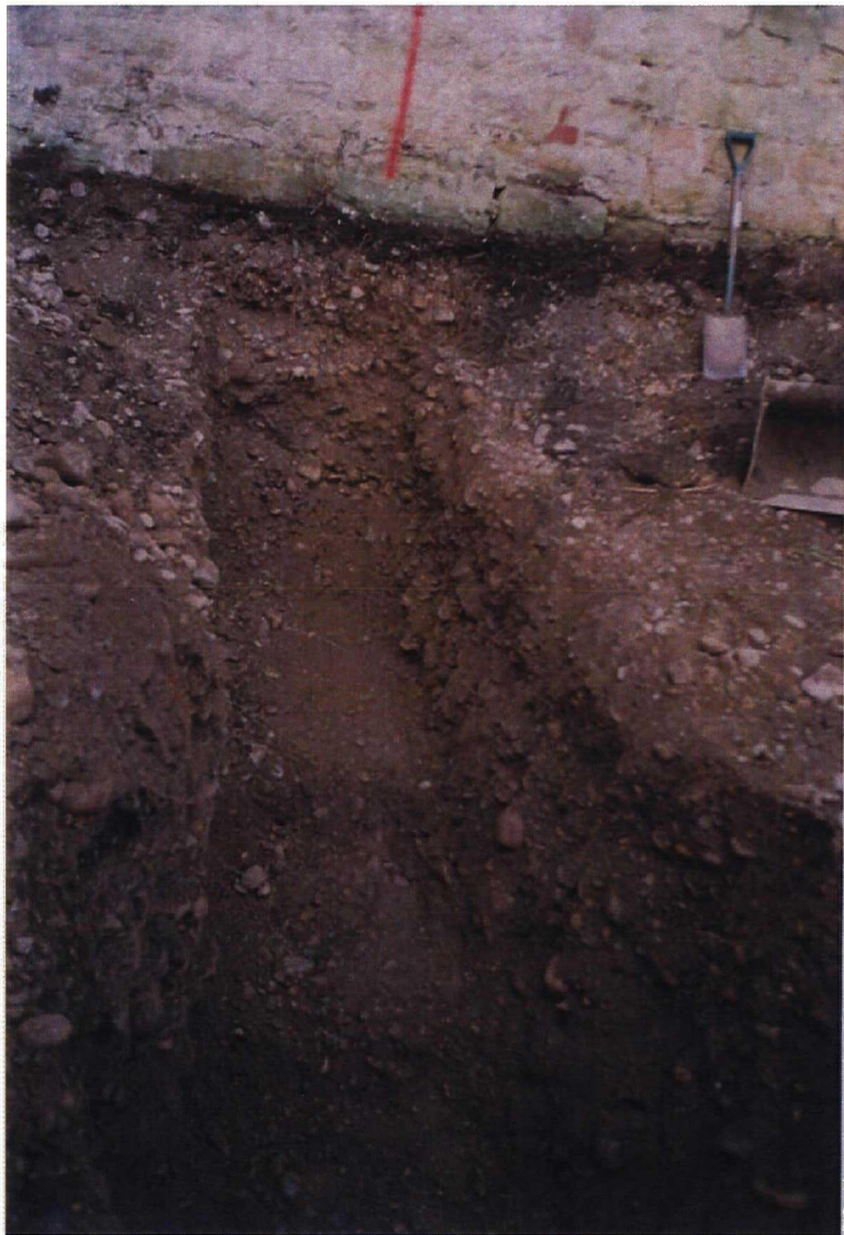
Plate 2. Foundation Trench cut through sand and gravel. Facing North.