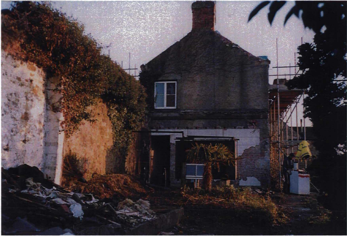
Plate 1. Watching Brief Area. Facing East.