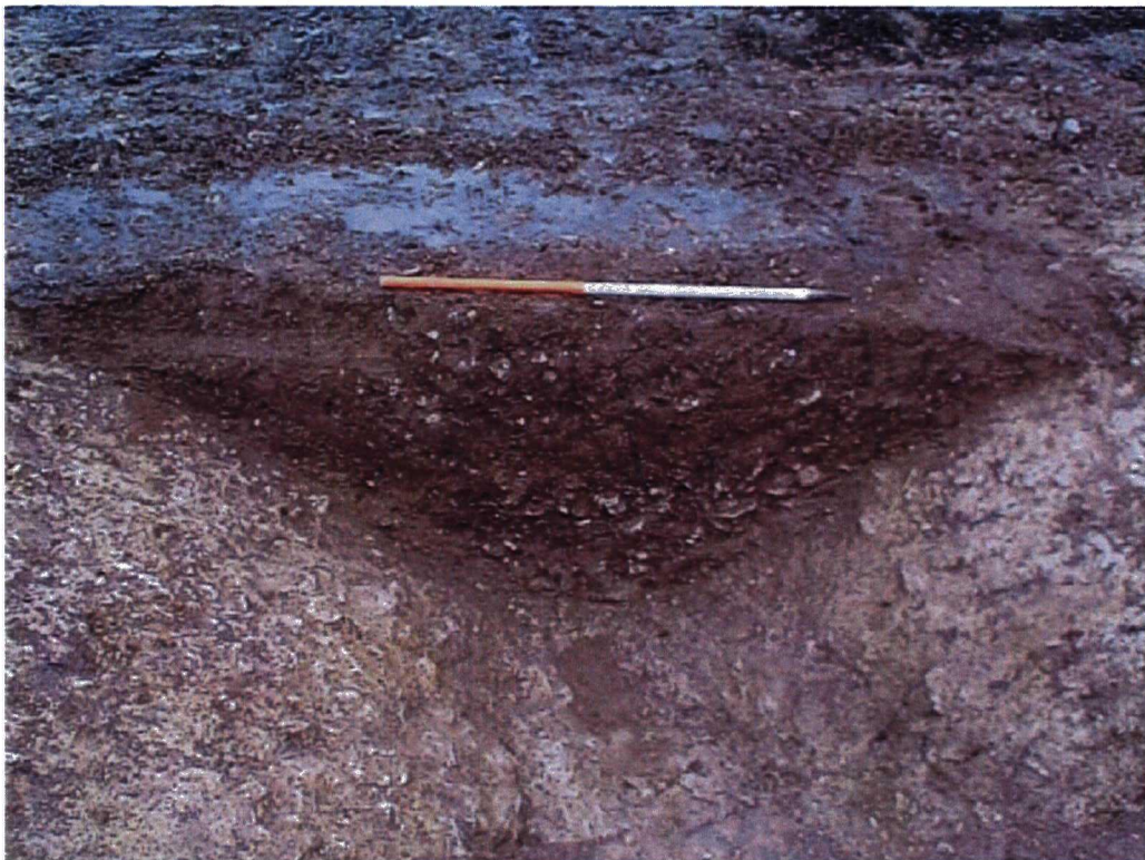
Plate 12. Ditch Segment: Cut 1012. Facing North