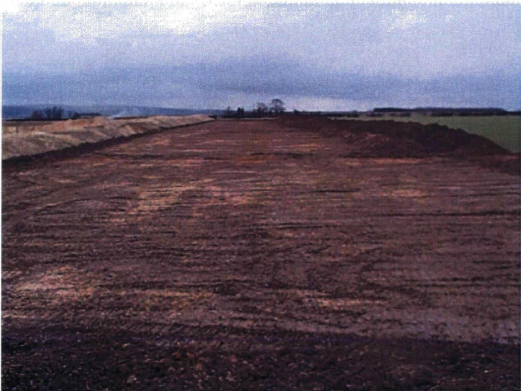
Plate 14. View of Stripped Area. Facing East