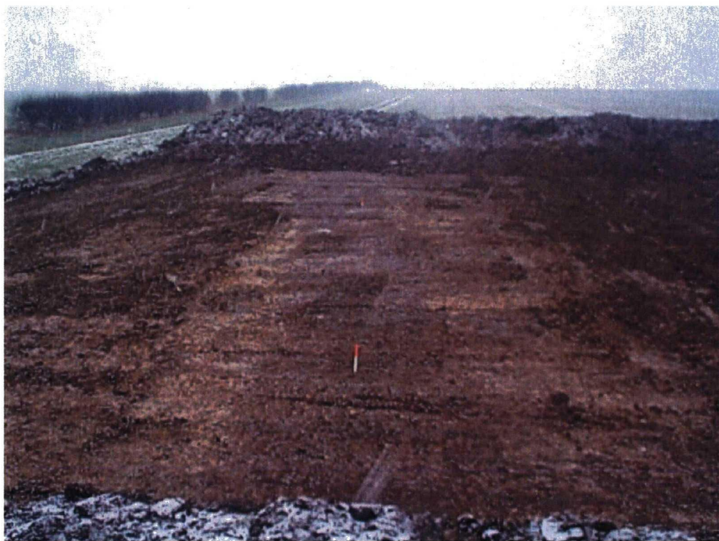
Plate 10. Pre-Excavation View of Ditch C. Facing South