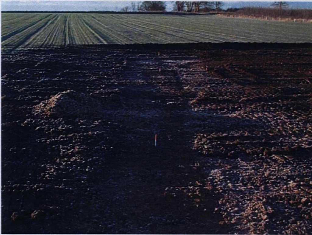
Plate 3. Pre-Excavation View of Ditch A. Facing South