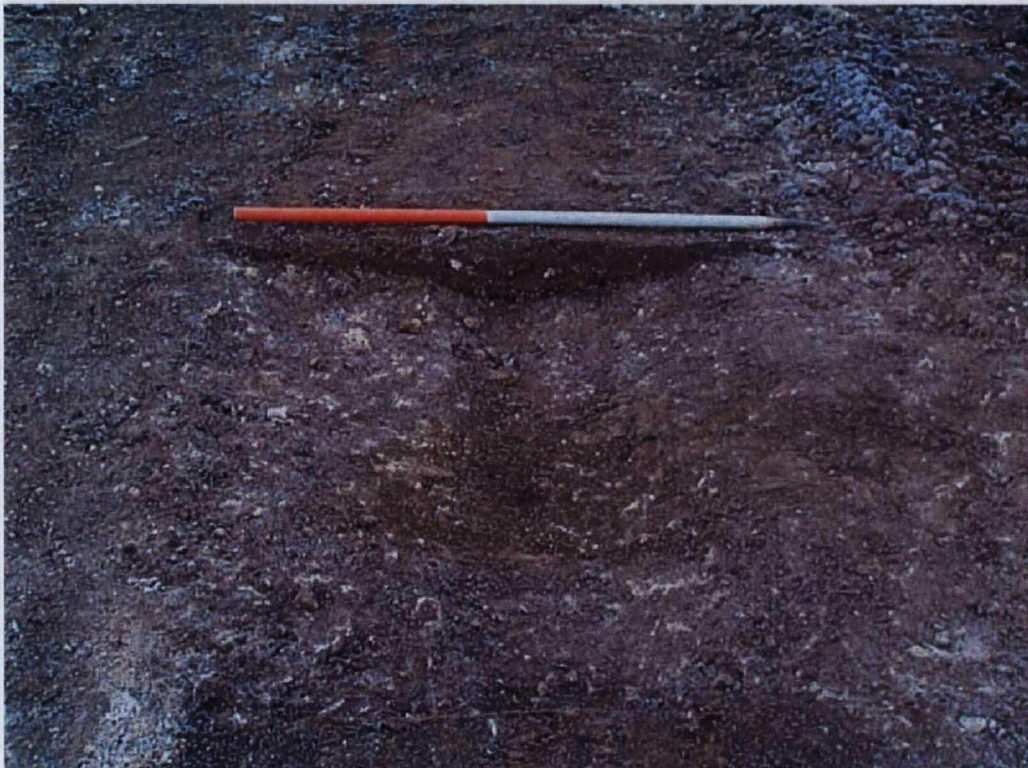
Plate 8. Ditch Segment: Cut 1009. Facing South