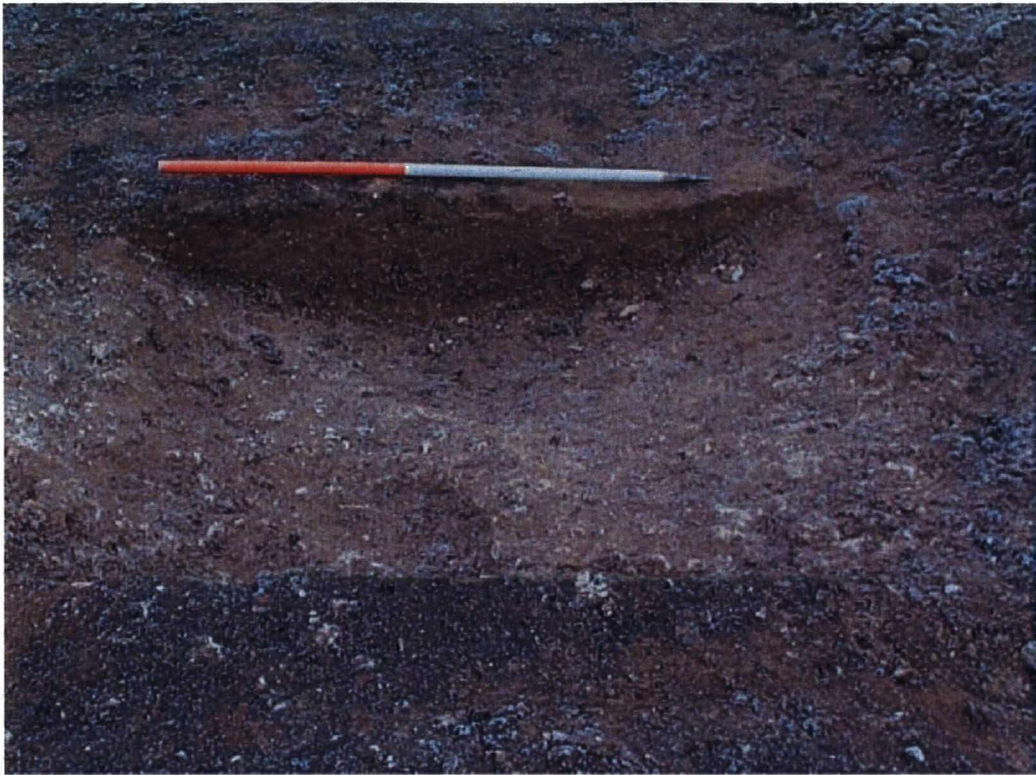
Plate 5. Ditch Segment: Cut 1005. Facing North