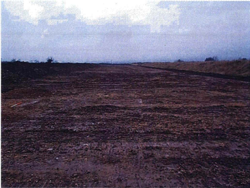
Plate 13. View of Stripped Area. Facing West