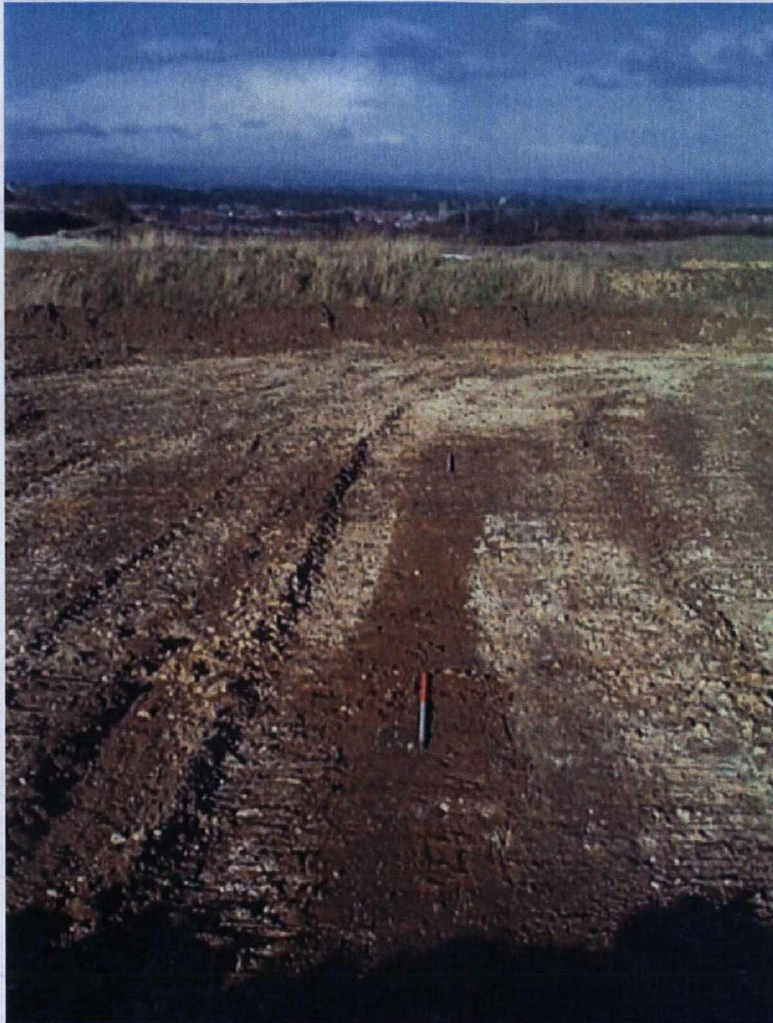
Plate 7. Pre-Excavation View of Ditch B. Facing North