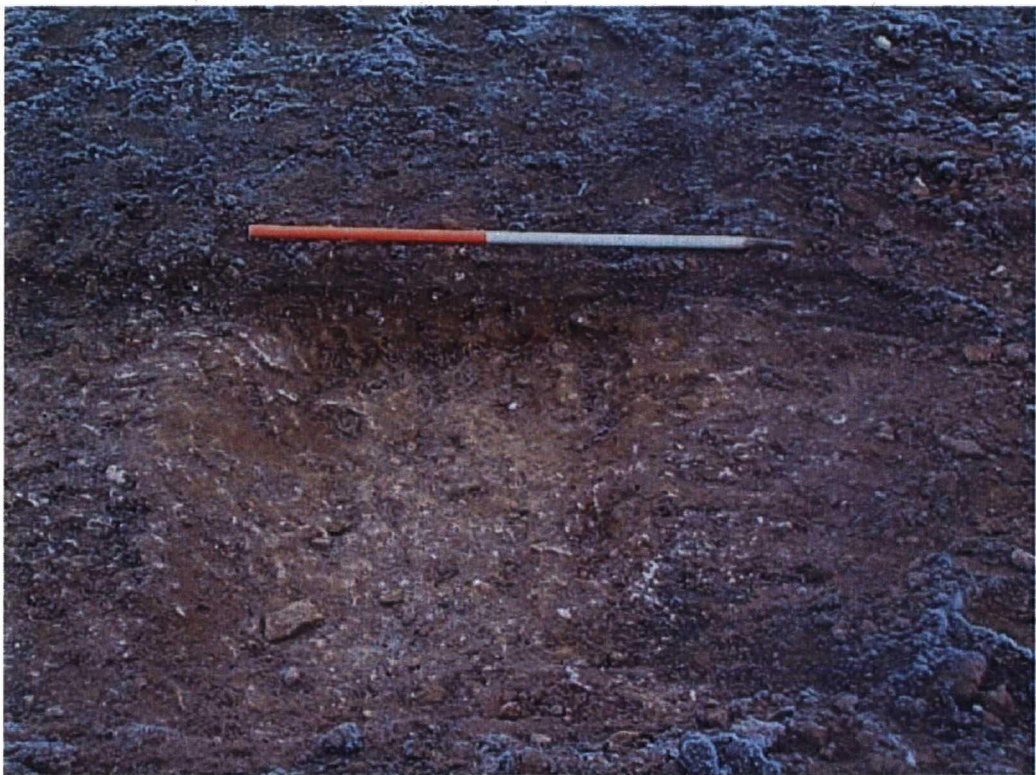
Plate 6. Ditch Segment: Cut 1007. Facing North