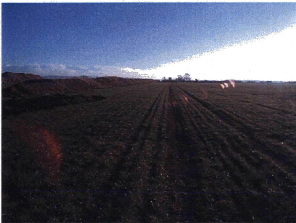
Plate 2. Pre-Excavation View of Site. Facing East