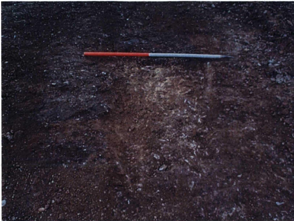
Plate 9. Ditch Segment: Cut 1011. Facing South