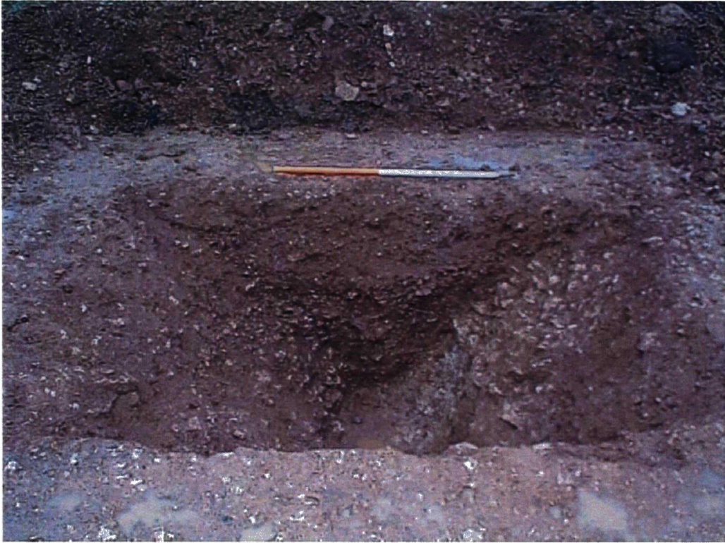
Plate 11. Ditch Segment: Cut 1019. Facing North