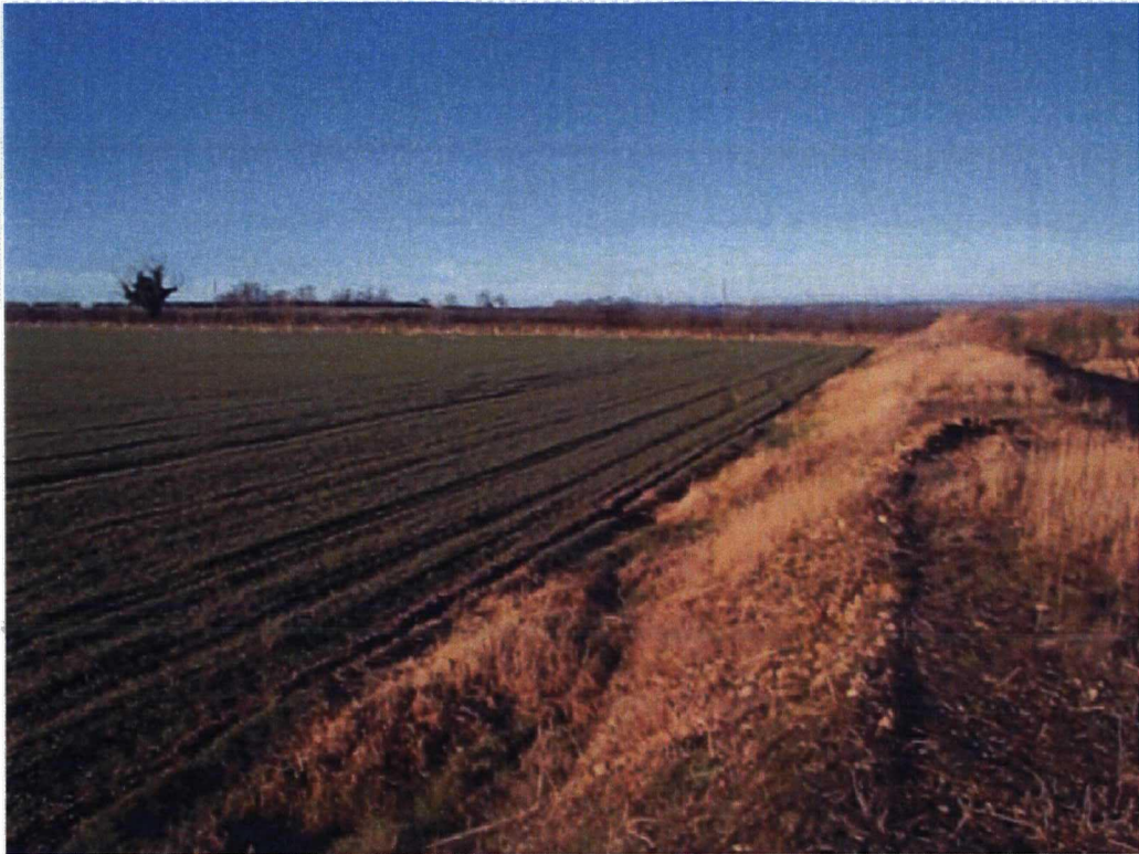
Plate 1. Pre-Excavation View of Site. Facing West