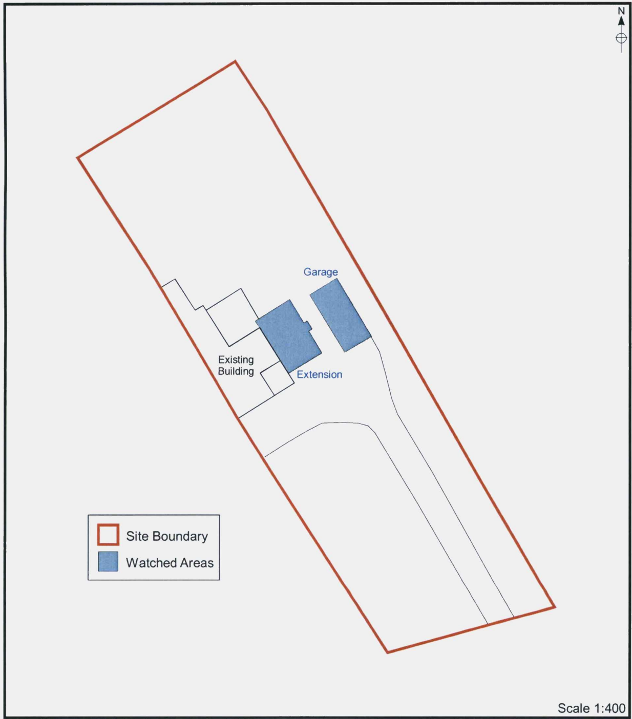
Figure 3. Area of Watching Brief