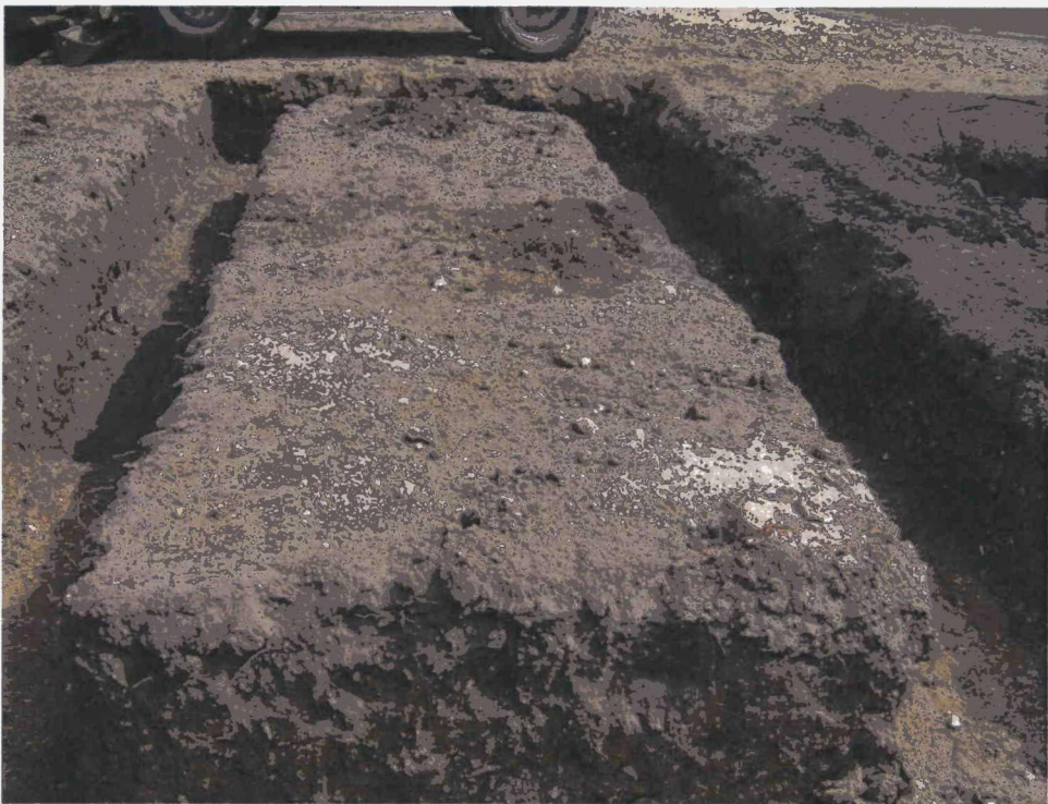
Plate 4. View of Garage Foundations. Facing South