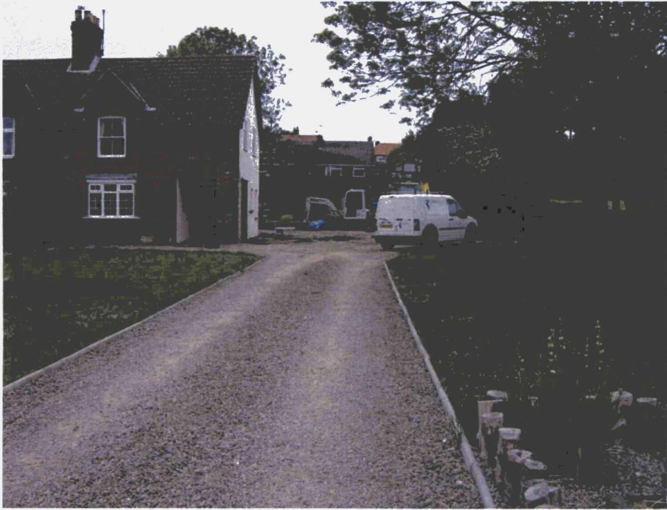
Plate 1. General View of Site. Facing North