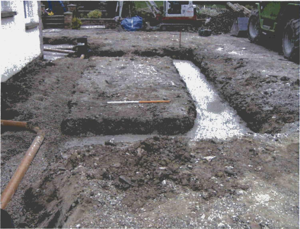
Plate 2. View of Extension Trenches. Facing North