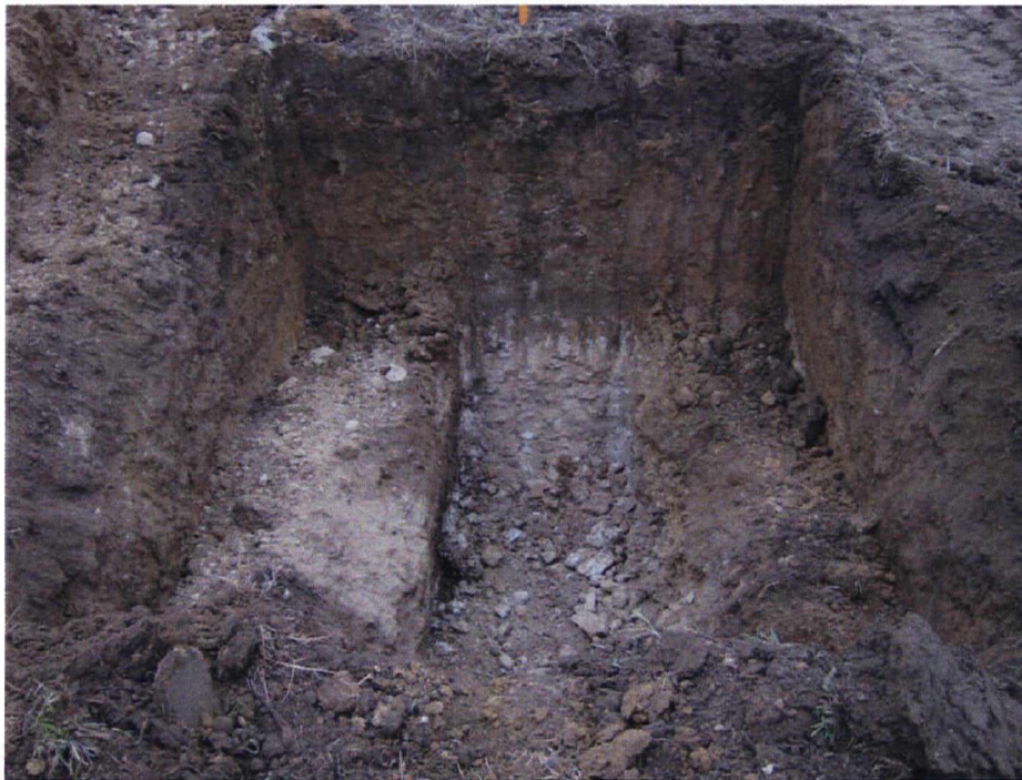
Plate 4. Post-Excavation View of Pylon Trench Four. Facing North