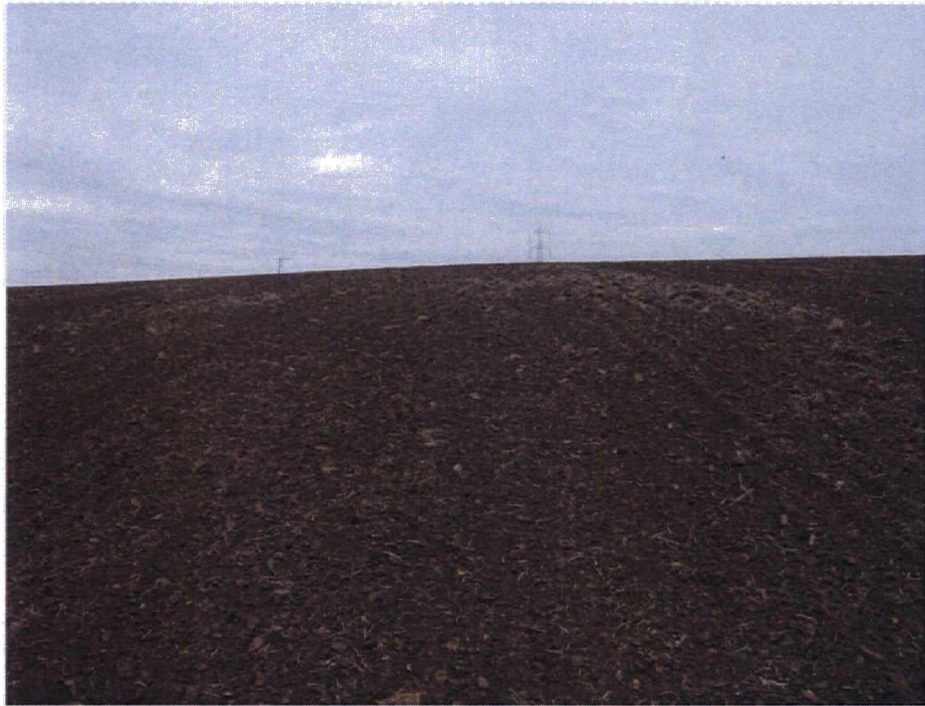
Plate 1. Pre-Excavation View of Site. Facing North