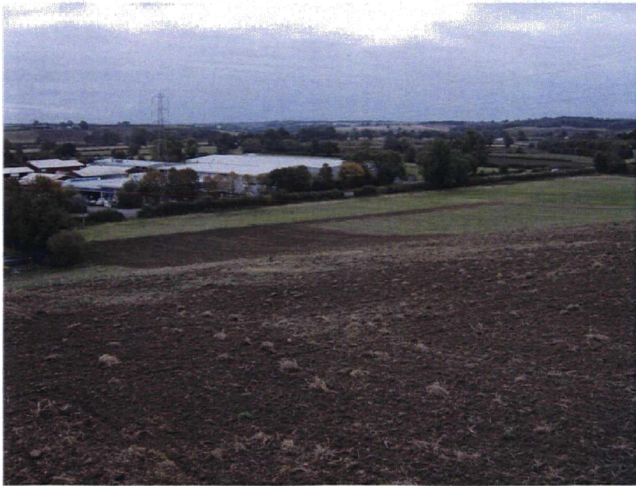
Plate 2. Pre-Excavation View of Site. Facing East