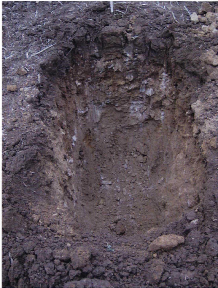
Plate 3. Post-Excavation View of Pylon Trench Three. Facing North