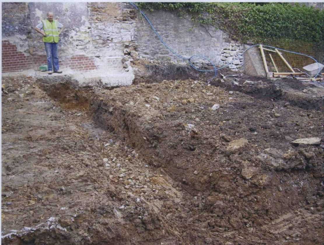
Plate 2. Foundation Trenches under excavation. Facing West.