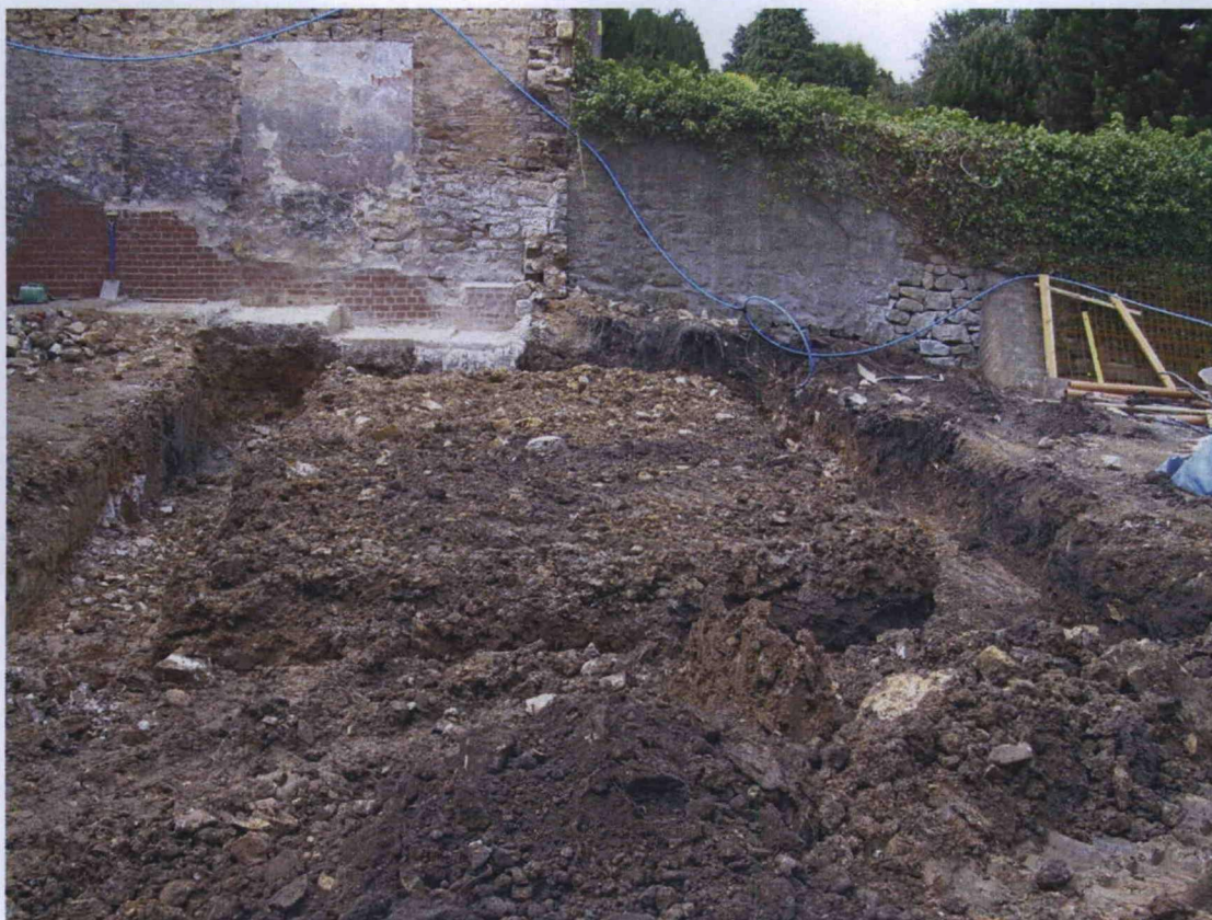
Plate 3. Foundations after excavation. Facing West.