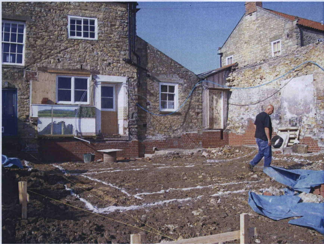
Plate 1. Site Prior to Excavation. Facing South-west.