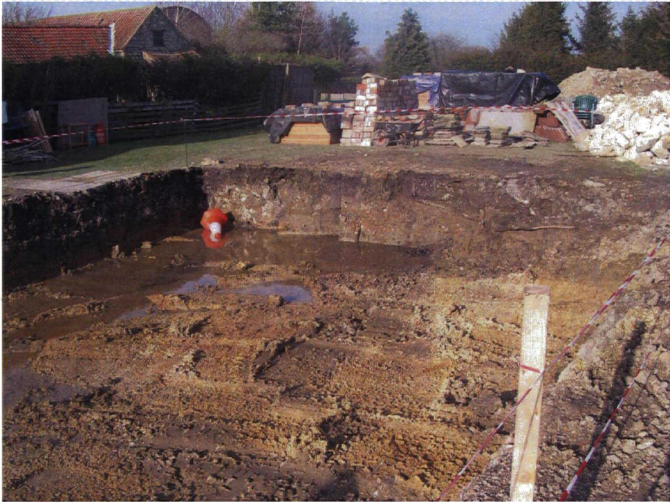
Plate 1. Foundation Area. Facing North-west.