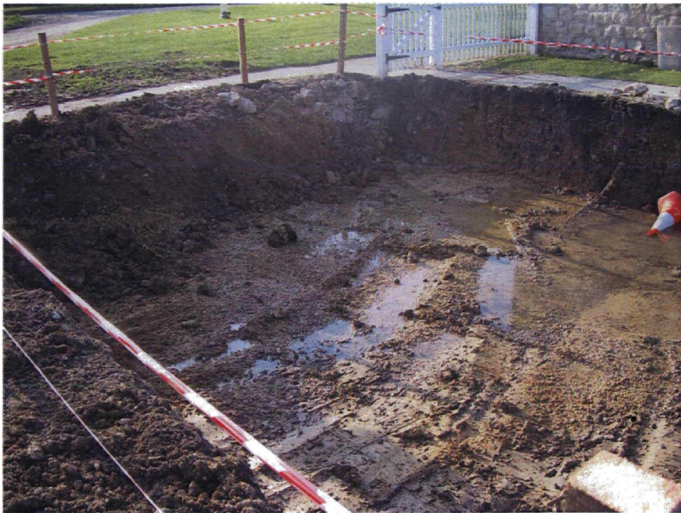
Plate 2. Foundation Area. Facing South-west.