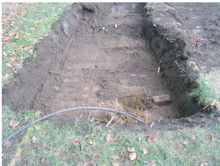
View north of west side of the top soil strip for the new toilet block foundation