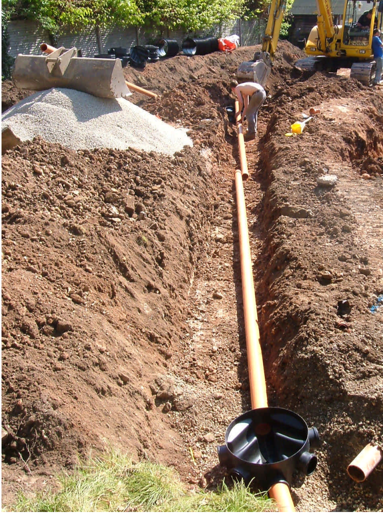
Plate 3. Drain Diversion Trench. Facing South West