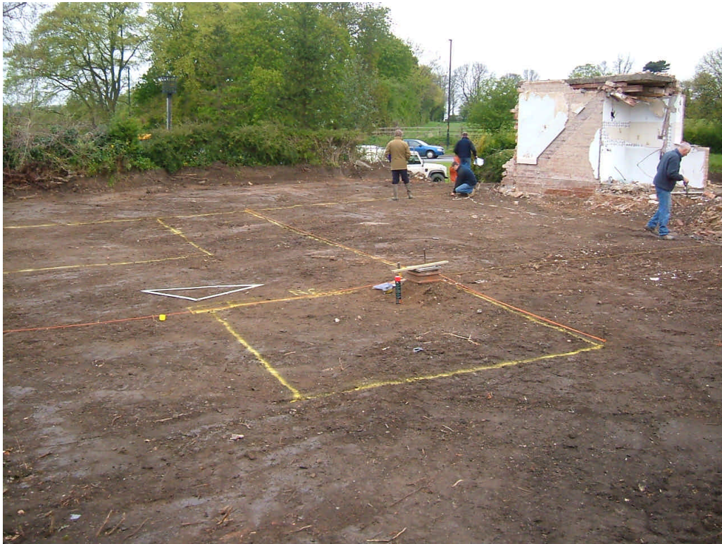
Plate 1. Development Plot Following Stripping. Facing North West