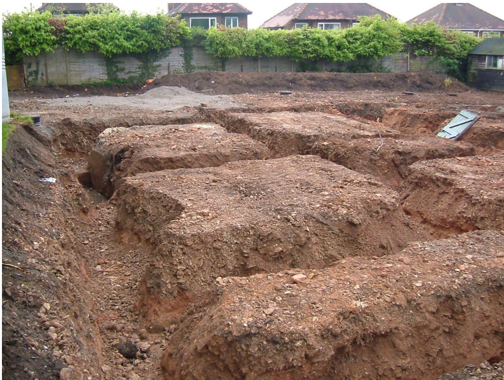
Plate 4. Overall Shot Following Excavation of Foundation Trenches. Facing South East