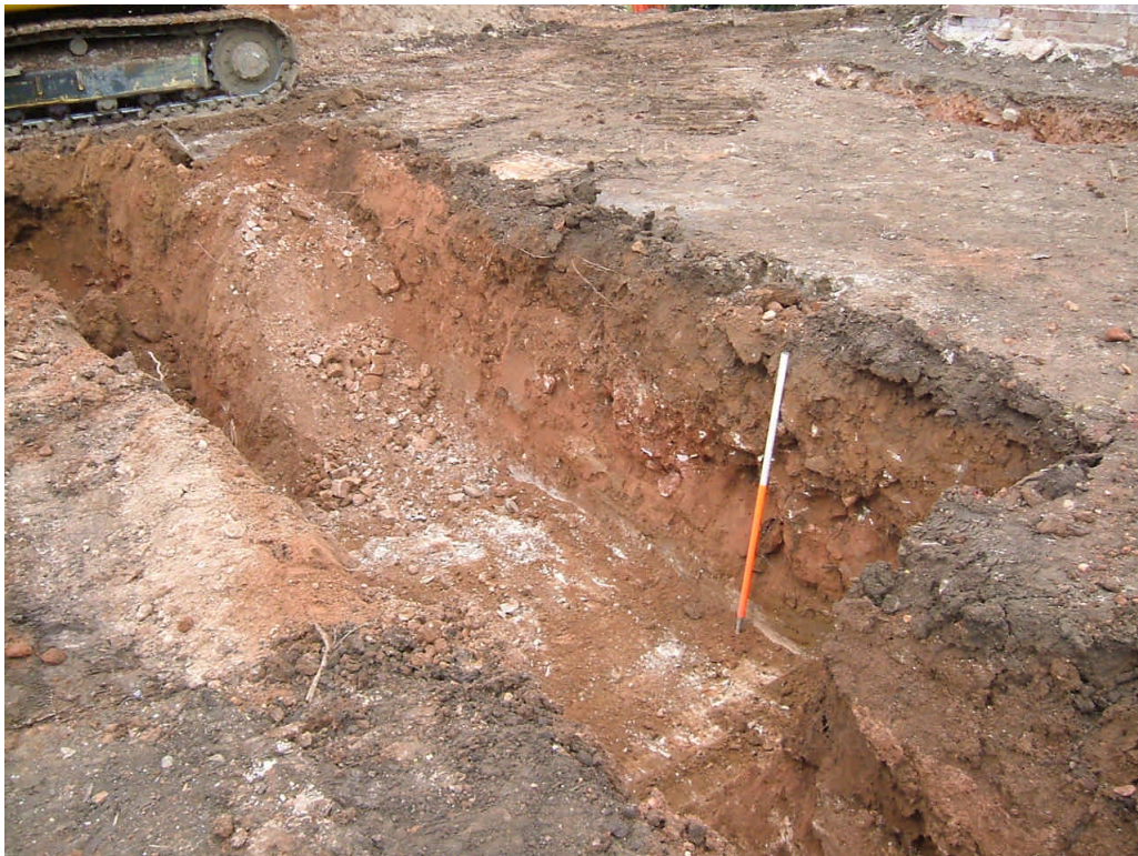
Plate 2. Foundation Trench. Facing North East