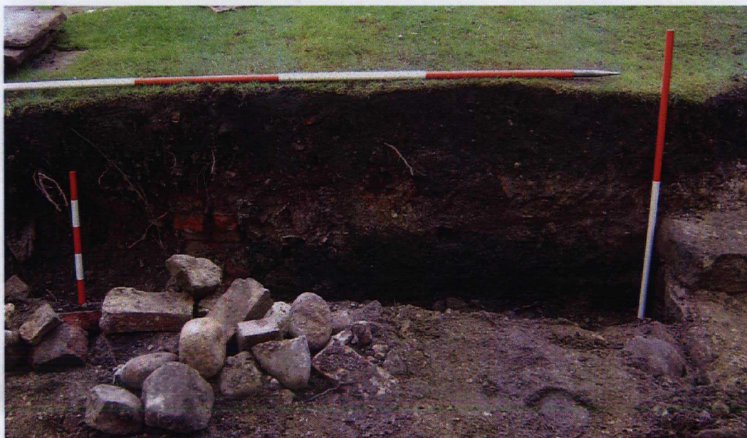
Fig 9. East-facing section showing the fill in Room 1, and the thin layer of plaster on the south side of Wall 2.