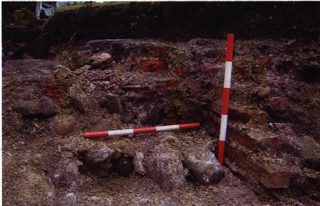
Figs 6 and 7. The masonry block under excavation, showing the crude walls of re-used brick and the cemented cobble/stone infill.