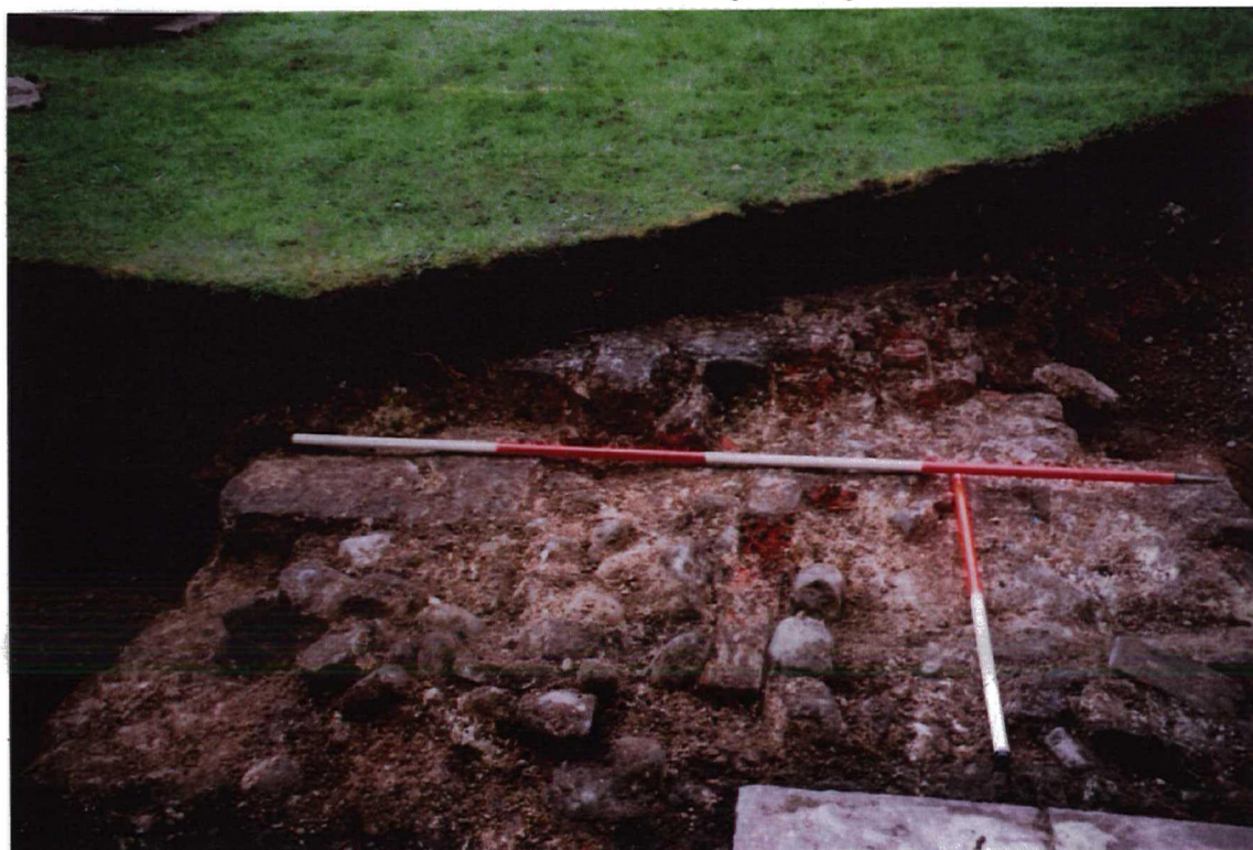
Fig 5. The masonry block during excavation