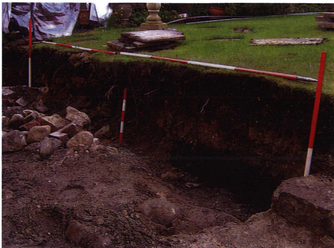
Fig. 4. The east facing section looking north, showing the edge of the masonry block, the fills of room 1 and the demolition layers beyond.