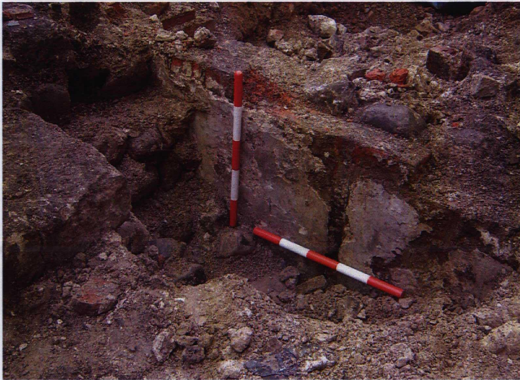
Fig 8. The south, interior side of Wall 1, showing the plaster with channeling, possibly for electric wiring.