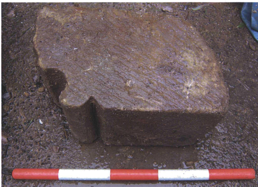
Plate 5. Part of a roll-moulded window jamb from the abbey. Scale 0.5m