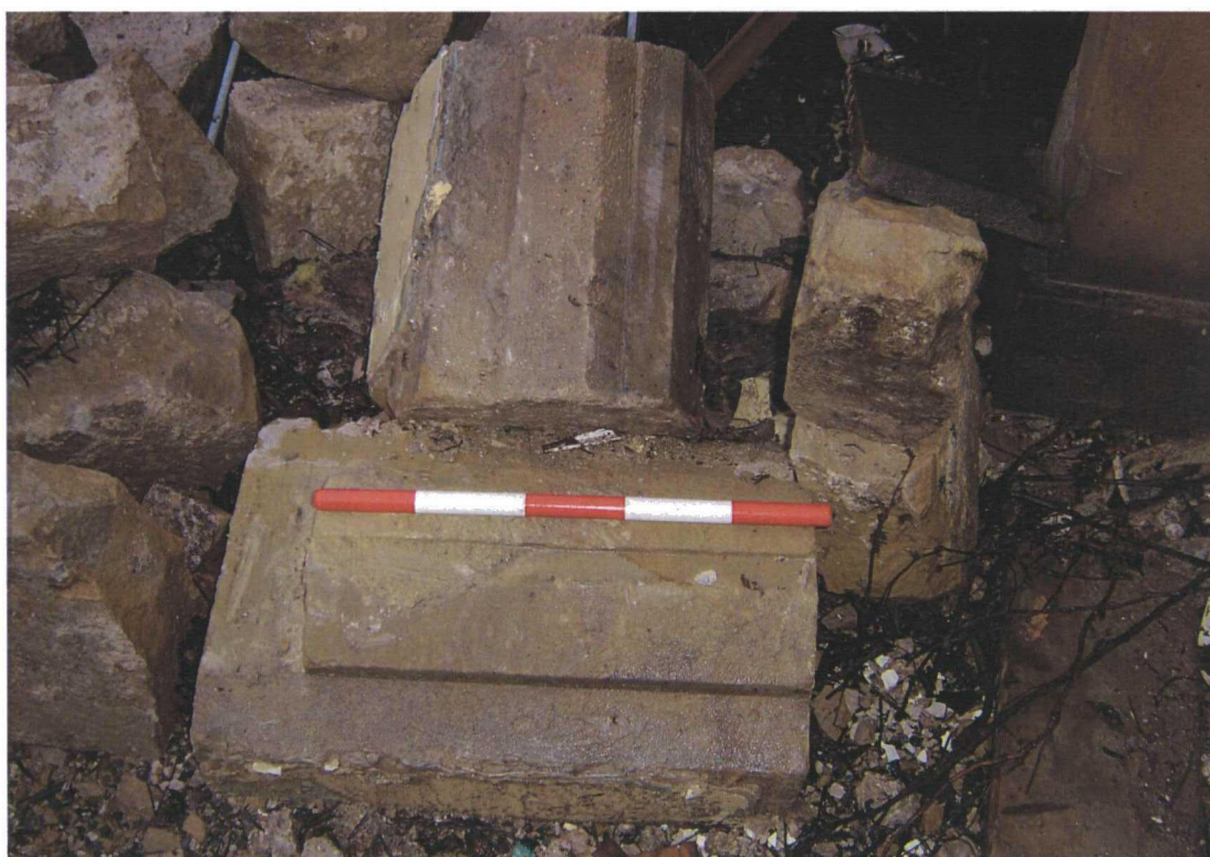
Plate 4. Two large pieces of window sill re-used from the abbey. Scale 0.5m