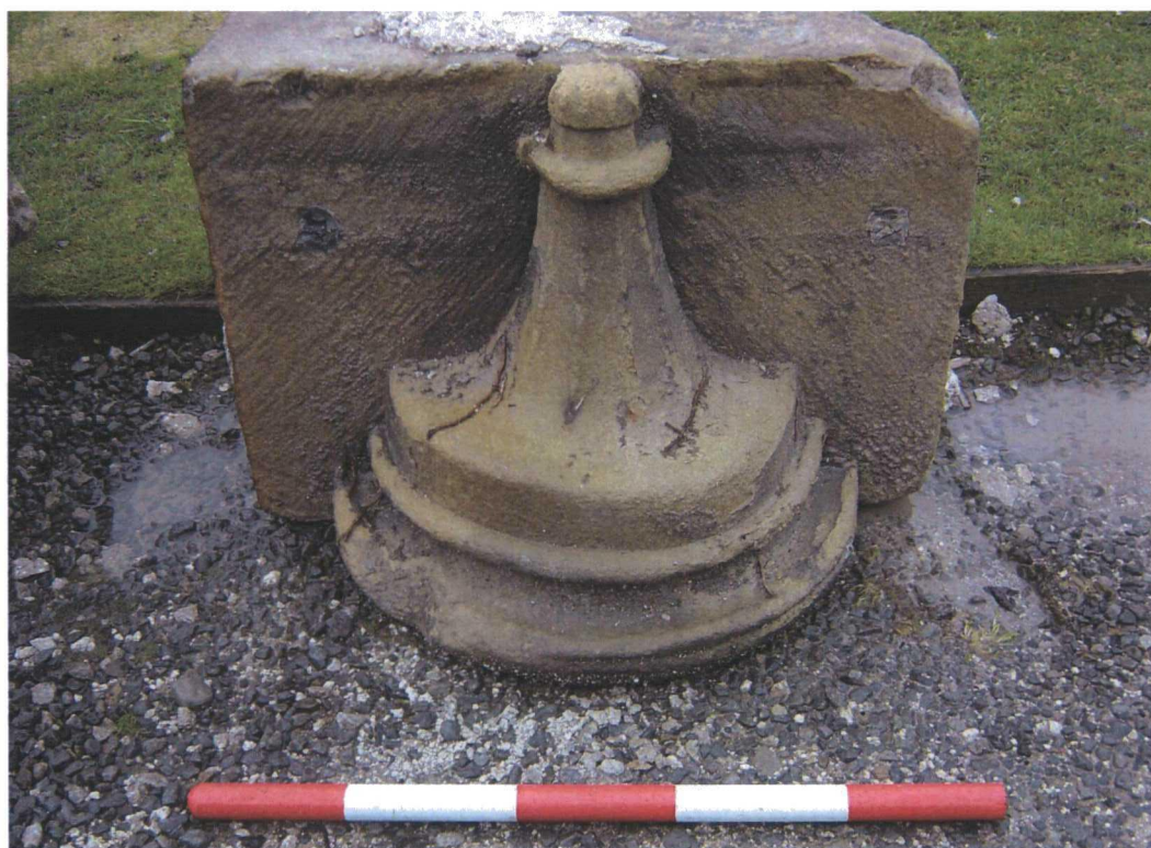
Plate 10. A possible capital from a blind arcade; alternatively, possibly the base of a decorative corbel, shown upside down. Re-used from the abbey. Scale 0.5m.