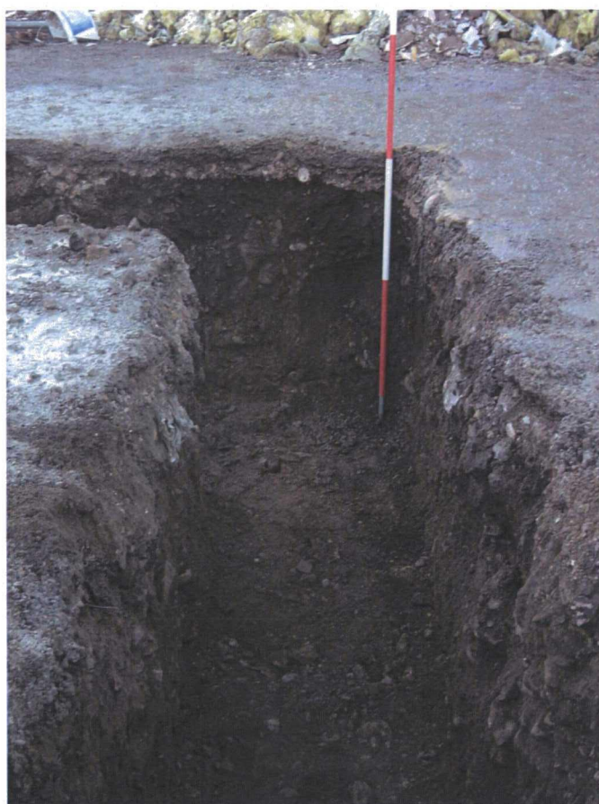
Plate 2. Eastern side of footings trench, partially cut. Looking north, scale 2m.