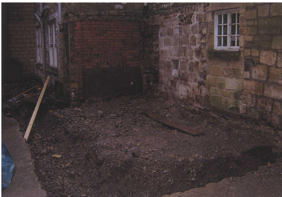
Plate 3. Footing on the north side of the Hall, partially dug. Looking south-east.