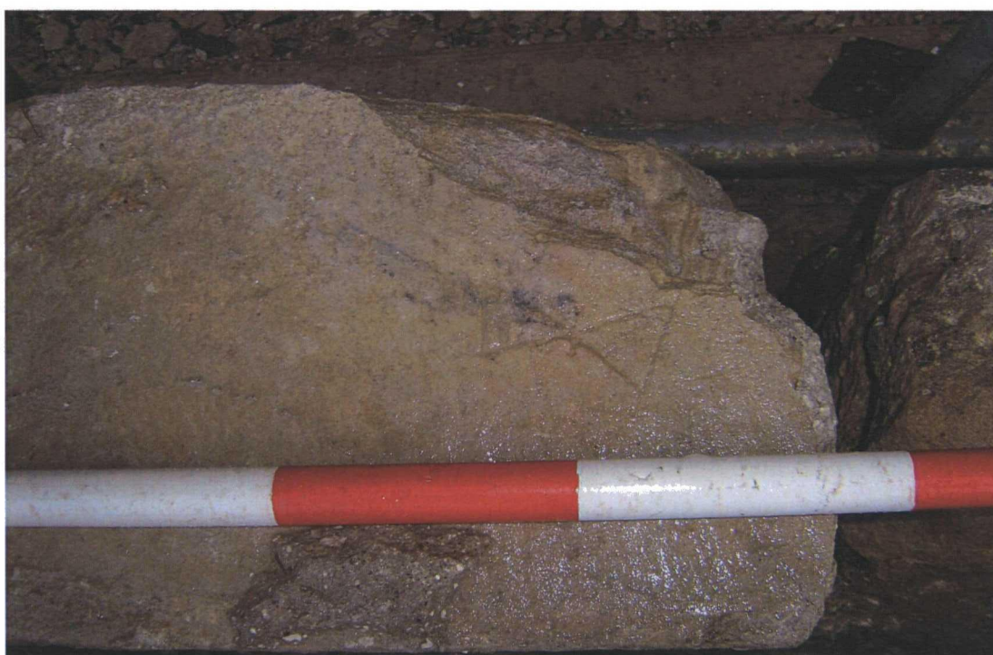
Plate 8. Mason's mark on a re-used architectural stone re-used from the abbey. Scale 0.5m.