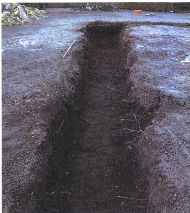
Plate 1. Western side of footings trench, partially cut. Looking north, 2m scale.