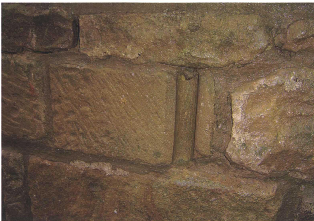
Plate 9. Part of a roll moulded window jamb re-used in the boundary wall to the west of Jervaulx Hall. Scale 0.5m.