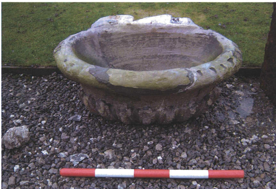
Plate 7. Architectural stone re-used from the abbey – possibly a piscina. Scale 0.5m