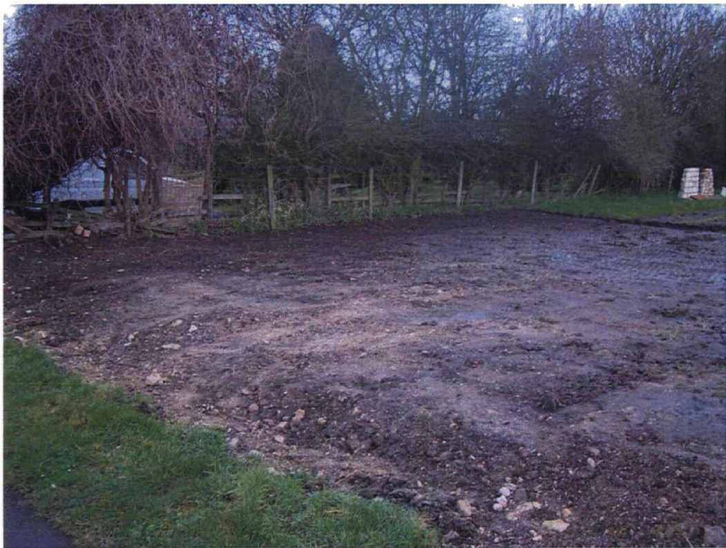
Plate 2. Site after removal of topsoil. Facing North-west.