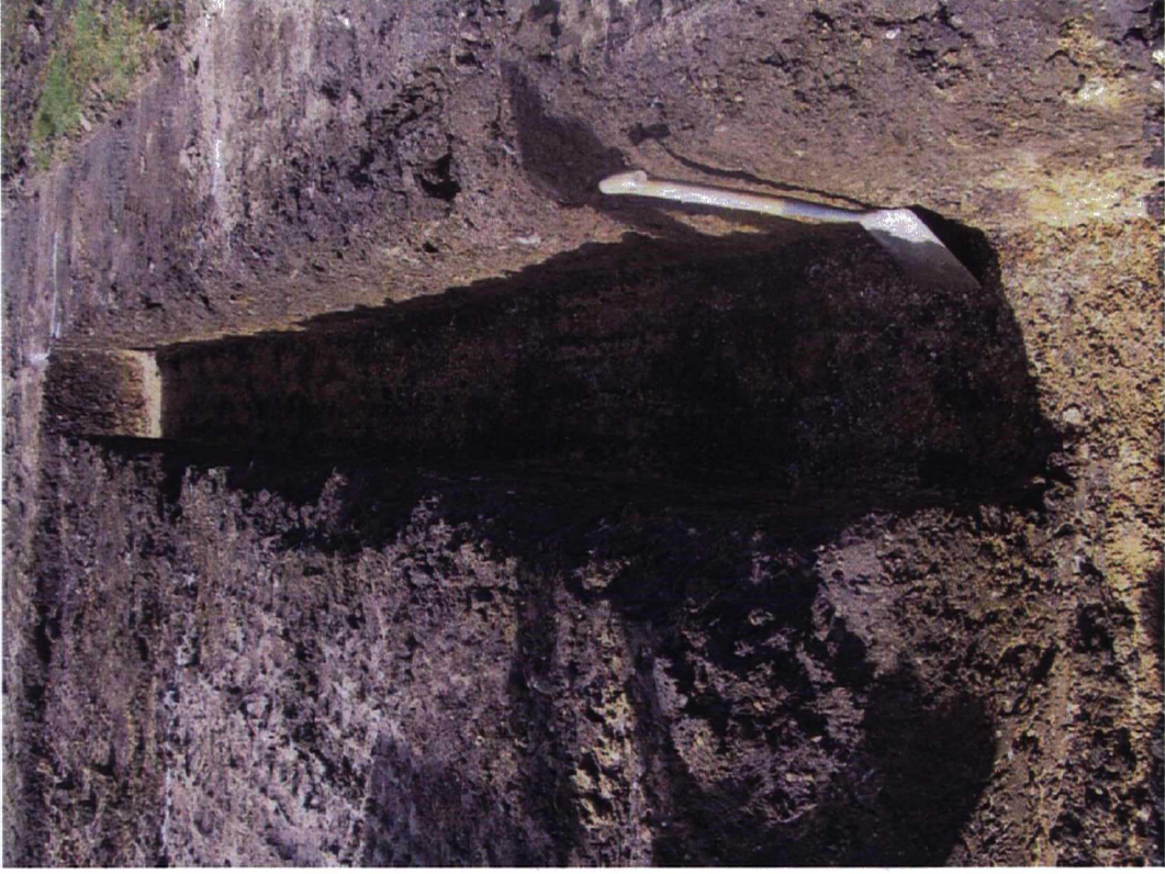
Plate 4. Foundations after excavation. Facing South.