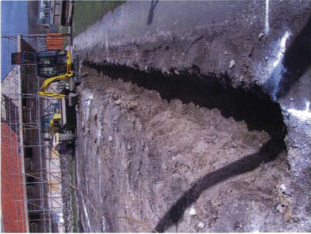
Plate 3. Foundations during Excavation. Facing East.