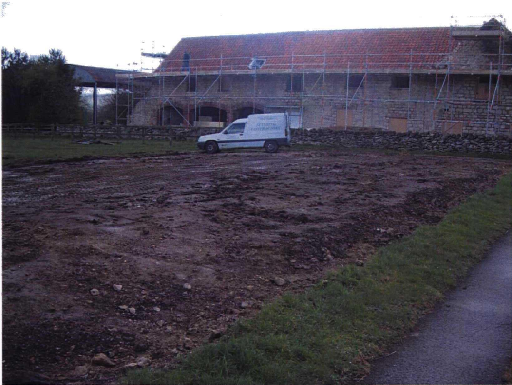
Plate 1. Site after removal of topsoil. Facing North-east.