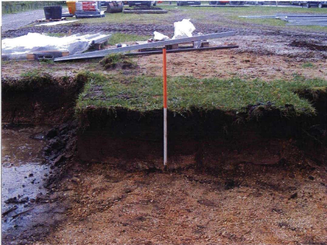
Plate 3: North-facing section . Facing South.