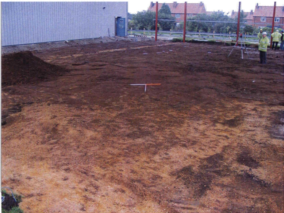
Plate 4: View of Stripped Area. Facing North-west.