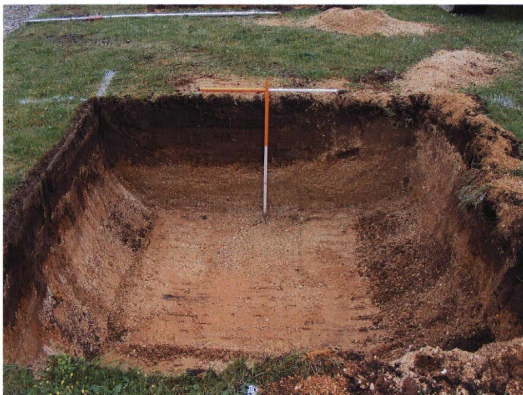
Plate 2: Stanchion 3. Facing South.