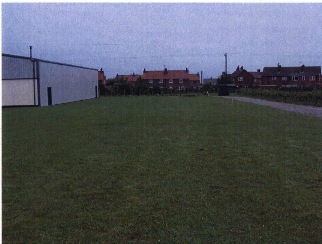
Plate 1: Pre-excavation View of Site. Facing North.