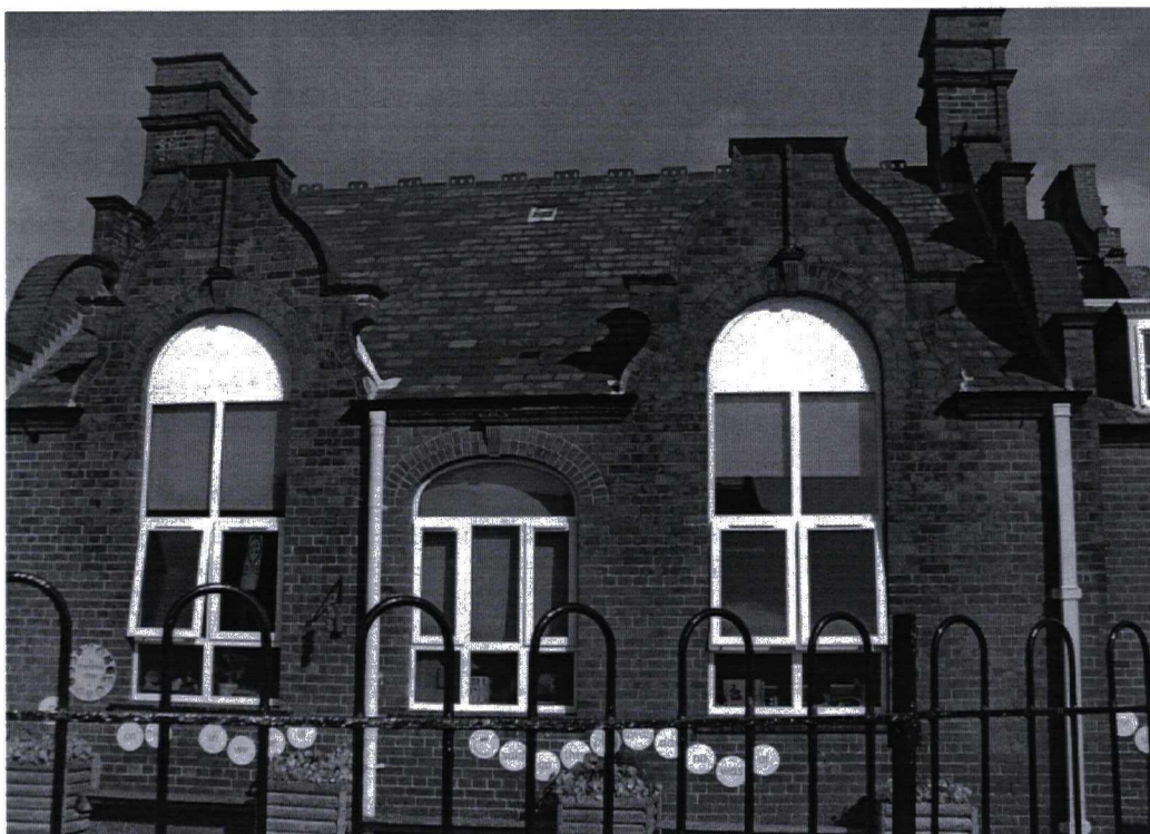
Plate 3: Site 2 - Gladstone Road Primary School, south elevation, looking north