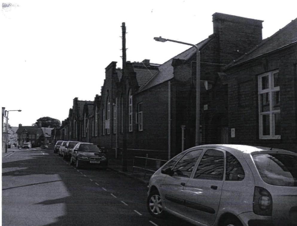
Plate 2: Site 2 - Gladstone Road Primary School, north elevation, looking east