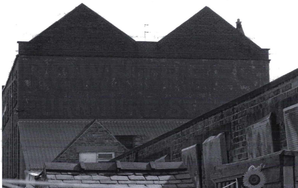
Plate 5: Site 3 - Rowntrees Furniture Store, west elevation, looking east