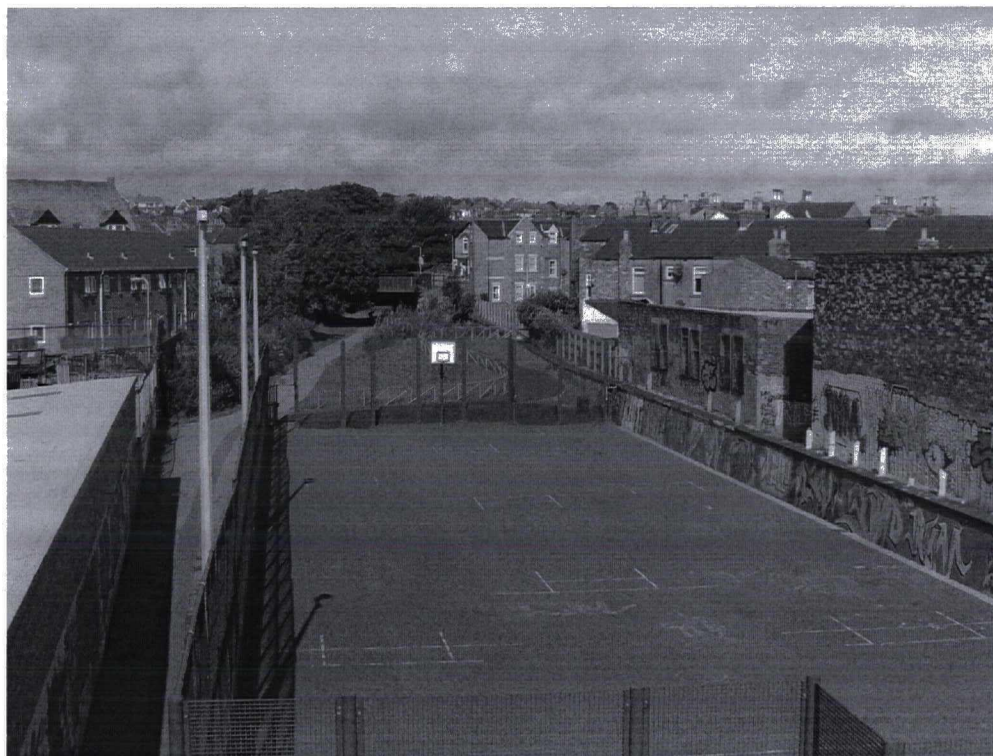
Plate 1: Site 1 - Former Scarborough and Whitby Railway, Looking north by northwest.