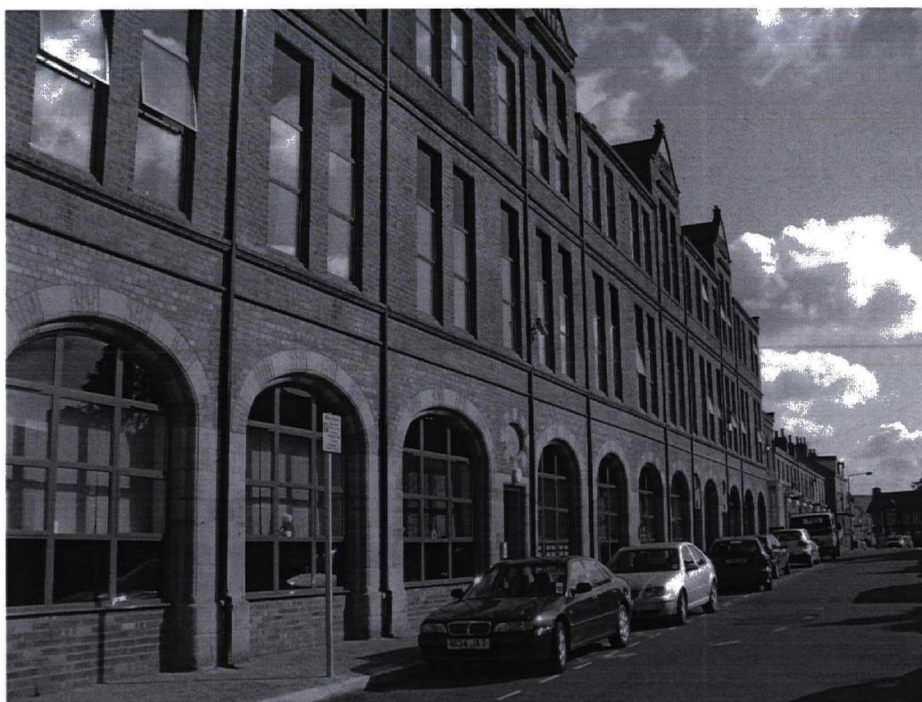
Plate 4: Site 3 - Rowntrees Furniture Store, south elevation, looking northeast