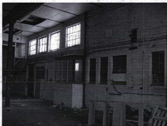
Plate 1 – Site 4. East-west partition wall between the north range and the open shed, looking north west

Internally, no evidence is retained of the building's function in the form of fixtures or fittings. Small-scale alterations including the creation of new openings and insertion of ventilation have served to detract from the physical integrity of the building.