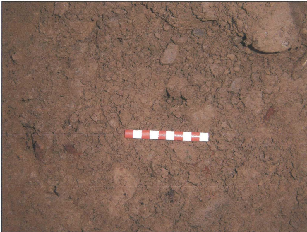
Plate 4. Close up of coffin nails at foot of grave 009. Scale 0.10m