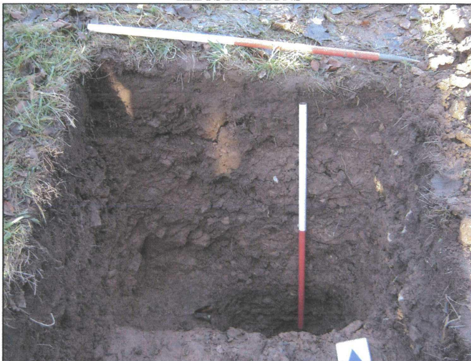
Plate 1. Northern end Trench 1 showing grave cut running vertically from edge of sondage. Scales 1m.