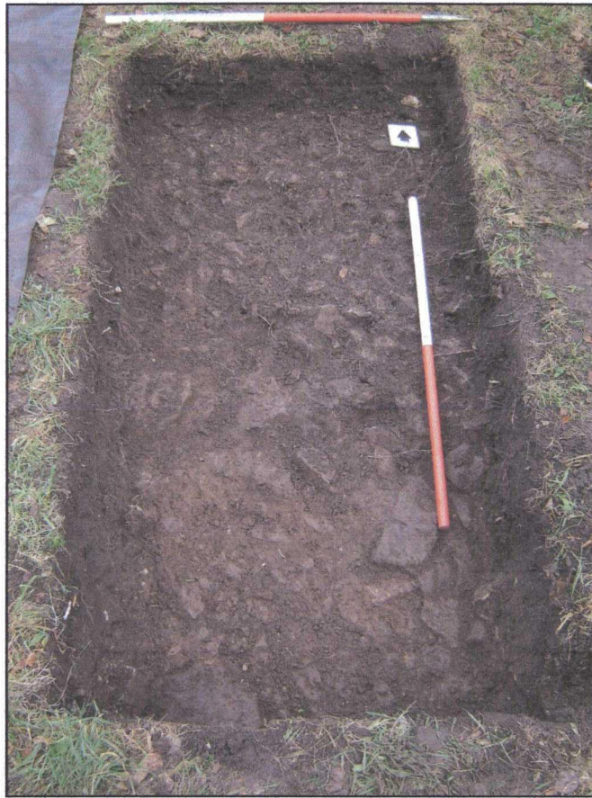
Plate 5. Trench 3 excavated to natural geology. Scales 1m.