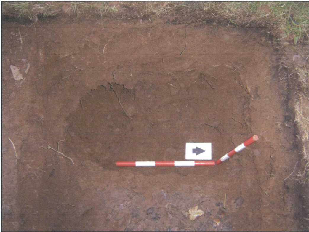
Plate 3. Sondage in northern end of Trench 2 showing grave 009 below large void at left hand end of scale. Scales 0.5m.