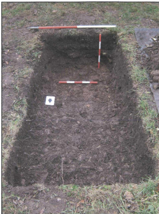
Plate 7. Trench 5 excavated to 100, abandoned grave visible at far end. Scales 0.5&1m.