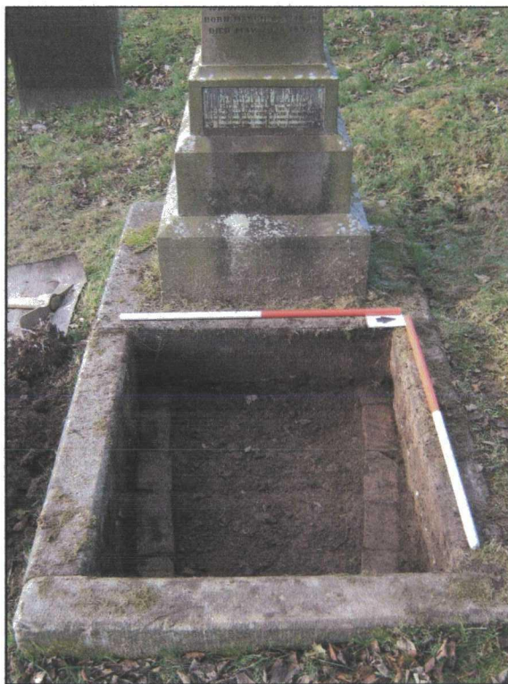
Plate 8. Brick lined shaft of Lister vault (Trench 6). Scales 1m.