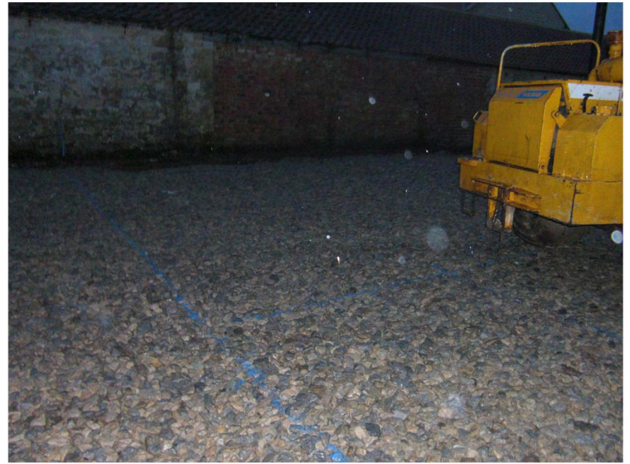
General View of Site before Excavation