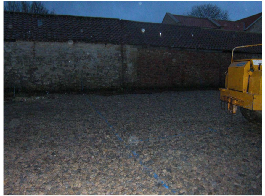
Site before Foundation Strip