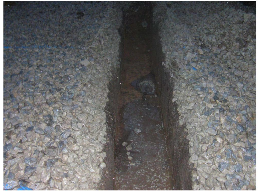
General View of Foundation Facing West