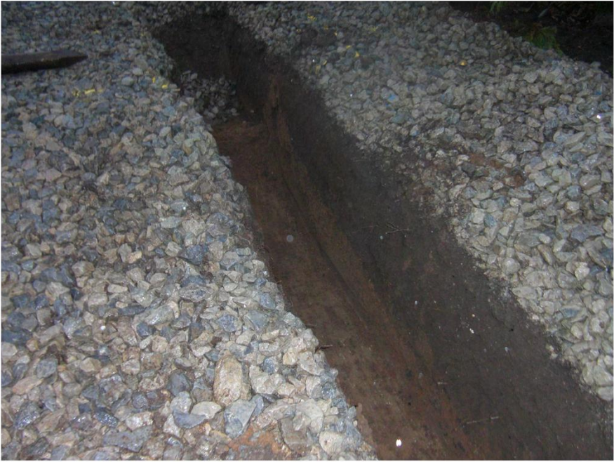
Section of Foundation Trench