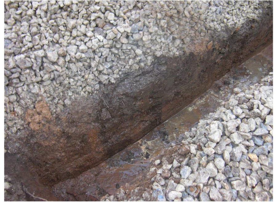
Section of Foundation Trench