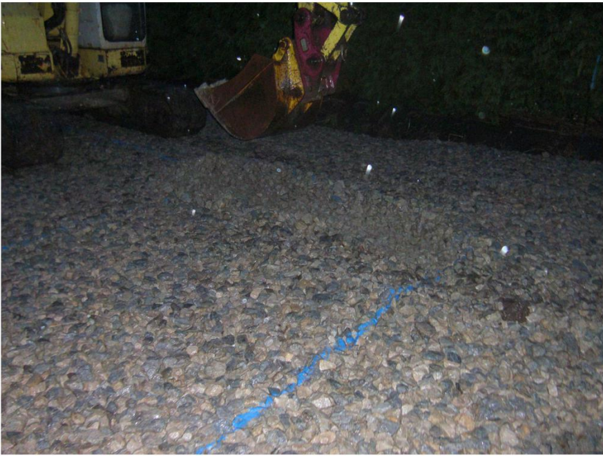
Watching Brief Swinton Foundations Marked Out