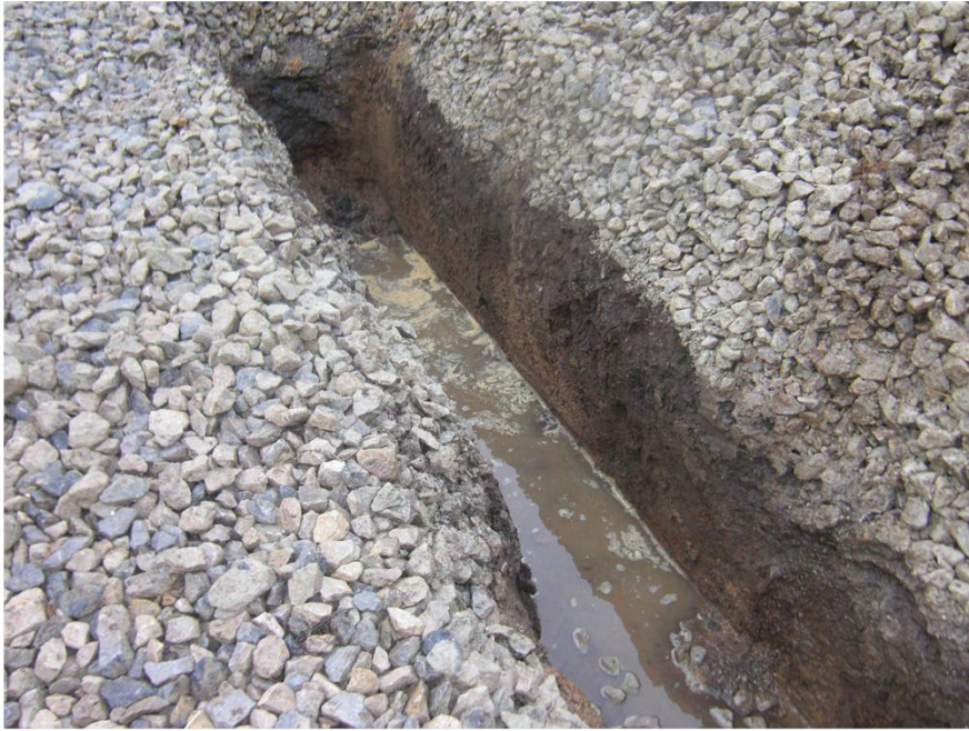
Section of Foundation Trench