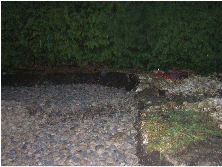
First Foundation Facing North