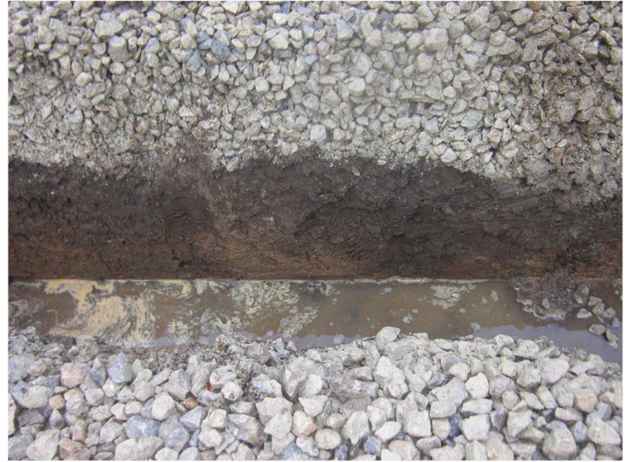
Section of Foundation Trench