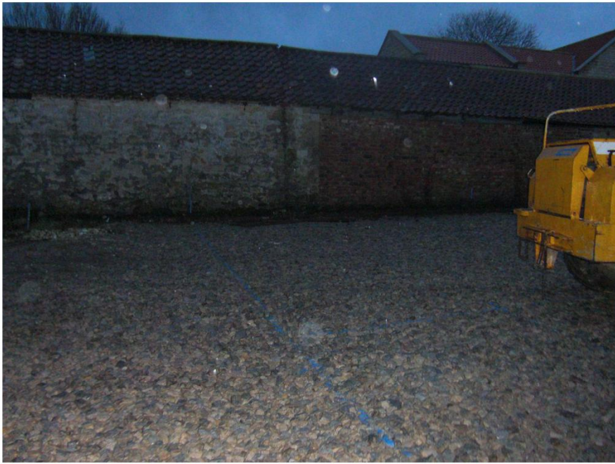
Site before Foundation Strip