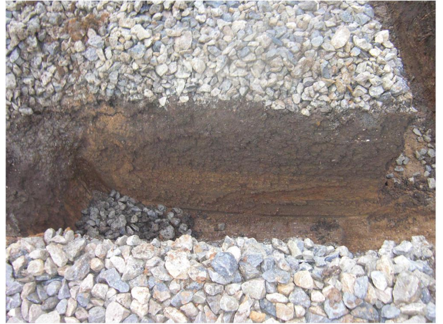
Section of Foundation