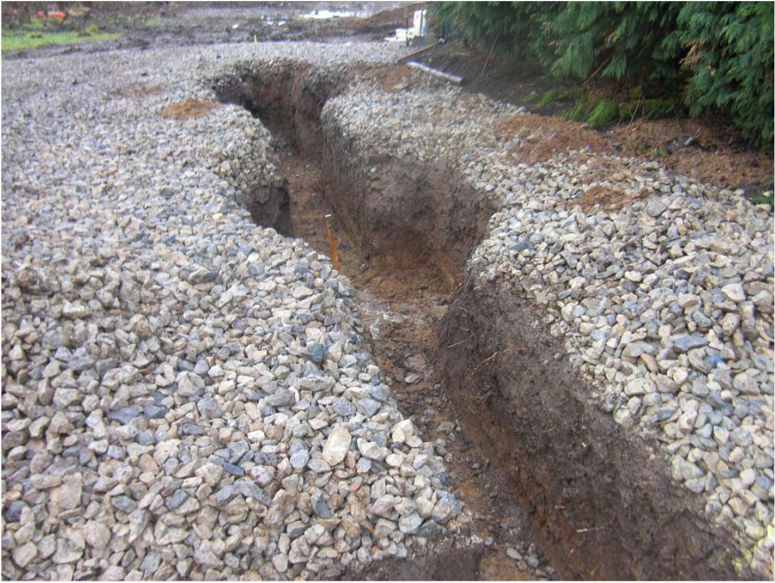
North Foundation Trench