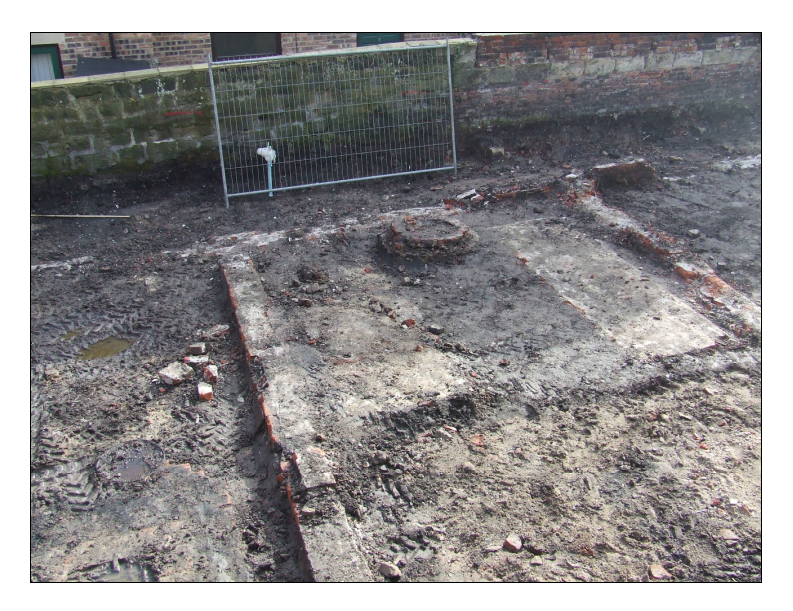
Plate 2 Central room and well and metal 'drum' (bottom left)