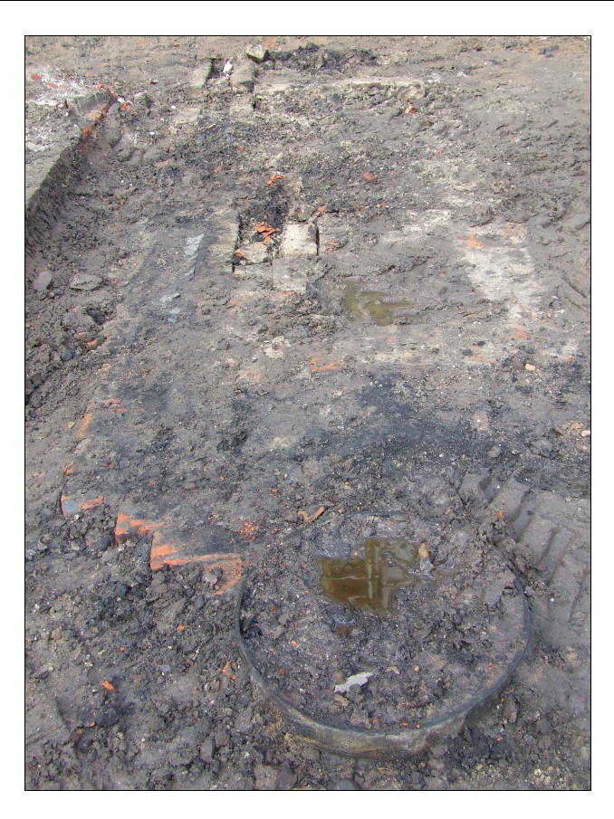
Plate 5 Metal 'drum' and brick channel prior to excavation