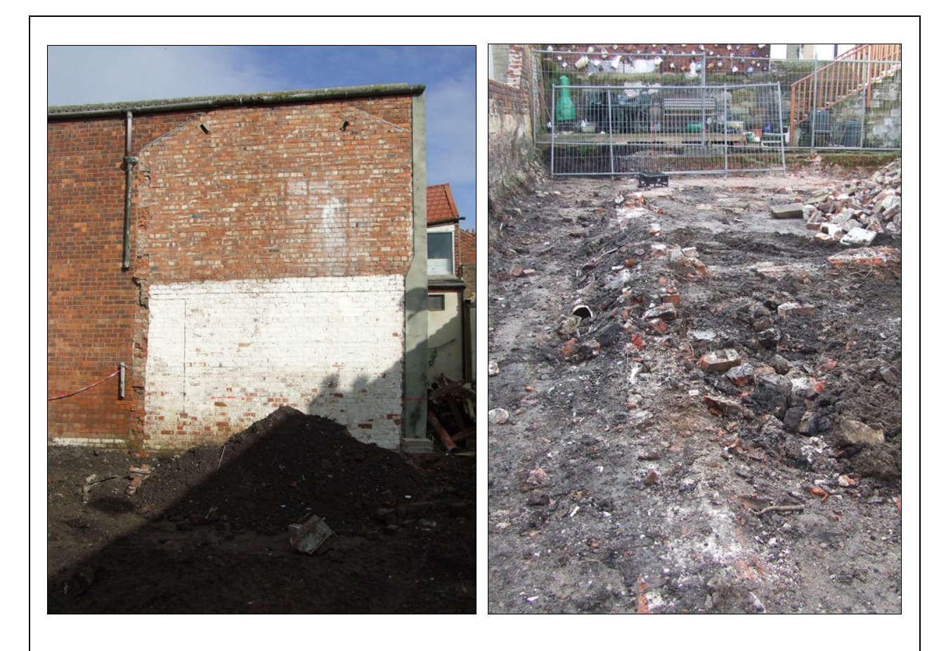
Plate 6 and 7 The northern end of the site showing wall scar and the eastern external wall