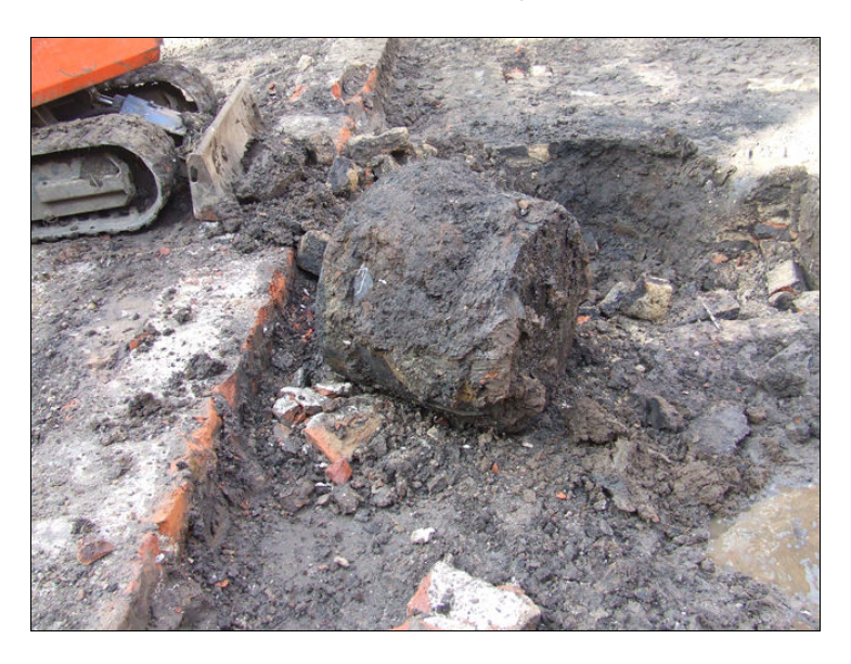
Plate 4 Metal 'drum' excavated