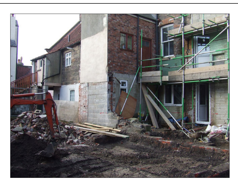
Plate 10 General view of the rear of 26a and 27a Silver Street