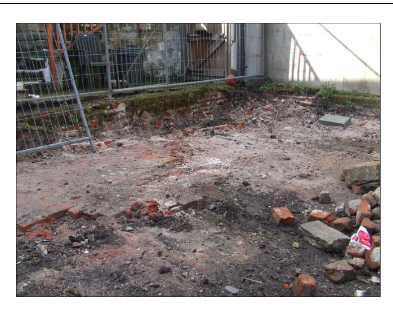
Plate 1 Brick floor southern room