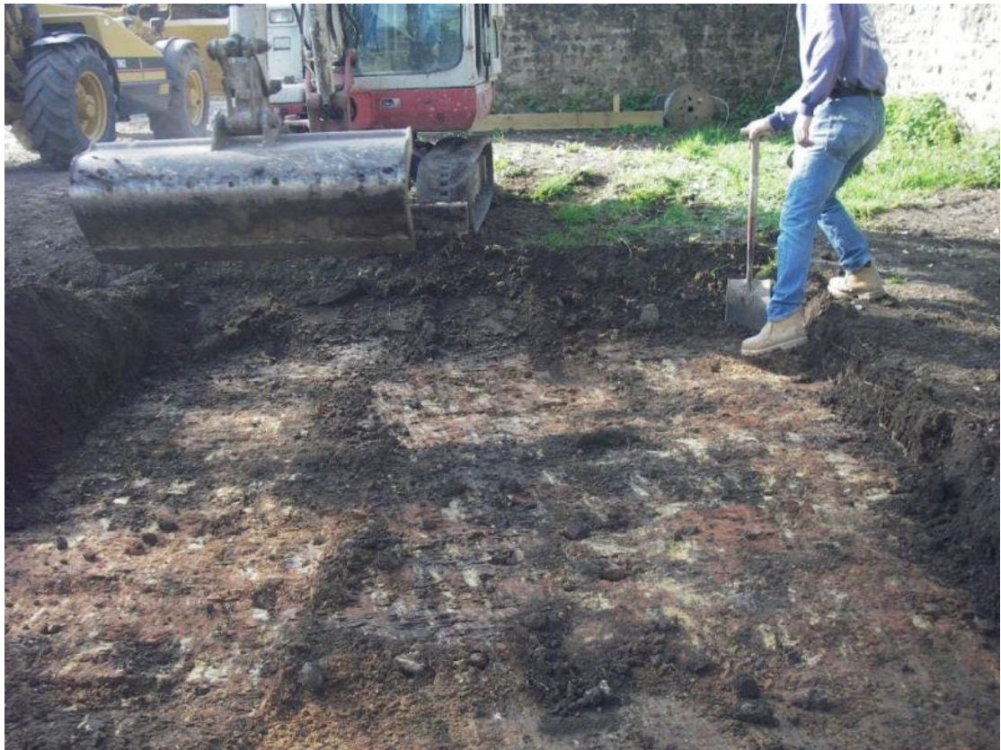
Plate 4. Modern structural remains, looking south