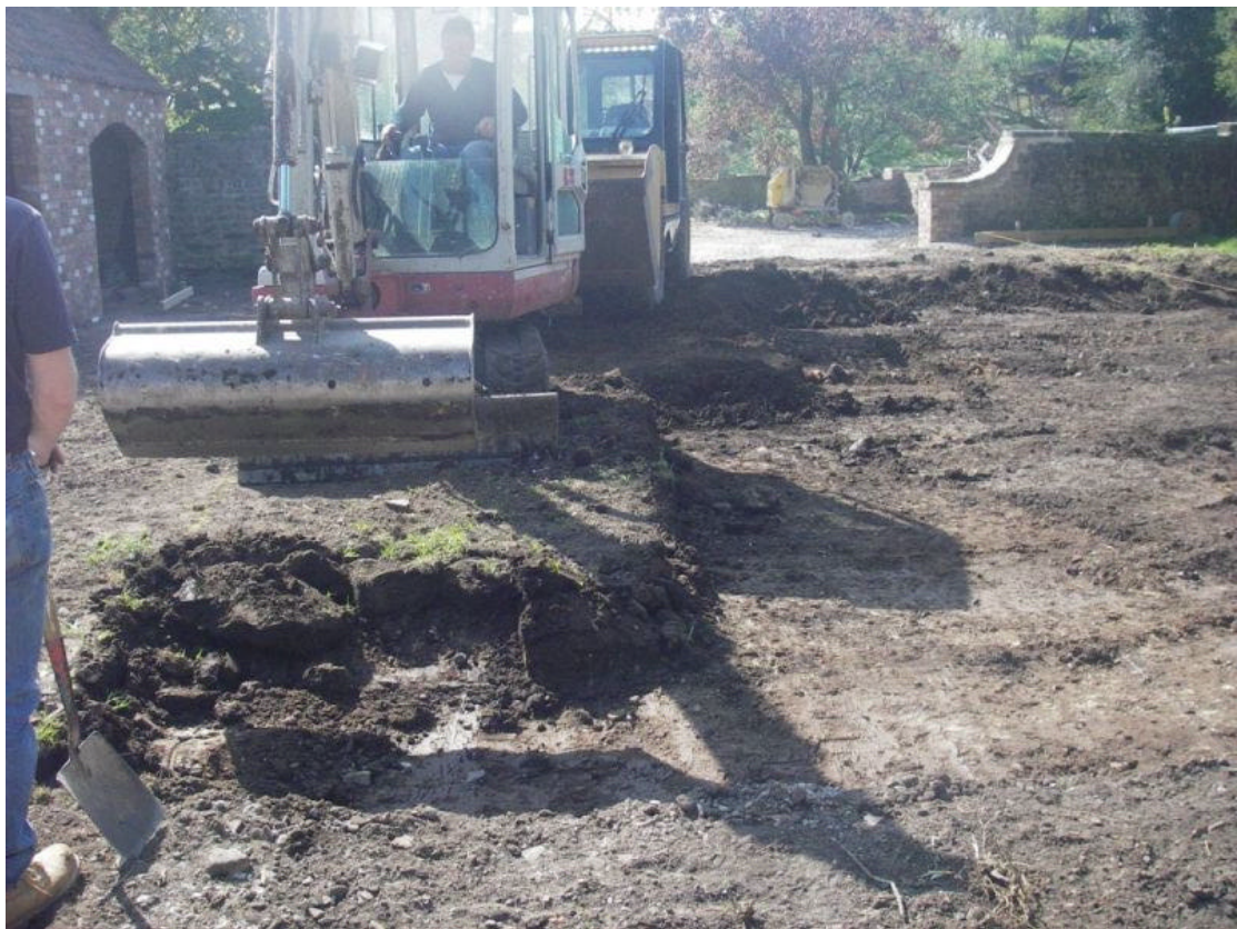
Plate 2. Stripping of the topsoil, looking south