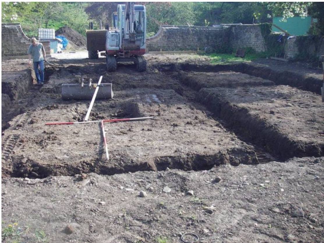
Plate 6. General view of the wall footings, looking south