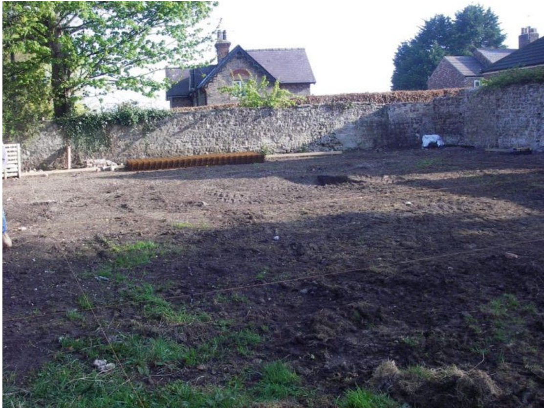
Plate 1. General view of the development site previous groundworks, looking northeast