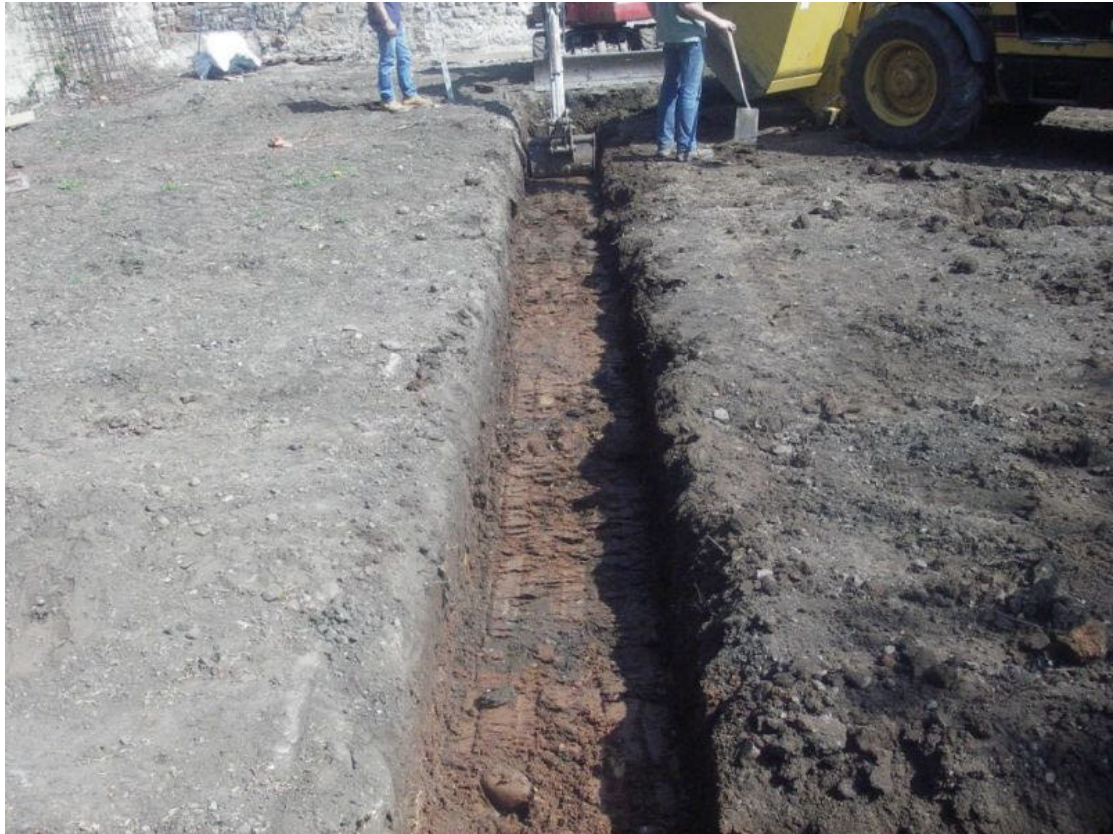
Plate 5. Excavation of the wall footings, looking north