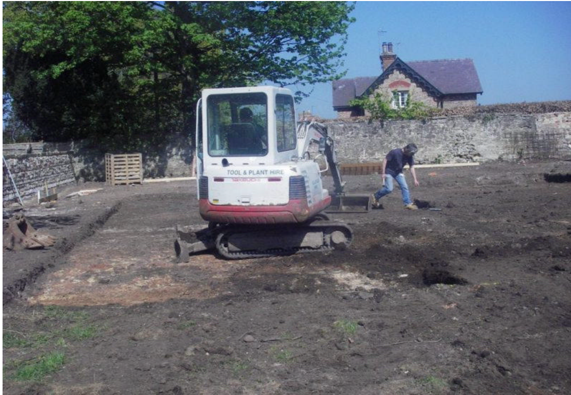
Plate 3. Modern structural remains, looking north