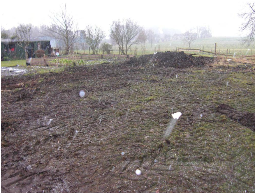
Plate 1. General View of Site. Facing South-west.