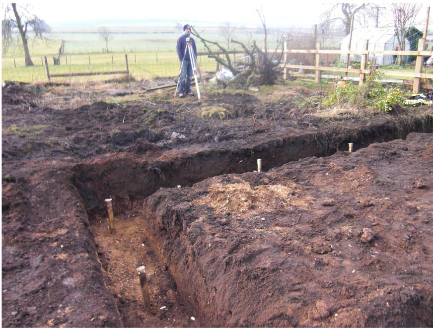
Plate 7. Foundation Trench.