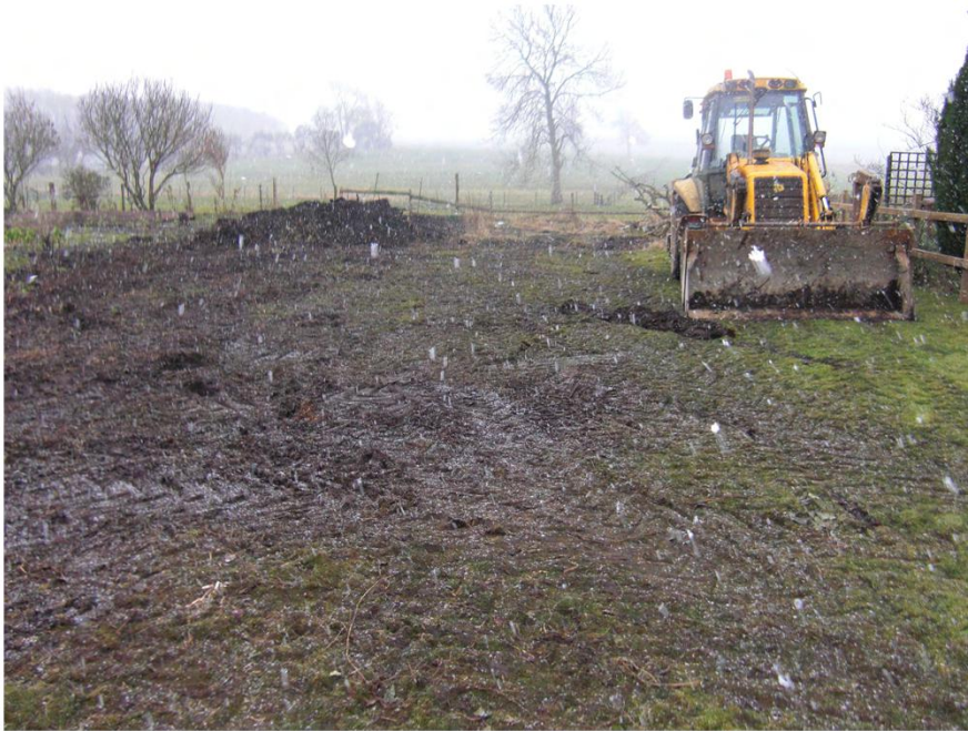
Plate 3. Topsoil Strip.