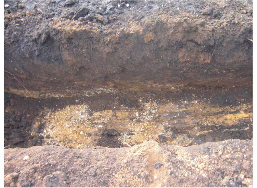
Plate 6. Foundation Trench.