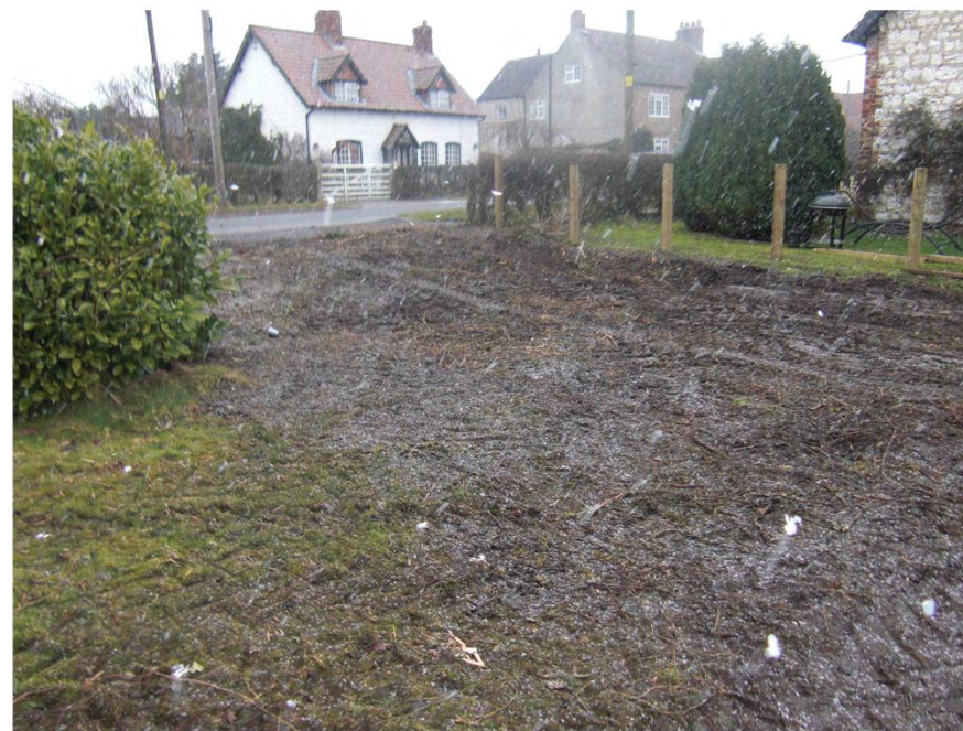
Plate 2. General View of Site and Access. Facing North-east.