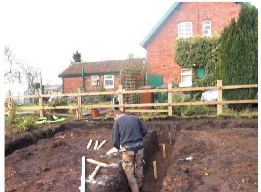
Plate 8. Foundation Trench.