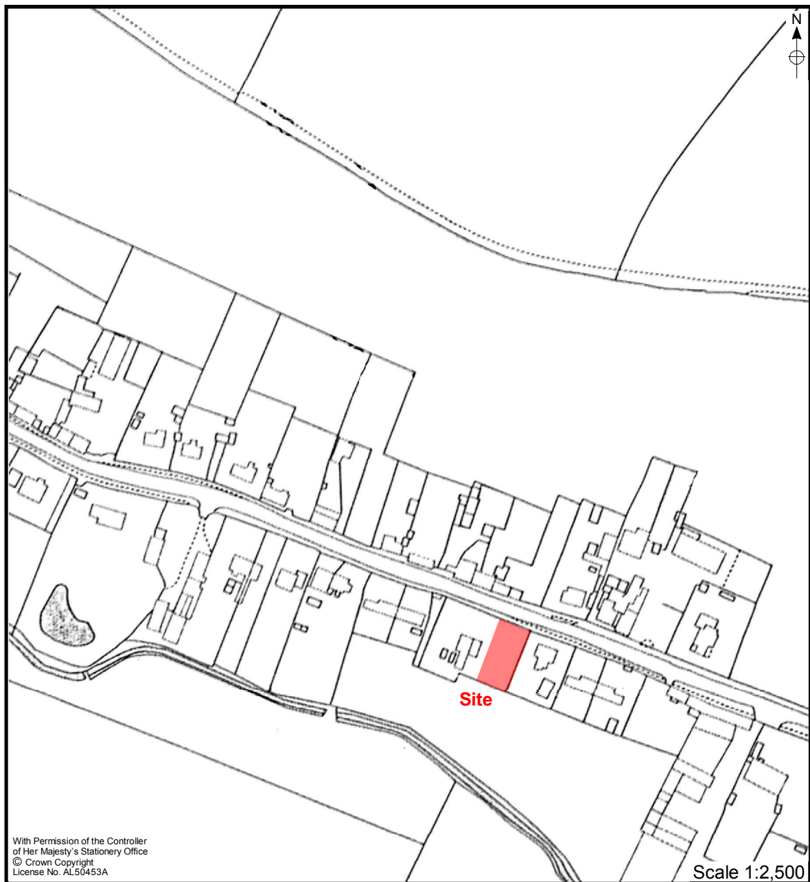
Figure 2. Area of Archaeological Watching Brief.