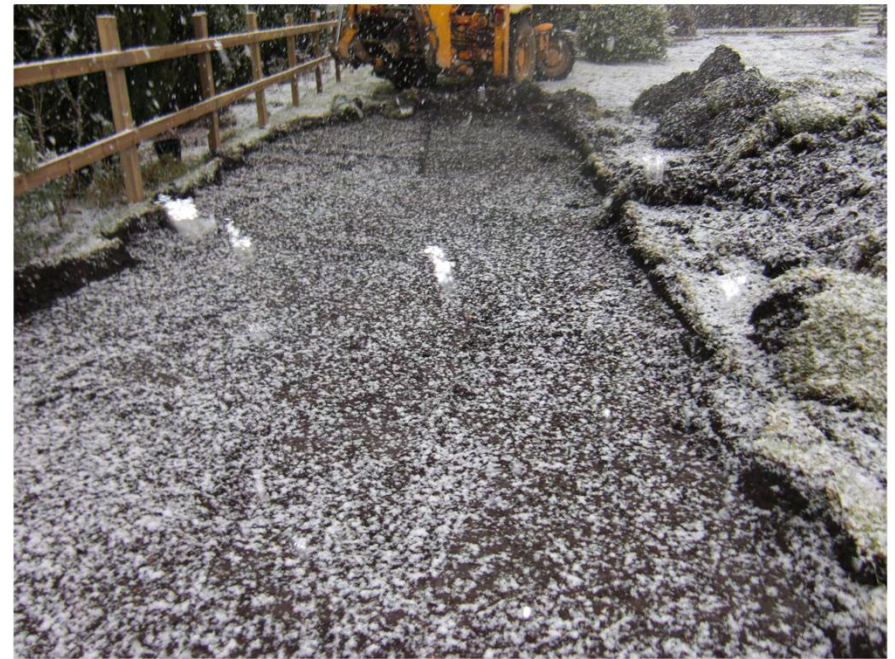
Plate 4. Topsoil Strip.