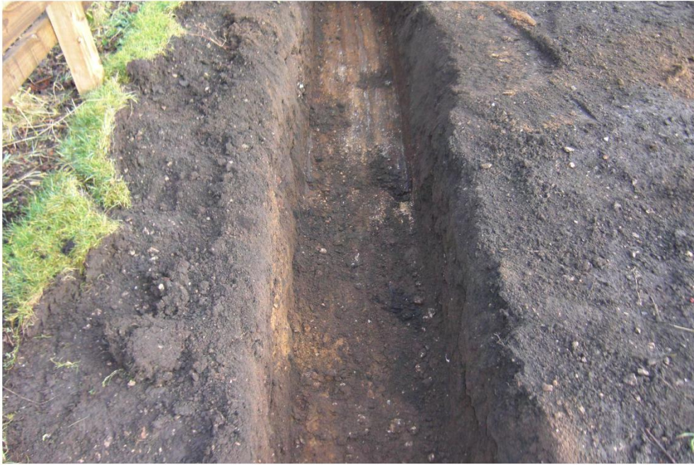
Plate 5. Foundation Trench.