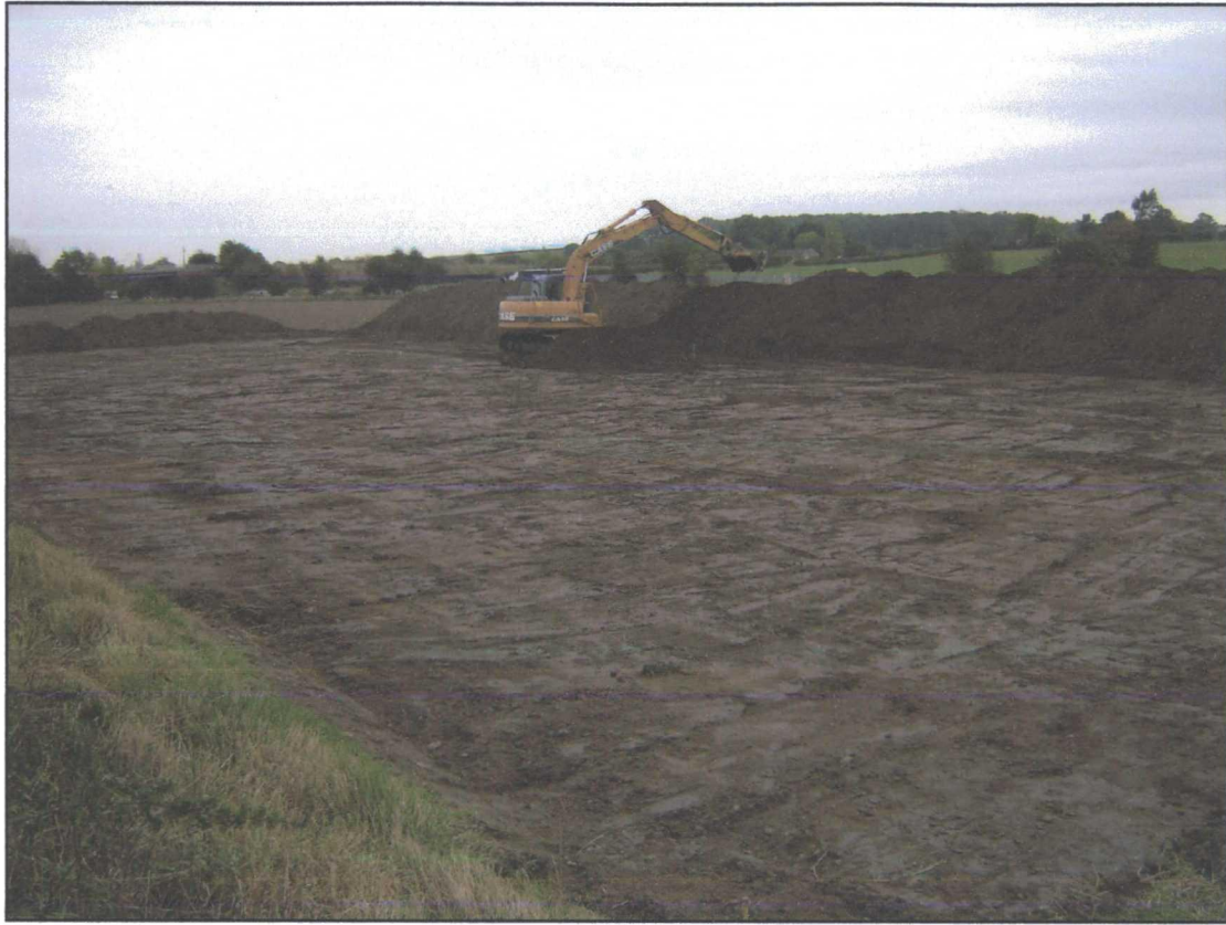
Plate 1. General view of stripped site looking south-west.