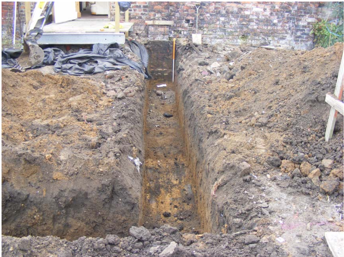
Plate 2. Foundation Trench. Facing South.