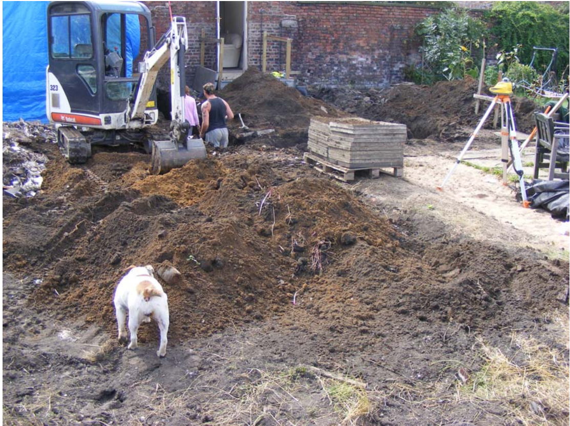
Plate 1. Overall Shot of Plot. Facing South-west.