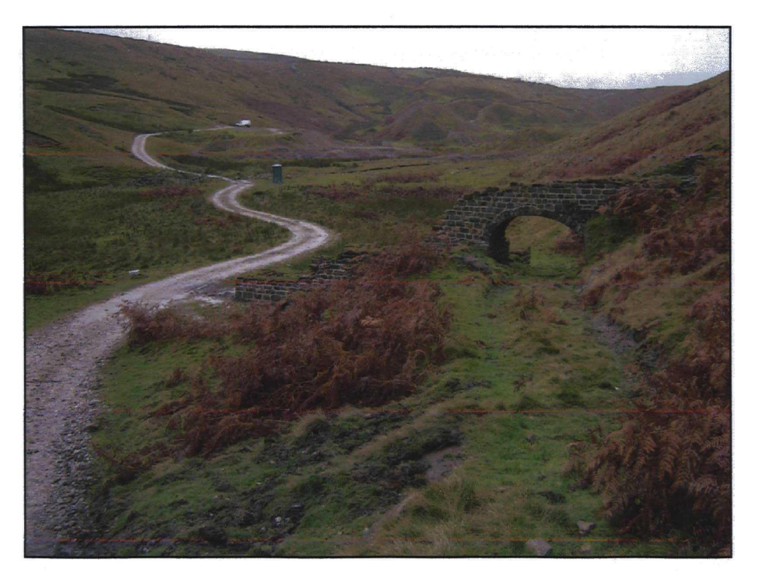
Plate 4. East side of arch over track-way after works, looking west.

Plate 3. East side of arch over track-way before works, looking west, scale 2m.