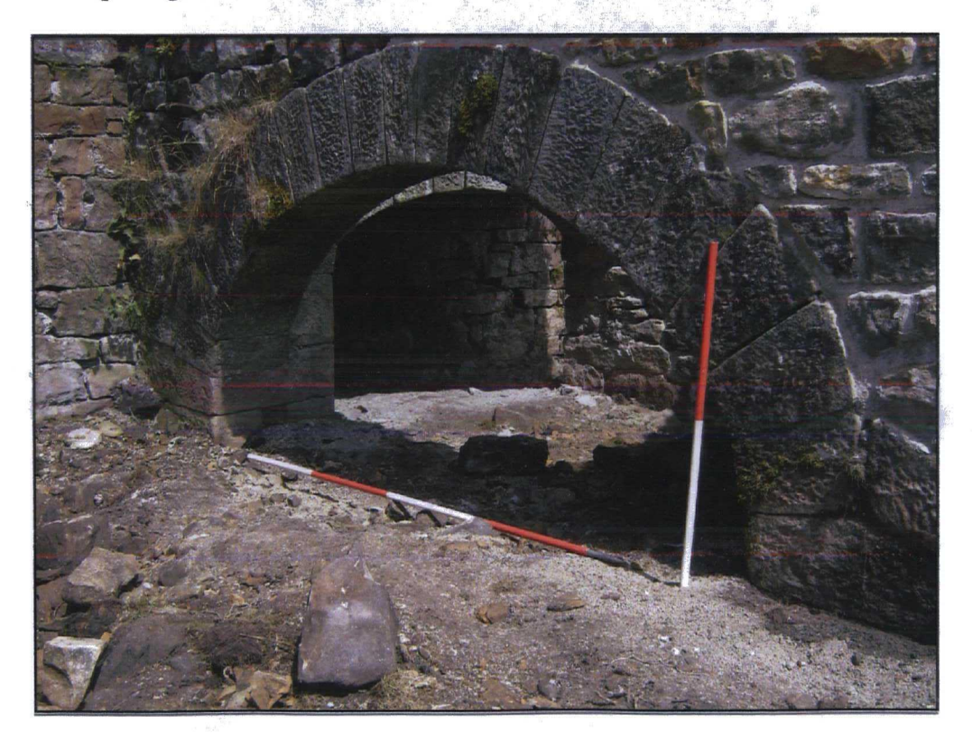
Plate 10. Archway in Room 1 looking north-east during works. Scales 1&2m.

Plate 9. Opening at north end of western wall during works, looking west. Scales 1m.