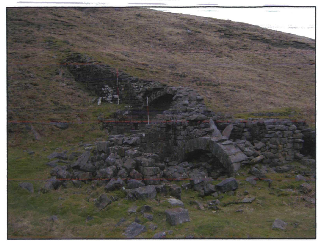
Plate 1. General shot of smelt mill, looking north-east before works, scales 2m.