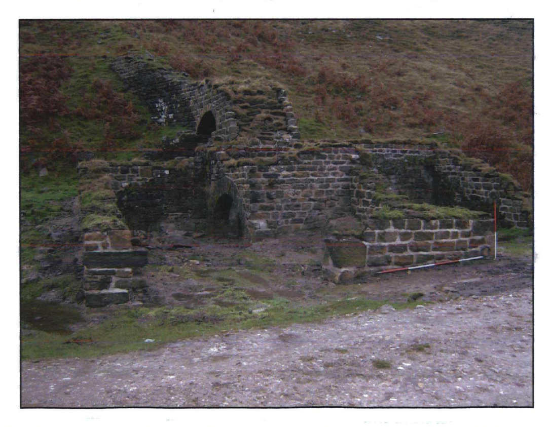
Plate 2. General shot of smelt mill after works, looking north-east, scales 1&2m.

Plate 1. General shot of smelt mill, looking north-east before works, scales 2m.