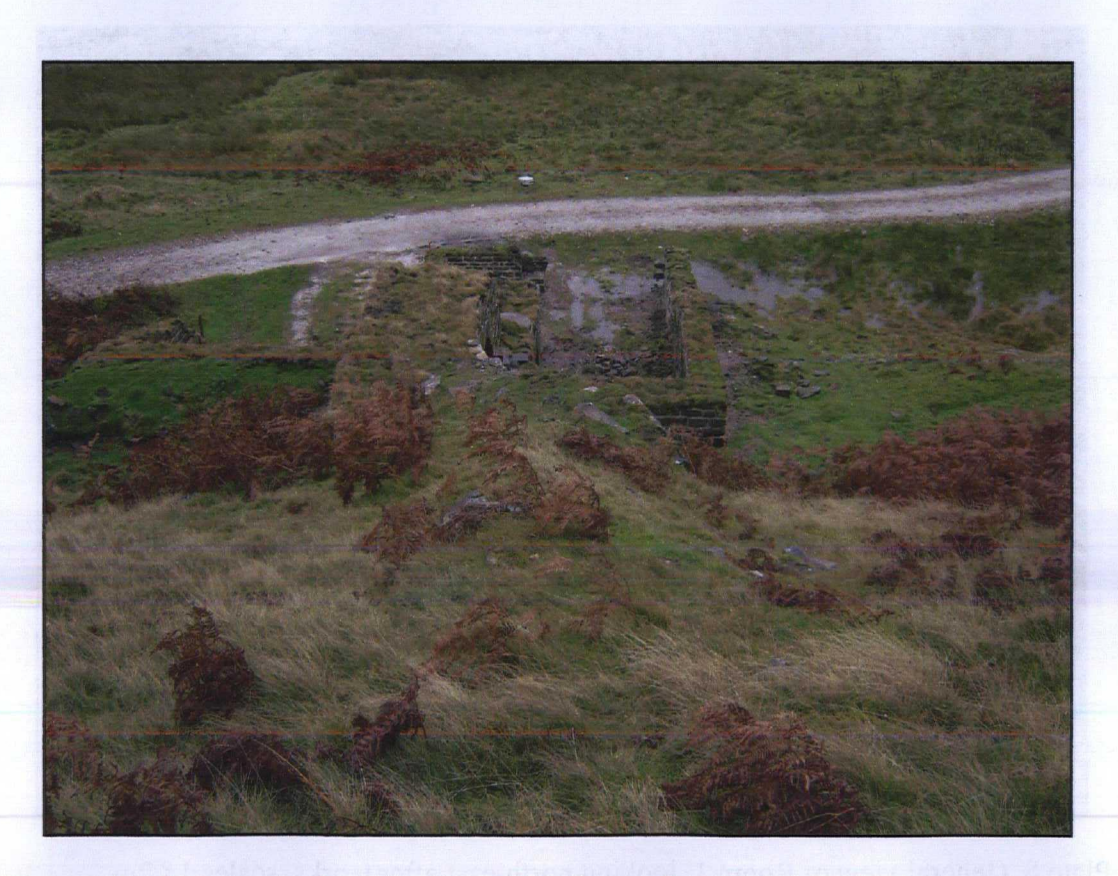
Plate 6. Looking south along the line of the flues, after works.