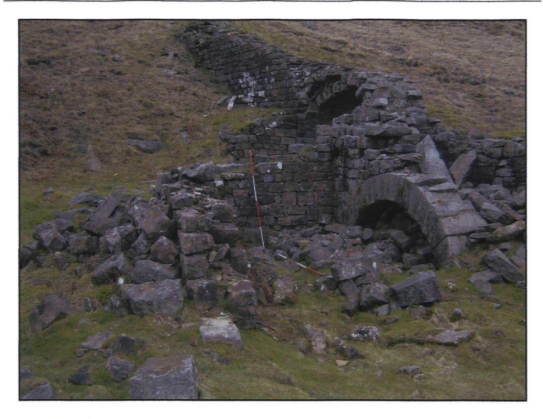
Plate 7. General view of Room 1, looking north-east before works, scales 2m.