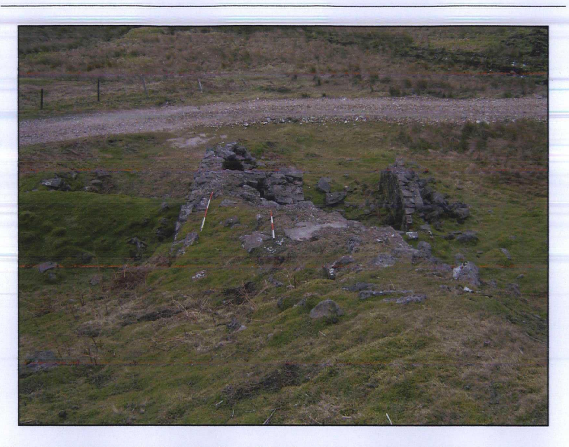
Plate 5. Looking south along the line of the flues before works, scale 2m.