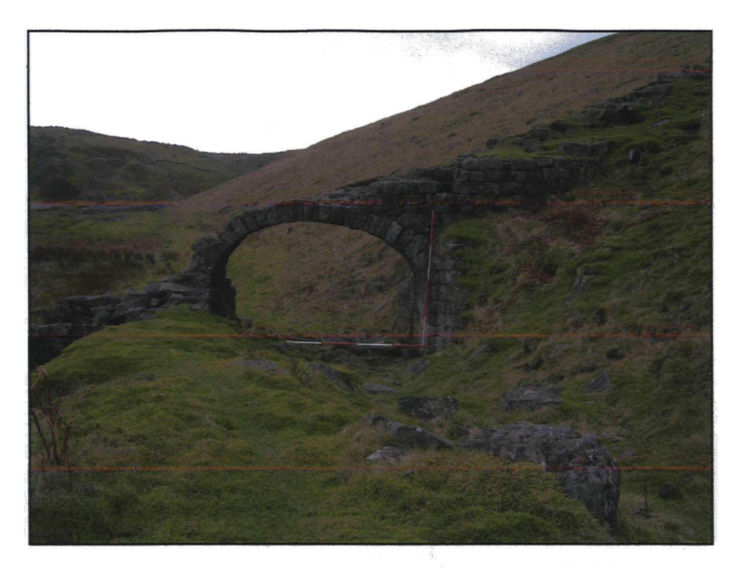
Plate 3. East side of arch over track-way before works, looking west, scale 2m.