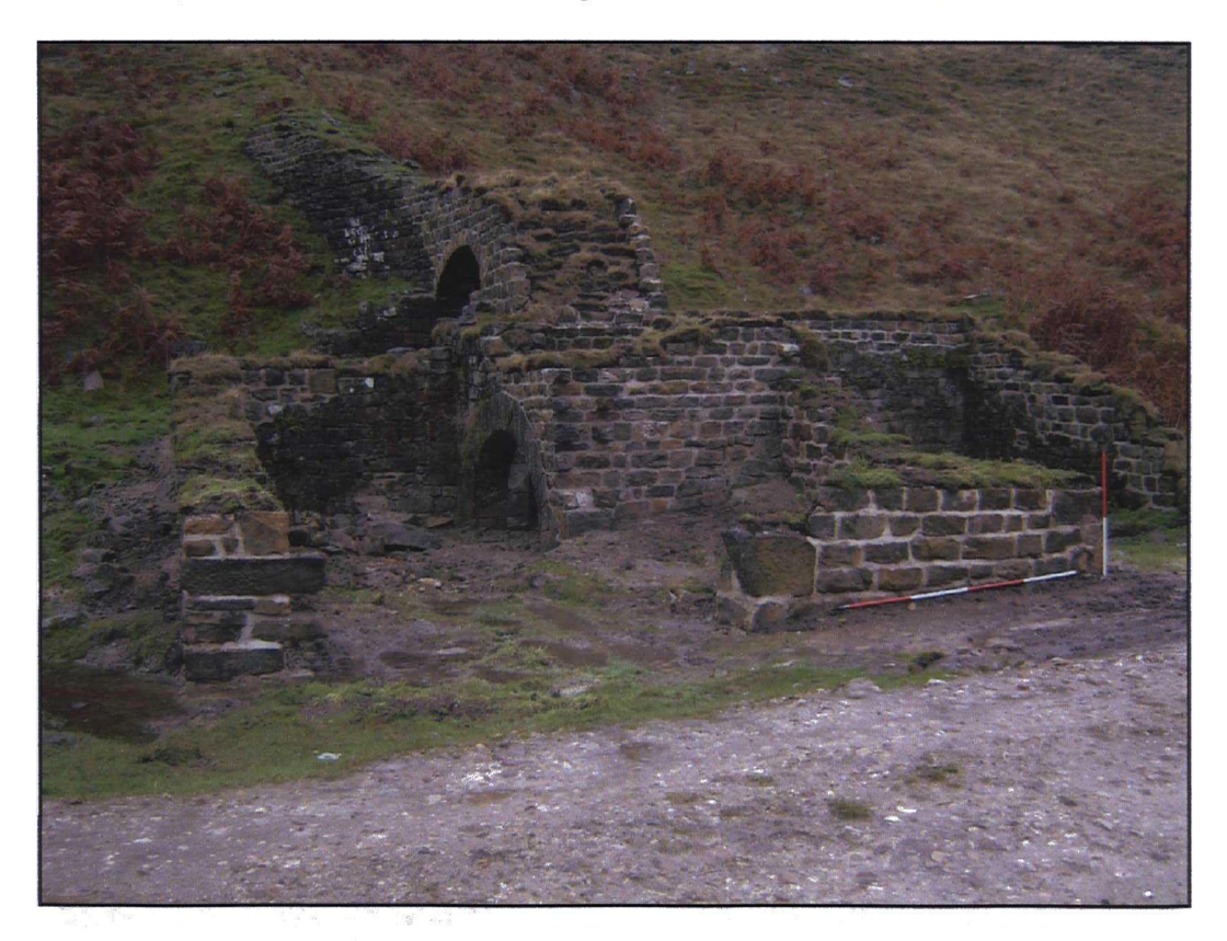
Plate 8. General view of Room 1, looking north-east after works, scales 1&2m.

Plate 7. General view of Room 1, looking north-east before works, scales 2m.