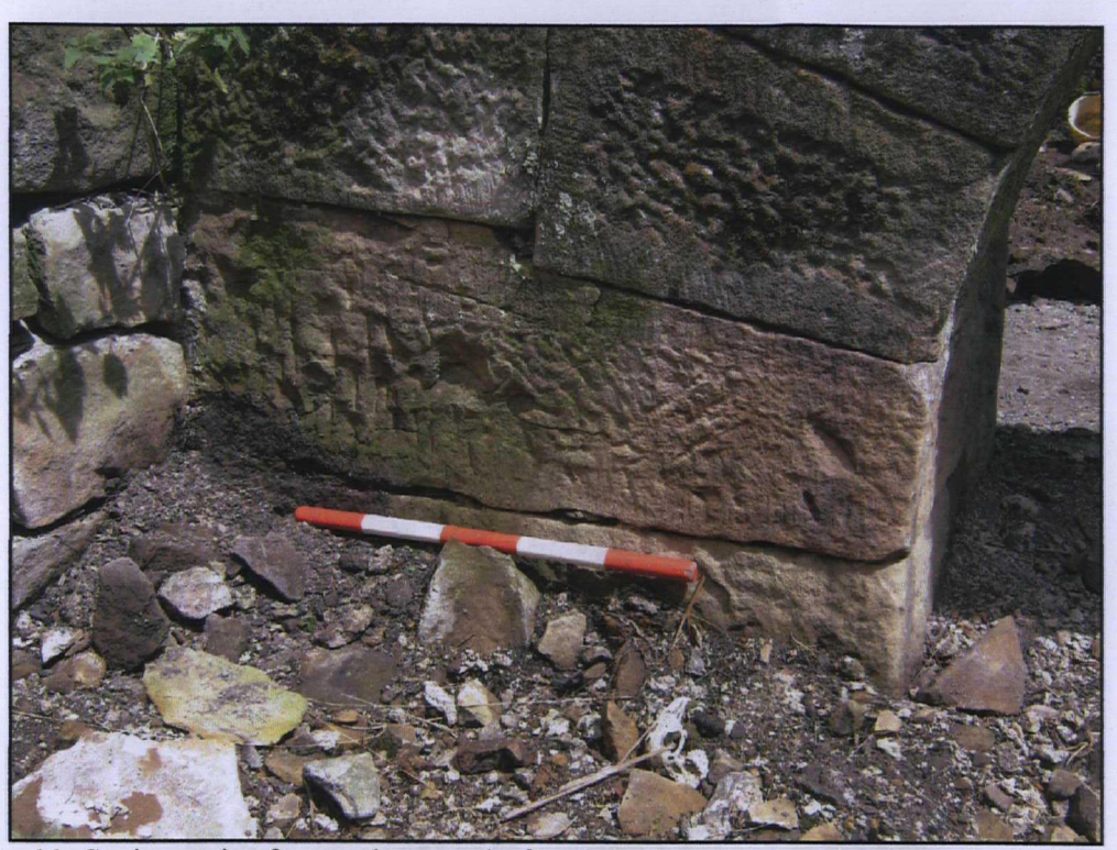
Plate 11. Spring point for northern end of arch in Room 1, looking east. Scale 0.5m.