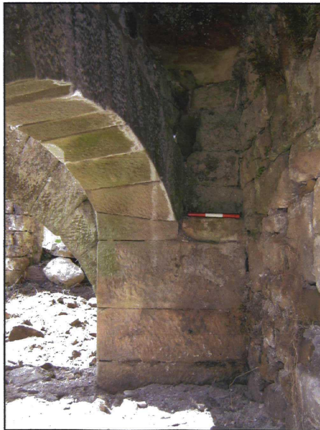
Plate 16. West side of north end of Room 2 showing 'step', after works. Scale 0.3m.