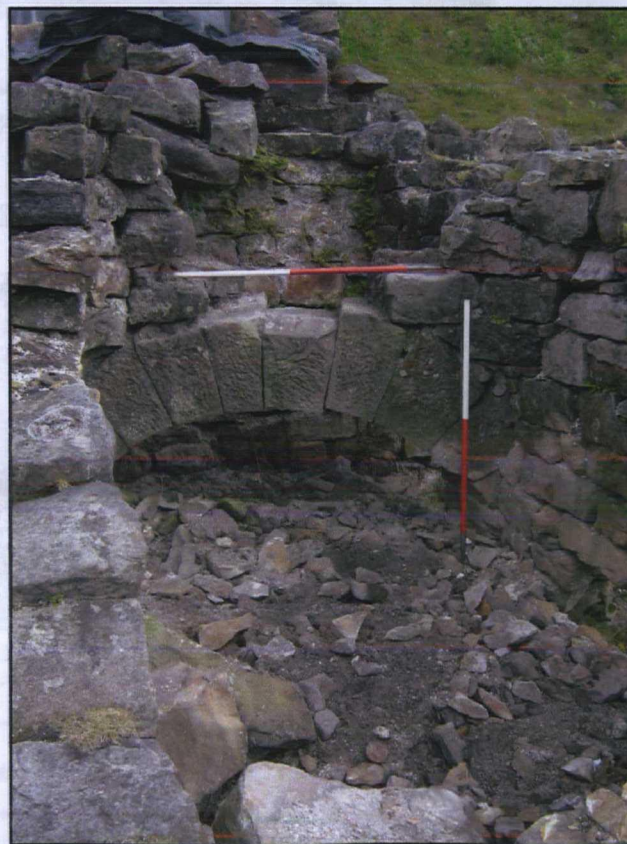
Plate 18. Top of arch showing during clearance in Room 3, looking north.