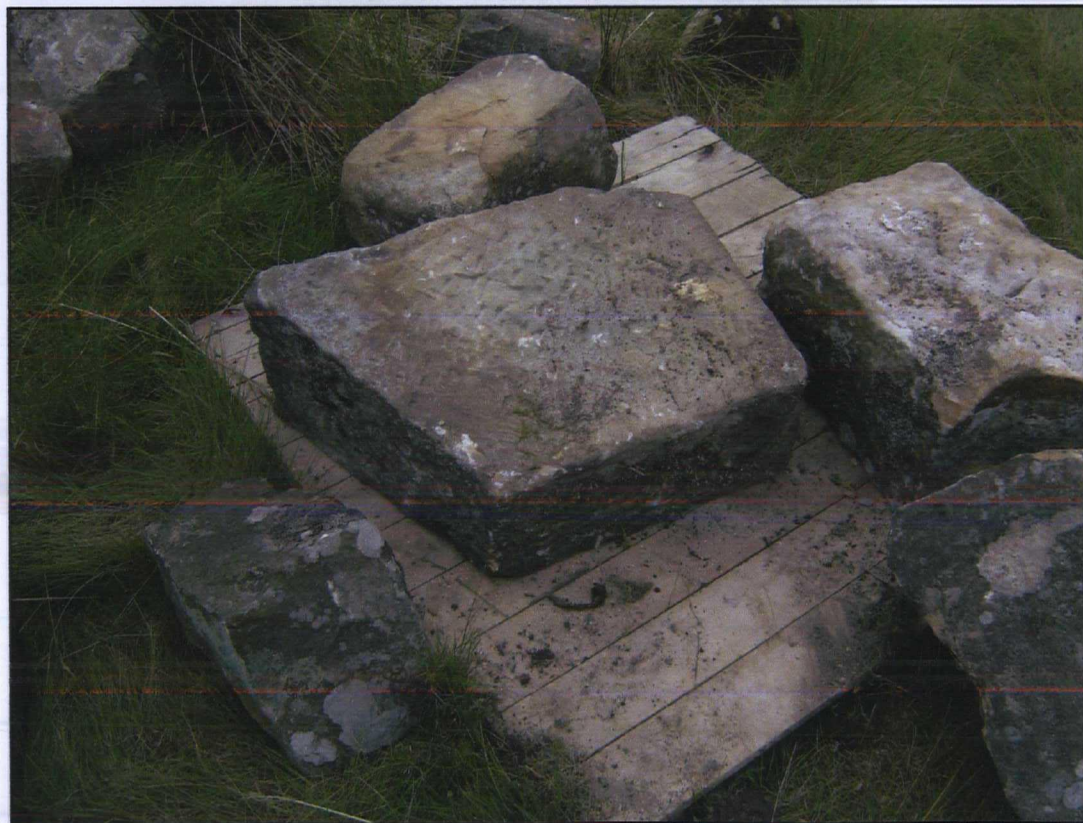
Plate 14. Wedge shaped stone noted during clearing of Room 1.