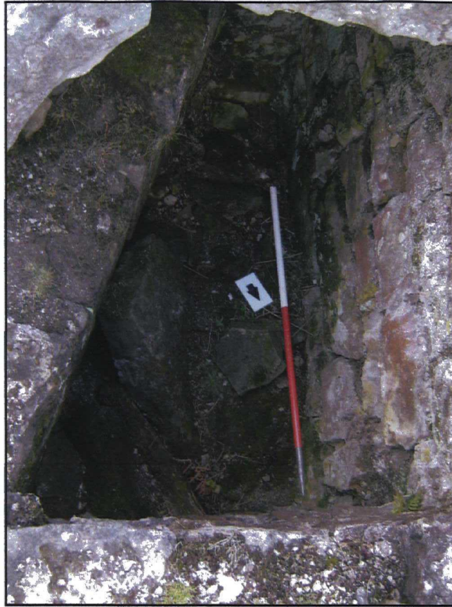
Plate 15. Looking down into Room 2 before works, scale 1m.