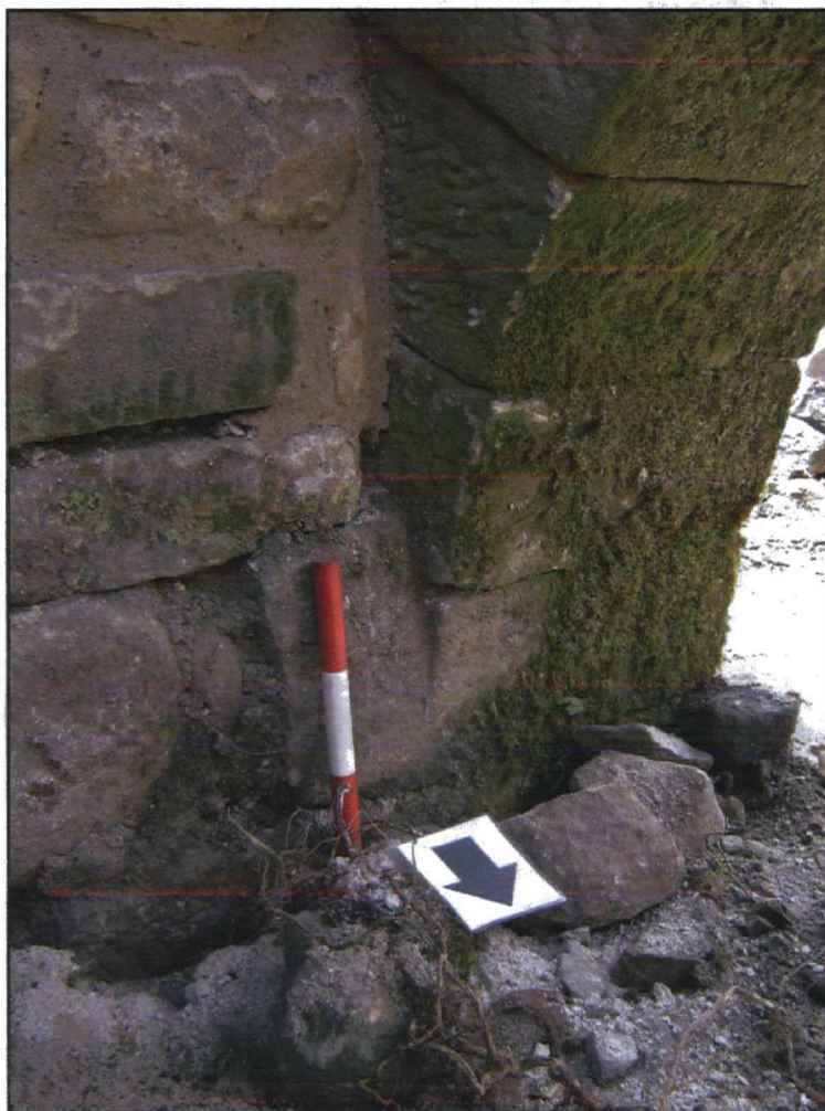
Plate 22. Detail of spring point at the southern end of arch between Rooms 1&2.