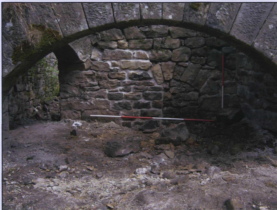
Plate 19. Blocked arch in east wall Room 3, after works, looking east. Scales 1&2m.