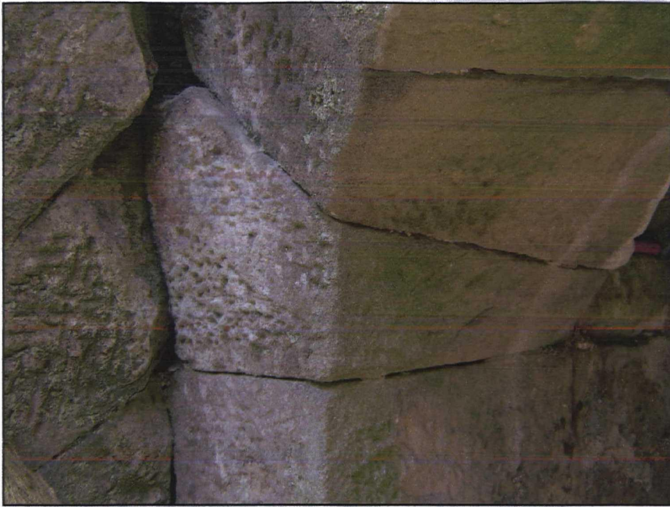
Plate 21. Detail of spring point at the western end of arch between Rooms 2&3.