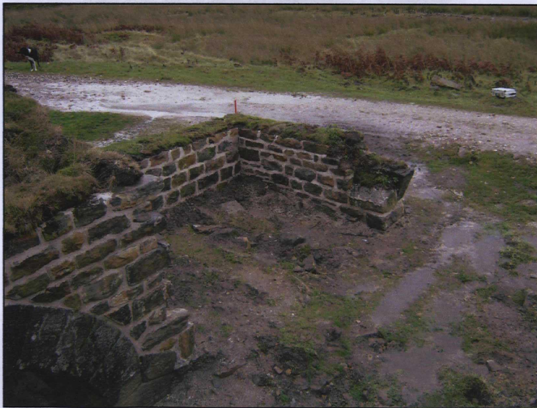
Plate 24. Room 4 after works, looking south-east.