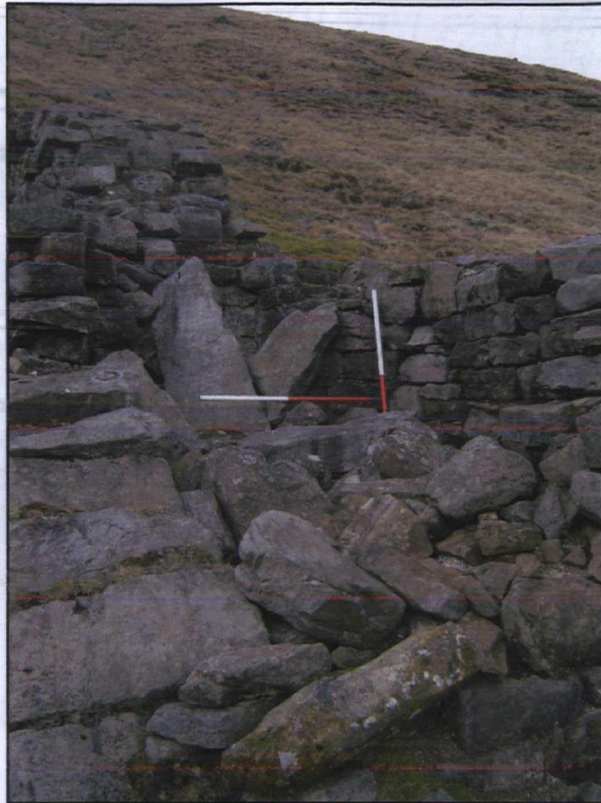
Plate 17. Room 3 with stone tumble fill before works, looking north-east, scales 1m.