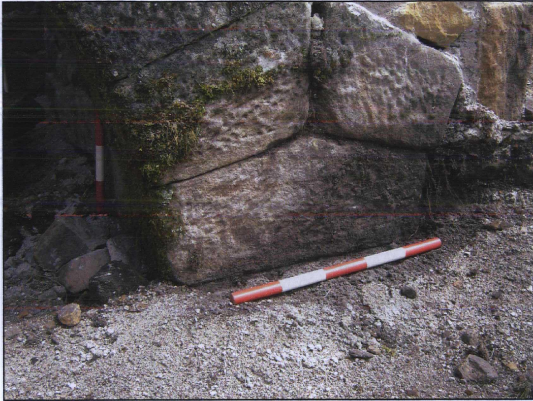
Plate 13. Spring point at south end of arch, Room 1, looking south-east. Scale 0.5m.