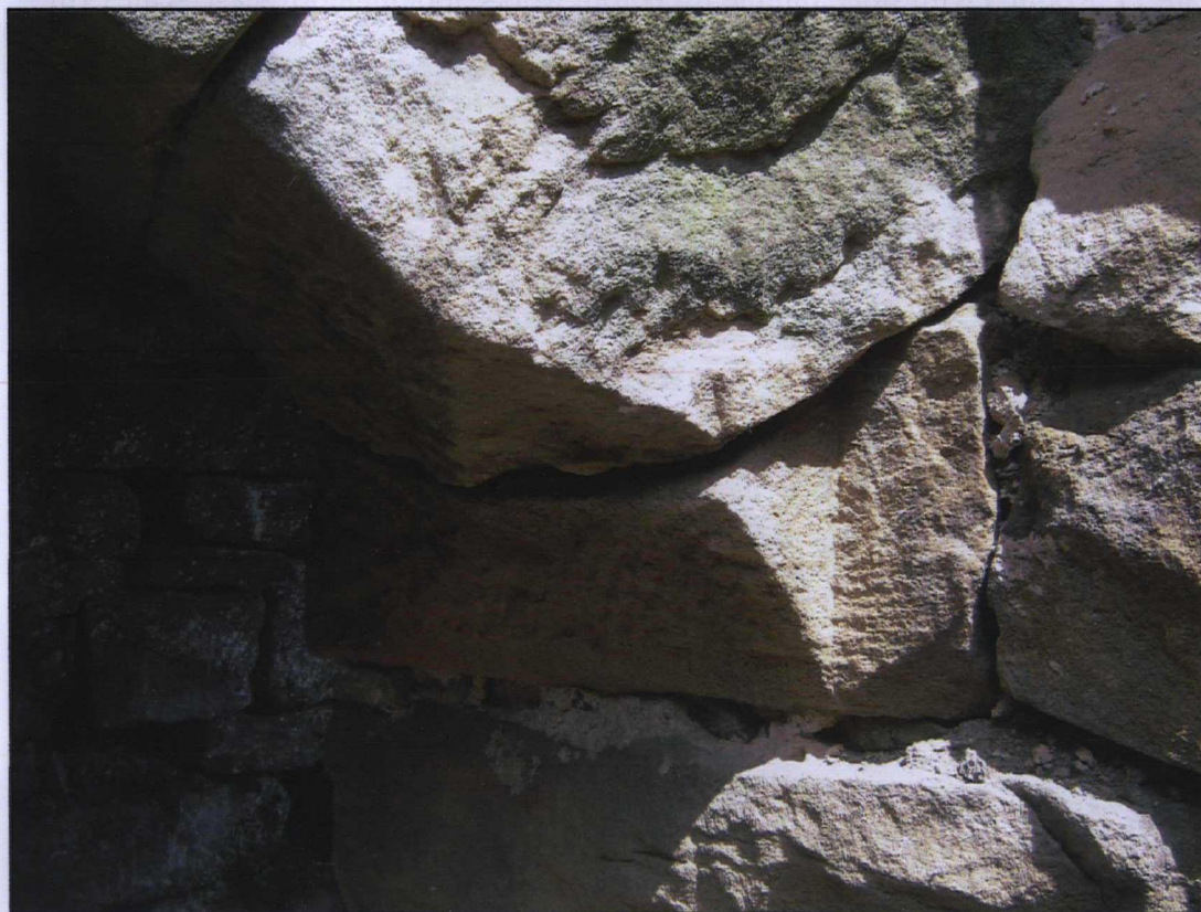
Plate 20. Detail of spring point at the eastern end of arch between Rooms 2&3.