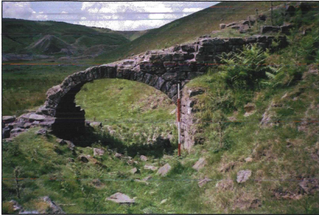
Plate 34. Providence Smelt Mill flue and pathway (M Roe, 2003)