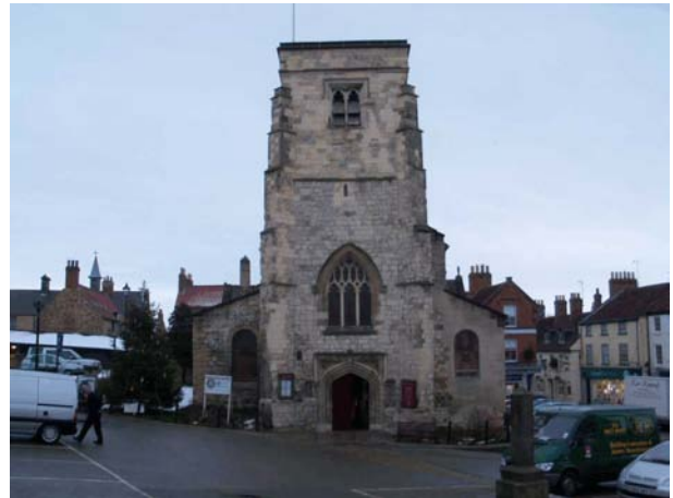
Plate 1 St Michael's Church looking east

St Michael's Church is a Grade II* listed building and is located in the centre of Market Place, Malton, North Yorkshire (Figure 1; NGR: SE7850 7170; Plate 1). The church is enclosed to the south west and north west by areas of car parking and to the north east by commercial properties. The area to the immediate north of the church and to the south of the new extension are all areas of garden. To the north and south of the church are two alleys oriented broadly N-E-SW.