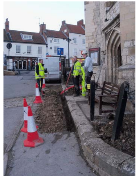
Plate 3 Floodlight trench looking north

No archaeological remains were encountered during the watching brief. The existence of several previous services within the alley and widespread layers of hardcore meant that any archaeological remains within this area had been removed, although archaeological remains may exist at a greater depth, possibly signalled by the presence of disarticulated human bones encountered during fieldwork.