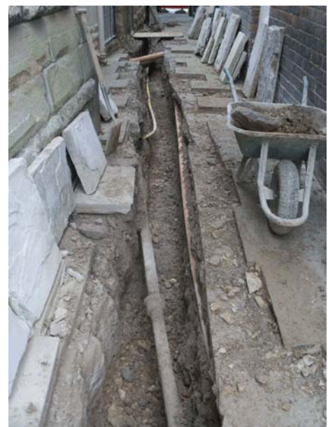
Plate 2 Foul pipe service trench looking east

The floodlight trench passed through the same ground to the north of the church was a sequence of hardcore rubble underlying a deep garden soil was encountered. Beyond the same ground the sequence