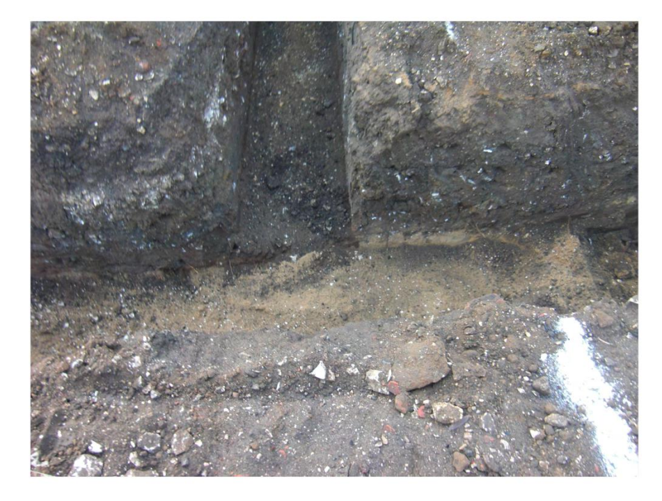
Plate 6. View of Foundation Footings.