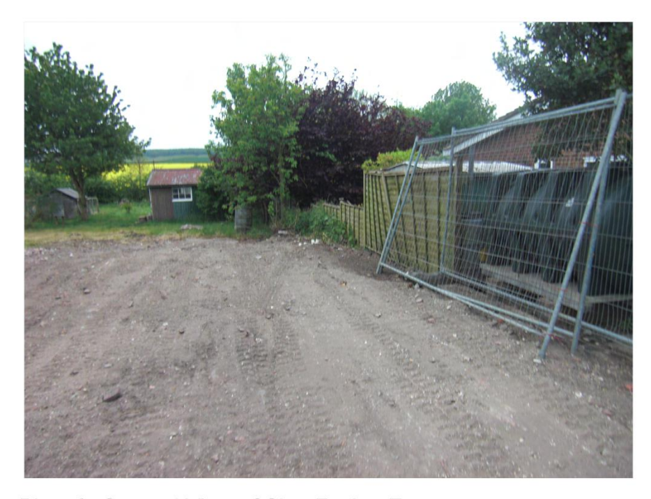
Plate 2. General View of Site. Facing East.