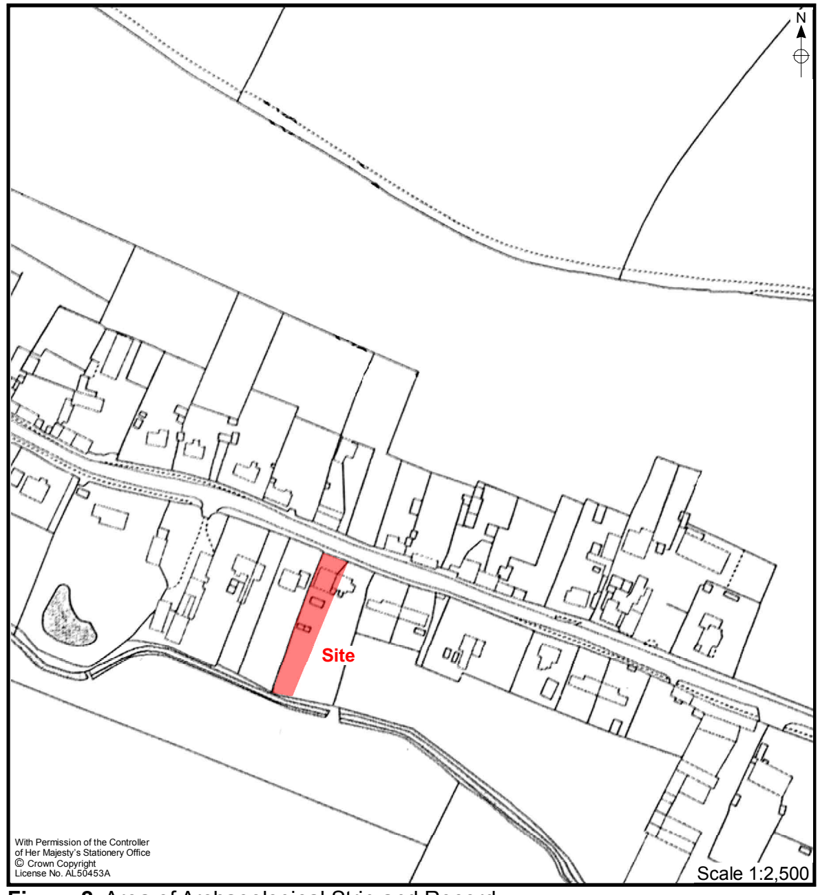
Figure 2. Area of Archaeological Strip and Record.