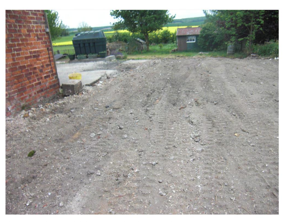
Plate 1. General View of Site. Facing East.