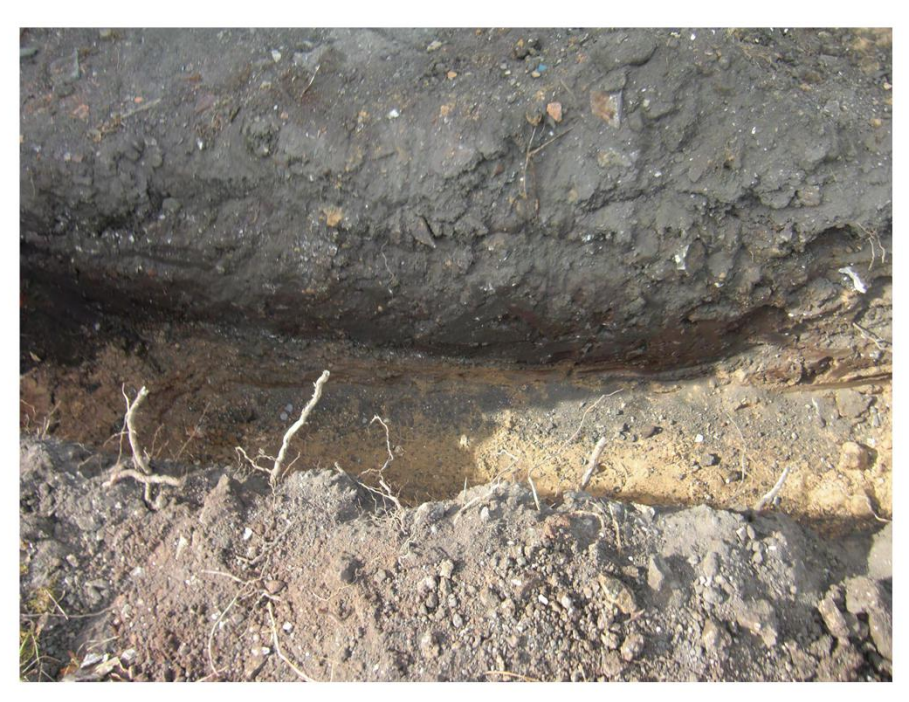
Plate 3. View of Foundation Trench.