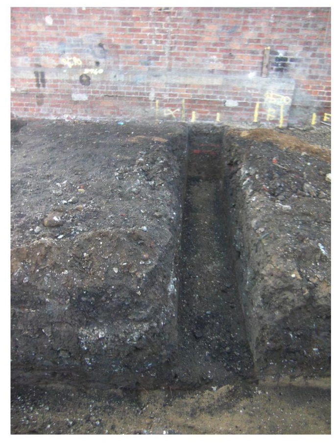
Plate 5. View of Foundation Footings. Facing East.