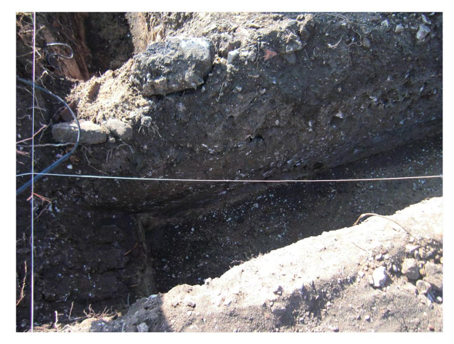
Plate 4. View of Foundation Footings.