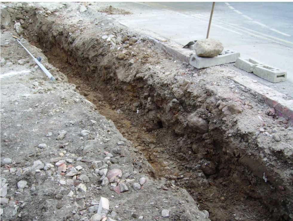
Plate 4. Excavation of Foundation Trench. Facing South East