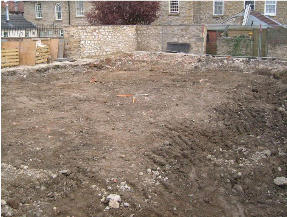
Plate 1. General View of Site. Facing North West