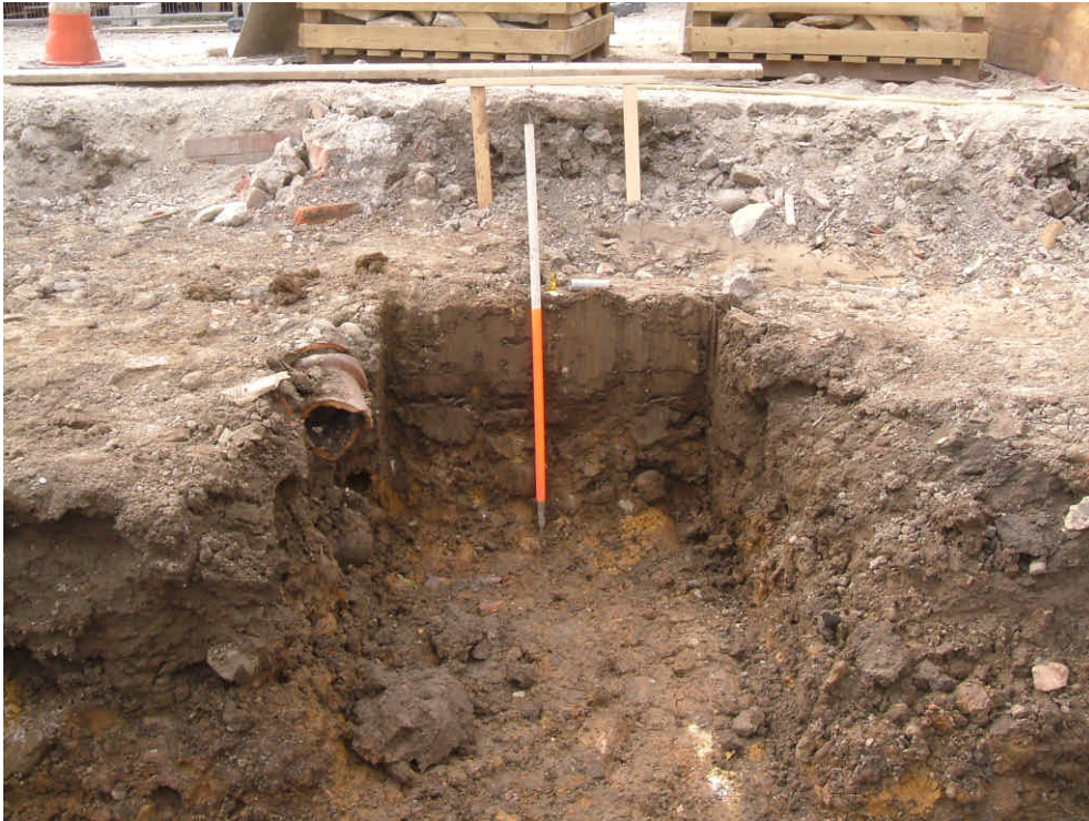
Plate 3. Foundation Trench Section. Facing East