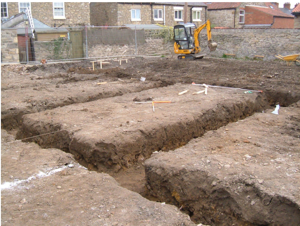
Plate 2. View of Excavated Footings. Facing North East