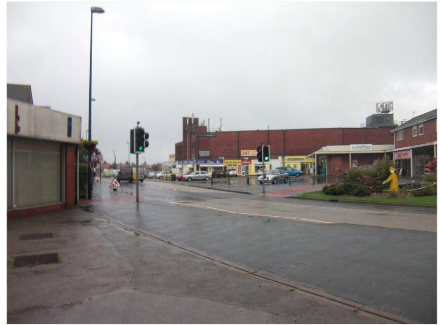
Plate 4. View towards Station. Facing South-west.