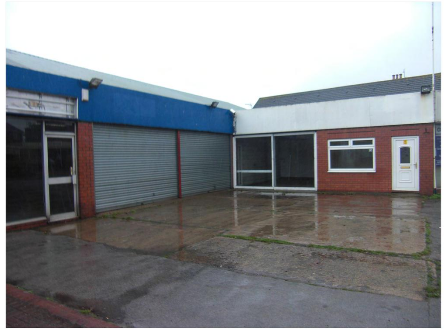
Plate 2. General View of Site. Facing South.