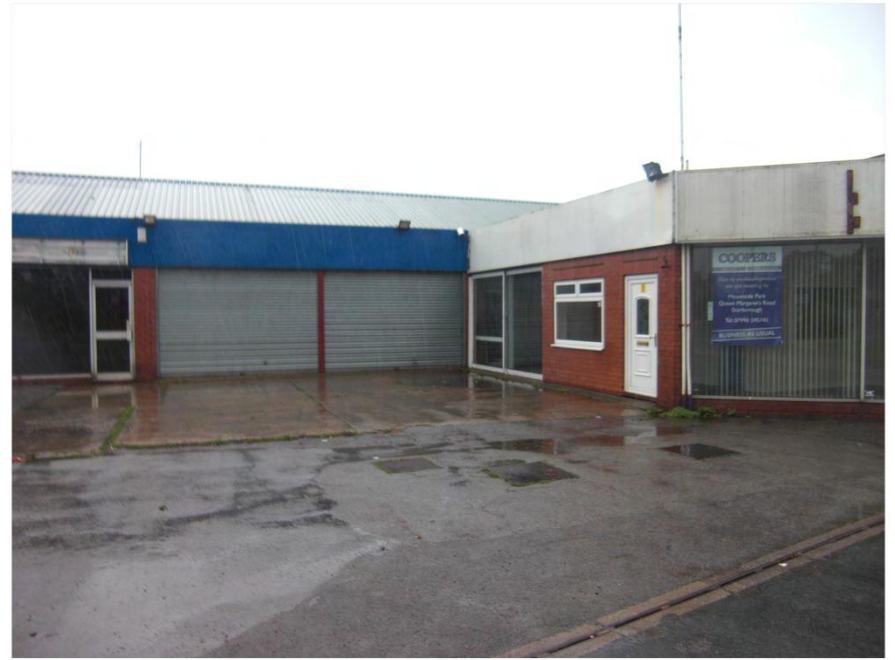
Plate 6. General View of Site. Facing East.