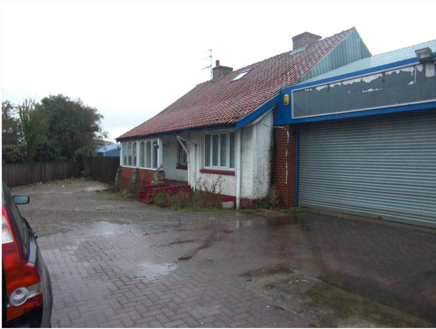
Plate 1. General View of Site. Facing North.