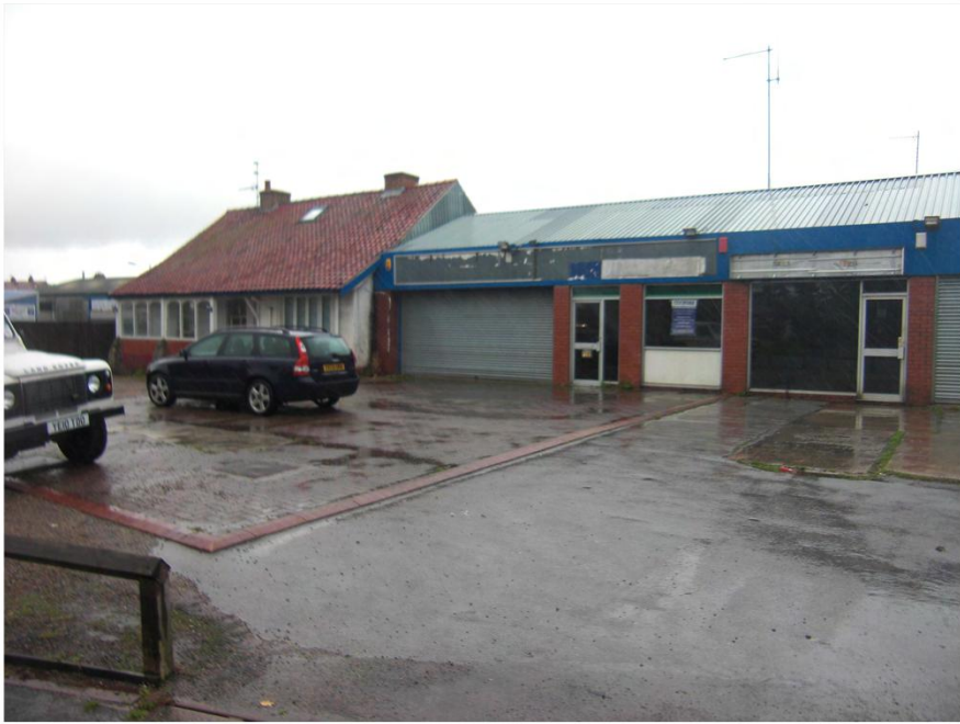
Plate 5. General View of Site. Facing North-east.