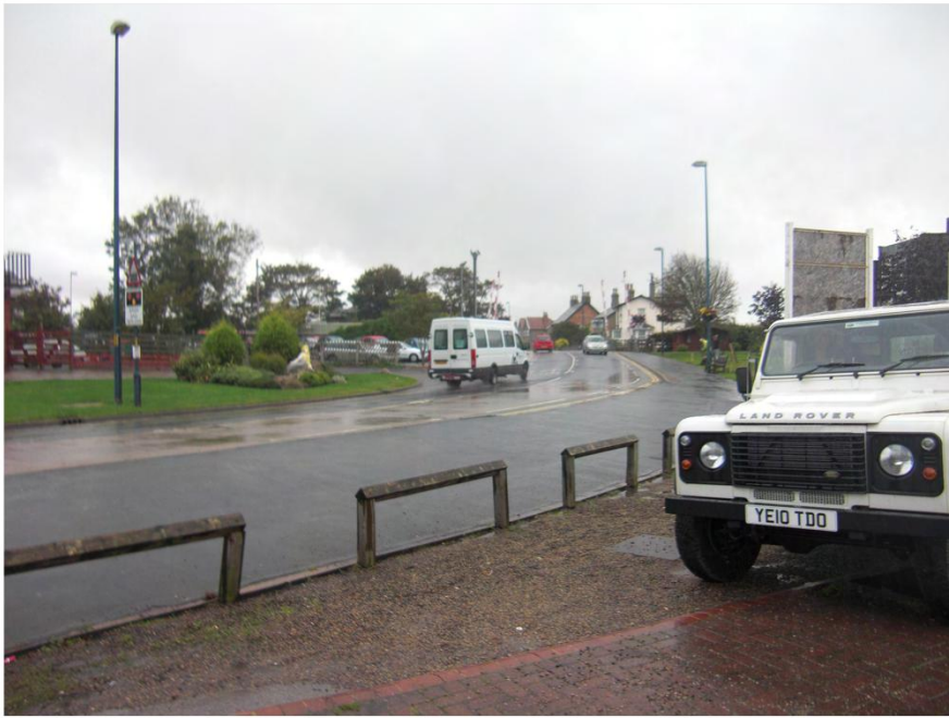
Plate 3. View towards level crossing from Site. Facing West.