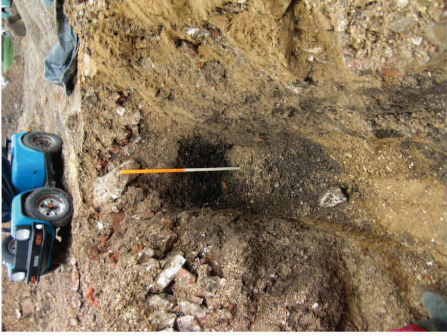
Plate 2. View of Foundation Trench.