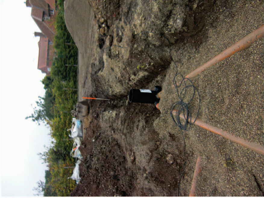
Plate 3. View of Drainage Trench.