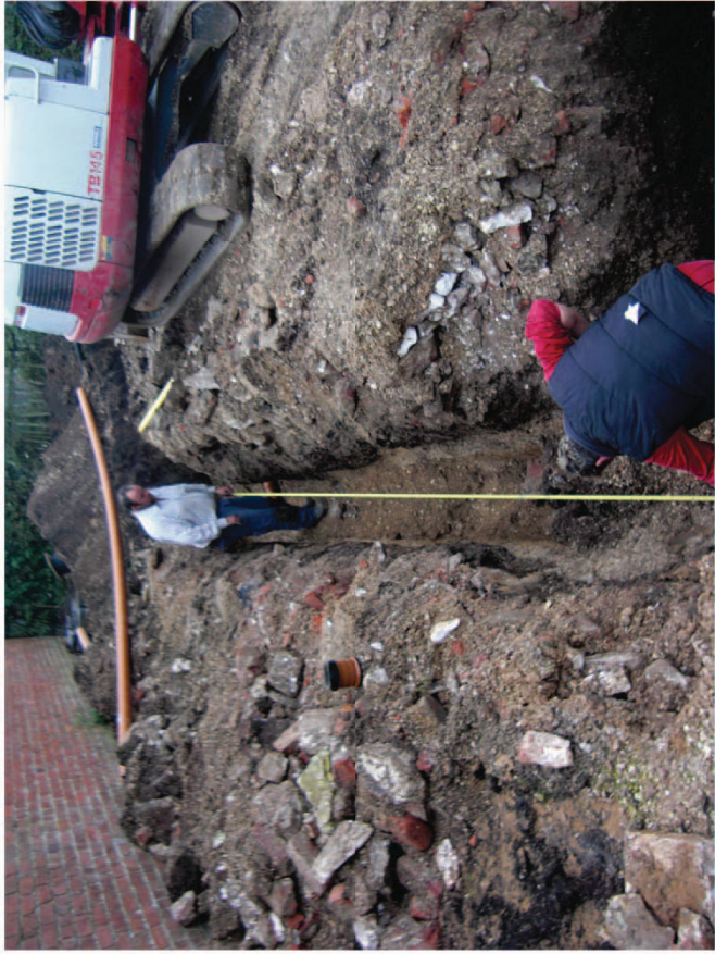
Plate 1. View of Foundation Trench.