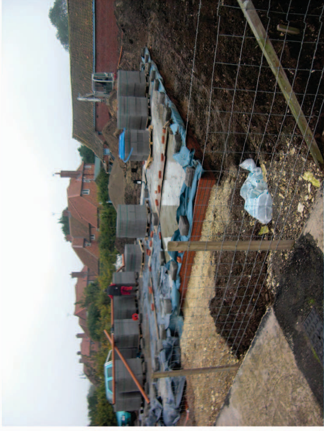
Plate 4. View of House Plot.