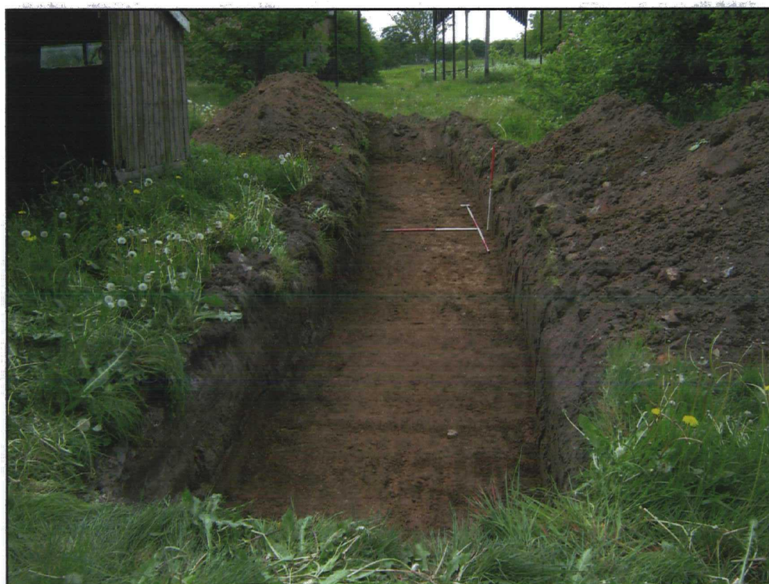
Plate 3. Trench 4 looking east, scales 1 and 2m.