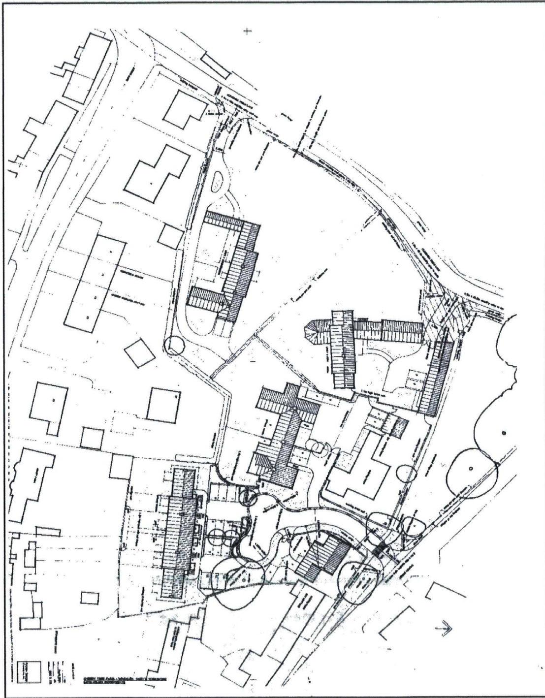
Figure 3. Development Layout