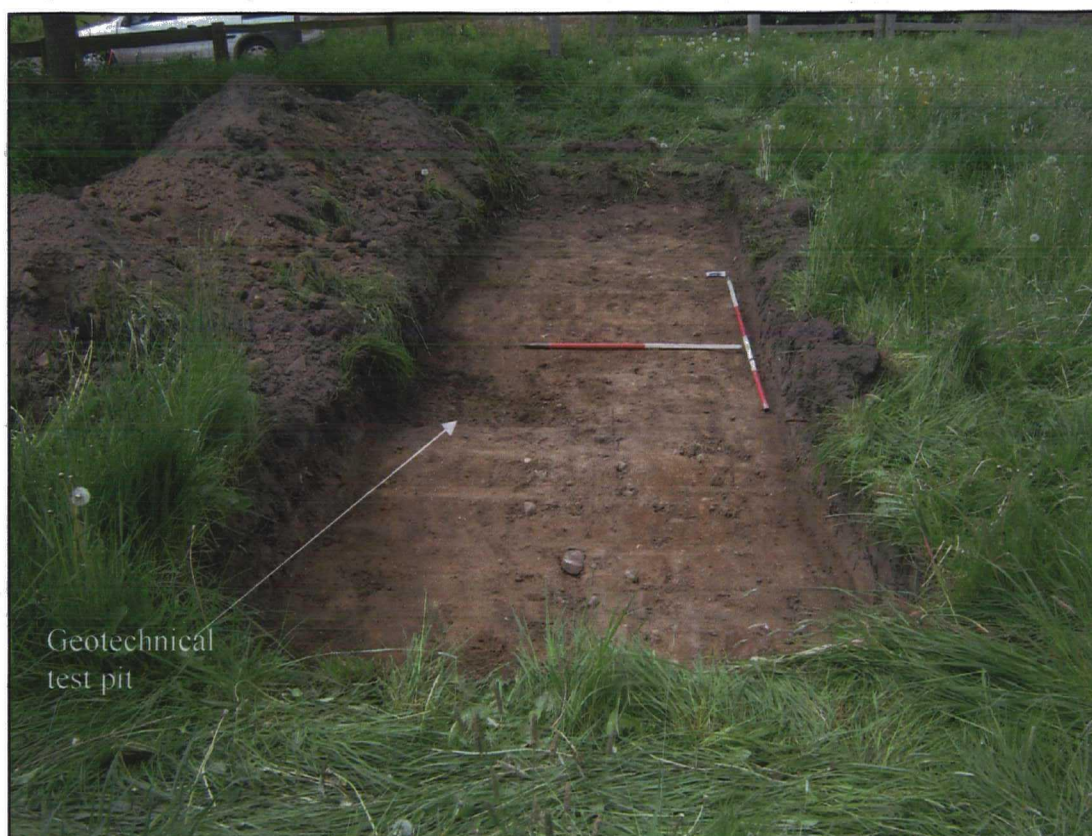
Plate 2. Trench 3 looking east, scales 1 and 2m