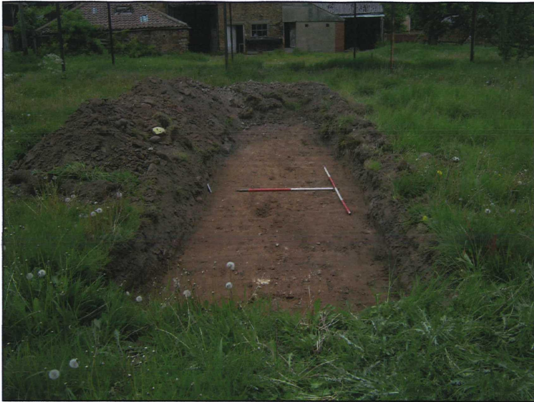
Plate 4. Trench 5 looking north, scales 1 and 2m.