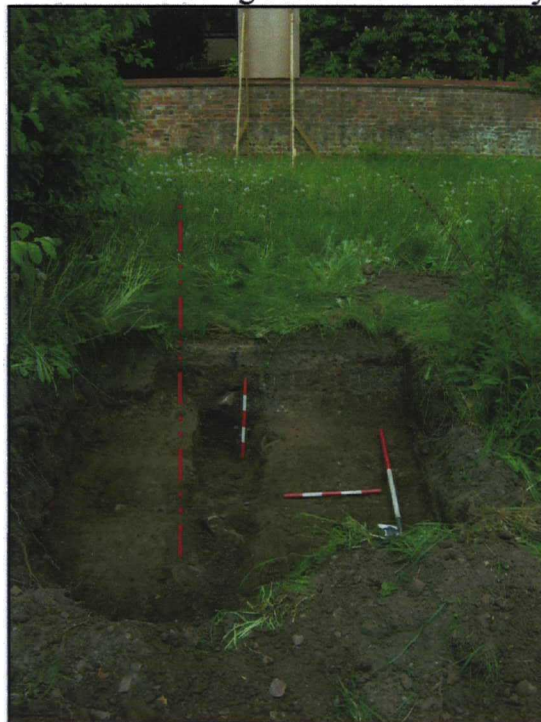
Plate 1. Trench 1 showing foundations for garden wall. Looking N, scales 1 & 0.5m