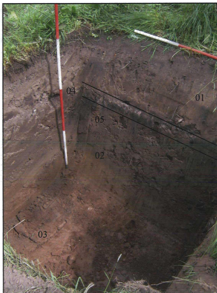
Plate 7. Trench 8 looking north-east, scales 1 and 2m.