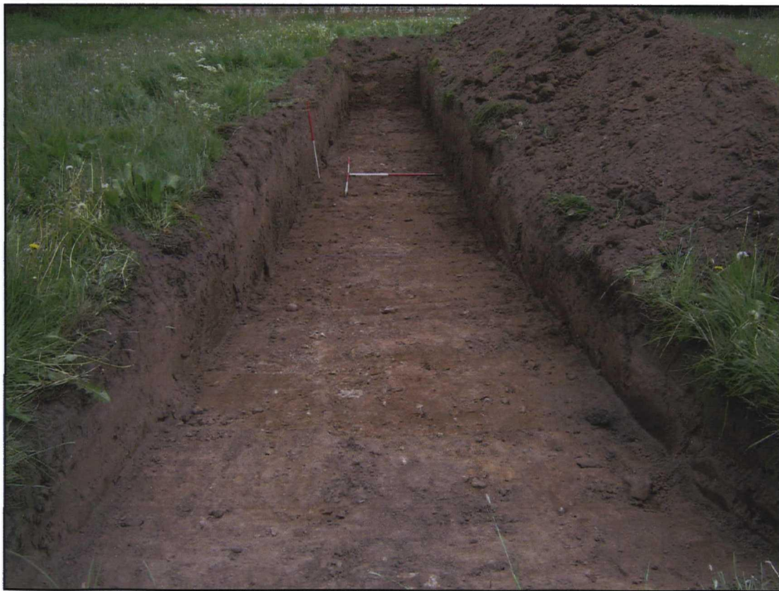
Plate 5. Trench 6 looking east, scales 1 and 2m.