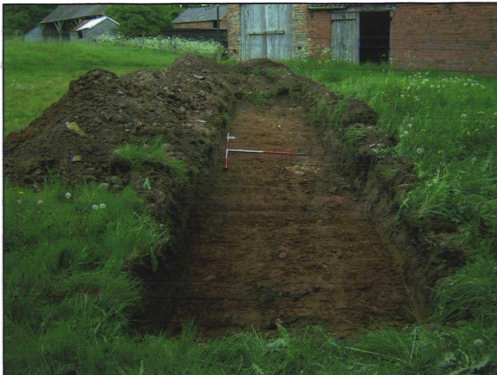
Plate 6. Trench 7 looking north-east, scales 1 and 2m.