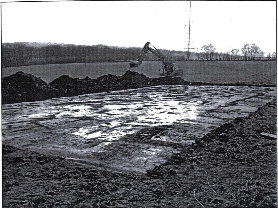
Plate 1. General view of excavation area.