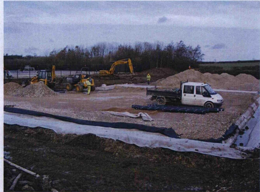
Plate 6. Post-excavation View. Facing North.