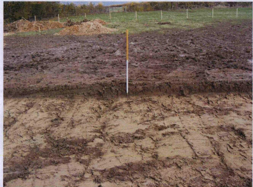
Plate 2. Detail of natural clay. Facing North-east.