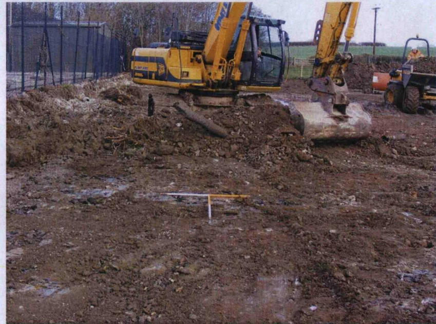
Plate 4. Ground surface following removal of bund. Facing South-west.