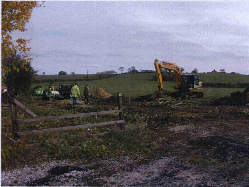
Plate 1. Pre-excavation View. Facing North-east.