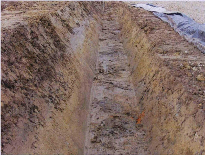
Plate 3. Drainage trench. Facing North-east.