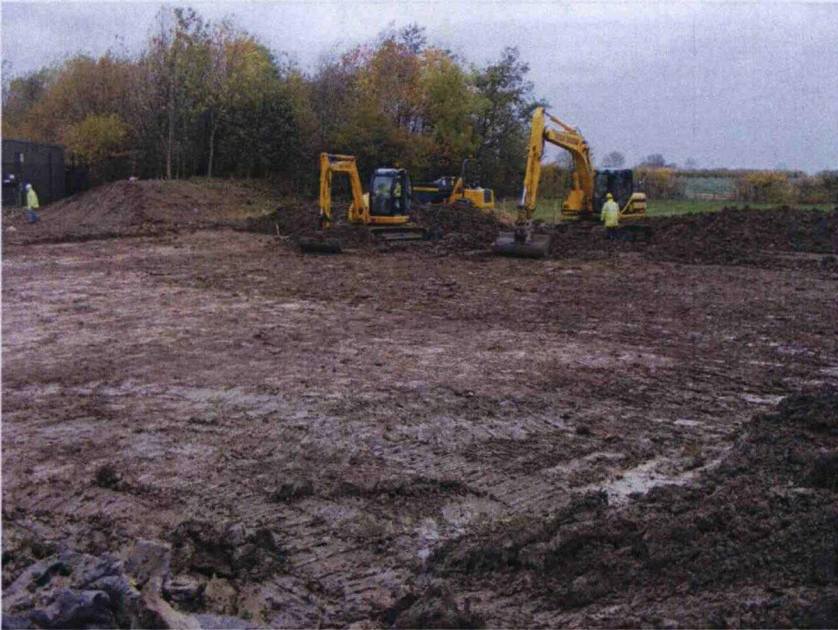
Plate 5. Stripping of site and natural surface. Facing North.