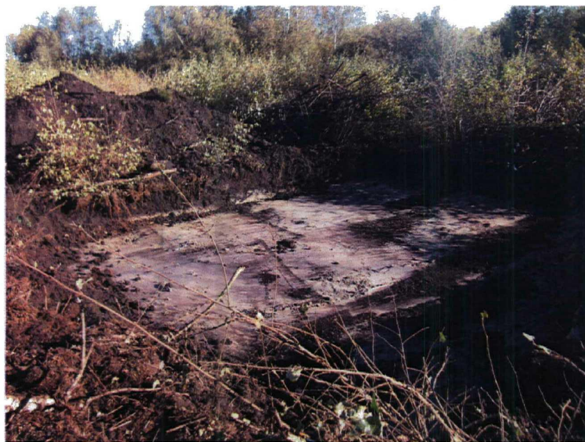
Plate 5. View of Trench 2. Facing East.