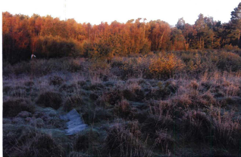
Plate 3. General View of Site. Facing West.