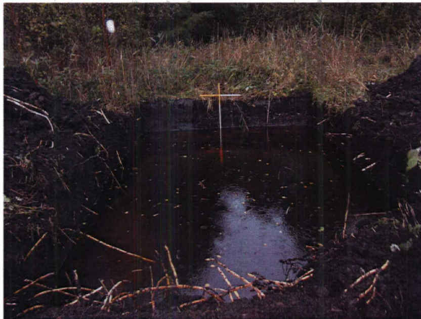
Plate 12. View of Trench 7. Facing North.