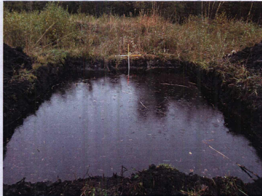
Plate 10. View of Trench 5. Facing North.