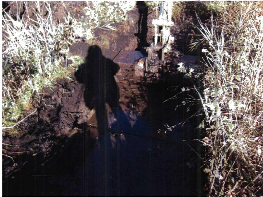
Plate 16. View of Trench 11. Facing South.