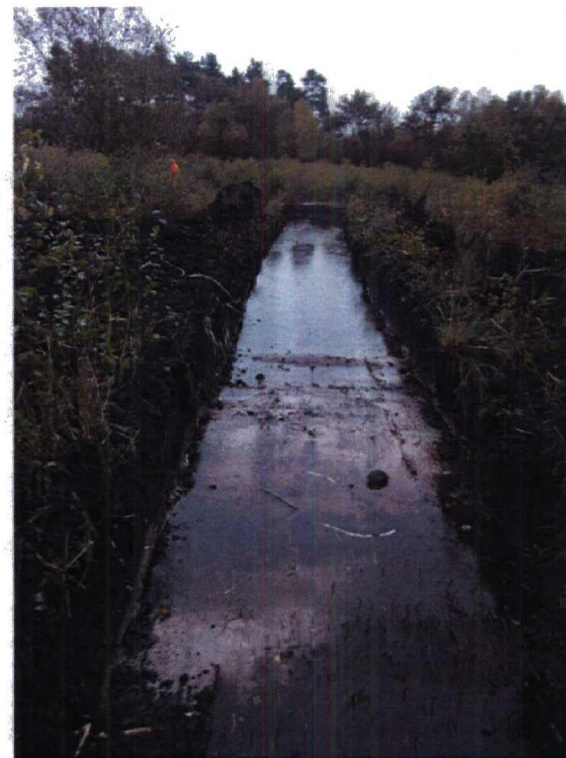
Plate 8. View of Trench 4. Facing North.