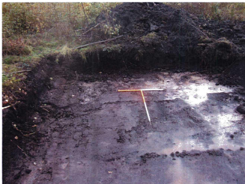
Plate 13. View of Trench 8.