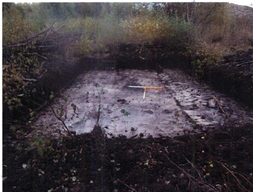
Plate 14. View of Trench 9. Facing East.