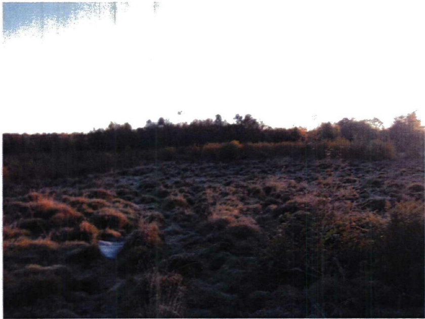
Plate 1. General View of Site. Facing East.