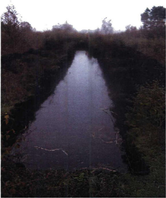
Plate 11. View of Trench 6. Facing South.