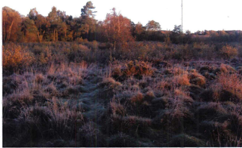
Plate 2. General View of Site. Facing North.