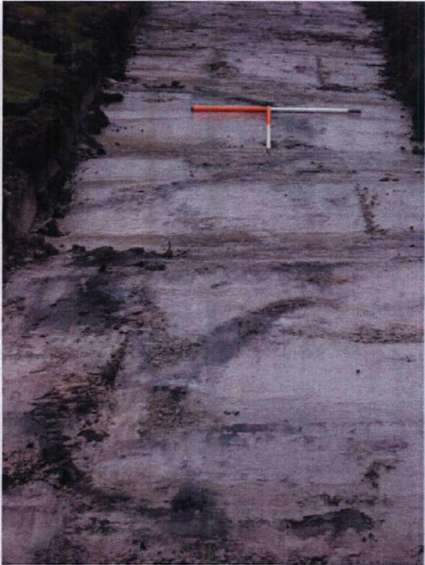
Plate 9. Detailed View of Trench 4.