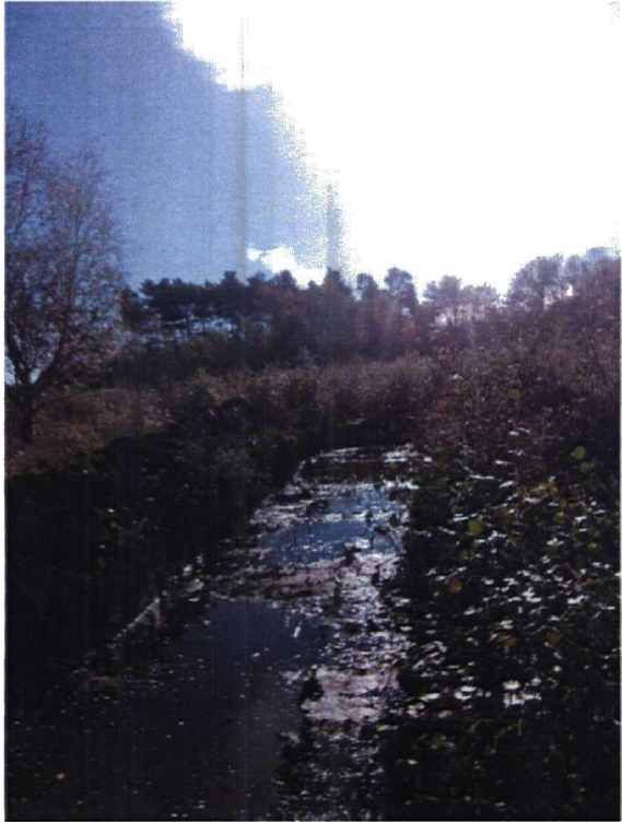
Plate 15. View of Trench 10. Facing East.