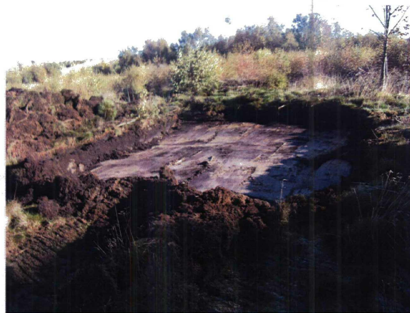
Plate 6. View of Trench 3. Facing South.