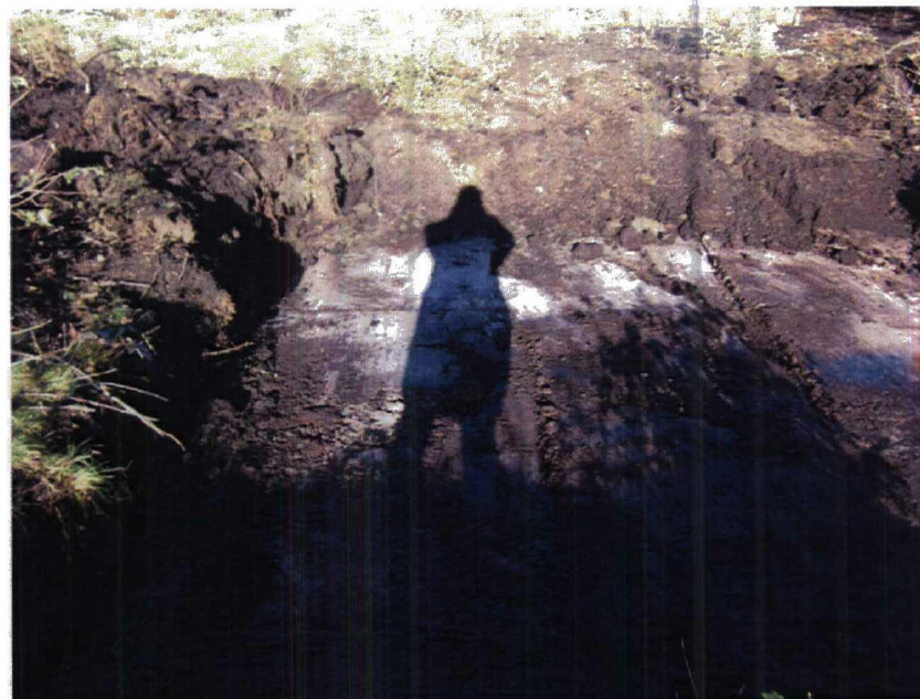
Plate 4. View of Trench 1. Facing East.