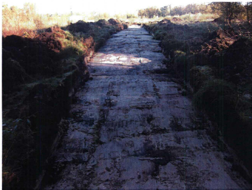
Plate 7. View of Trench 4. Facing East.