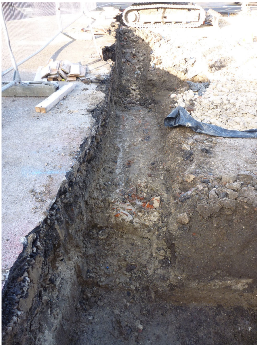
Plate 3 Top of foundations of the demolished shop building