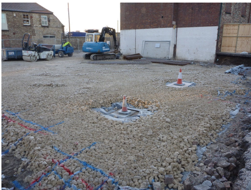
Plate 1 The site, having been stoned-up prior to groundworks