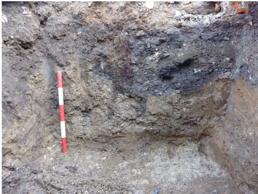
Plate 2 Section within foundation pit