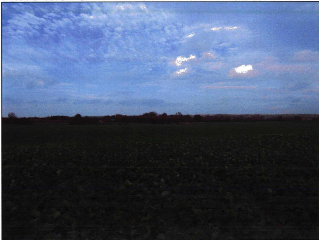
Figure 11: View north-westwards showing the slope to Lebberston Carr