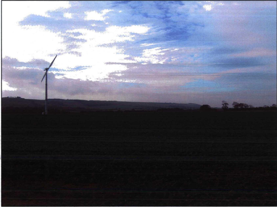
Figure 12: View south-westwards towards Flotmanby Wold