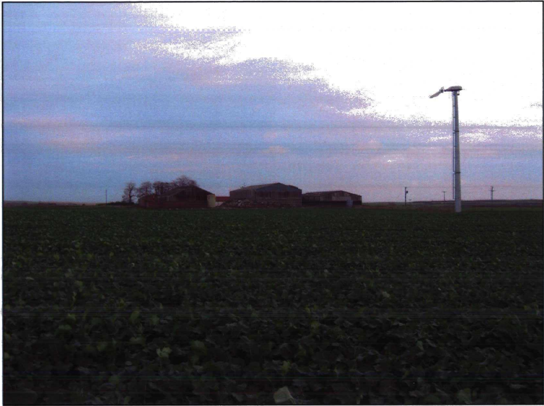
Figure 10: View eastwards towards Magdalen Grange Farm buildings