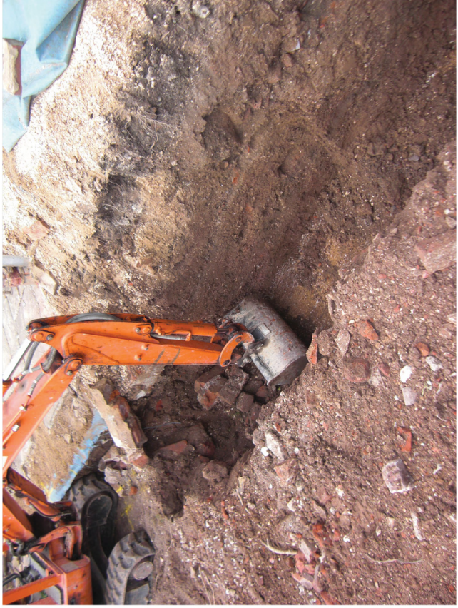
Plate 5. View of Footings.