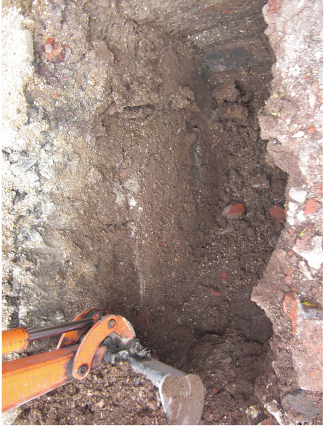
Plate 2. View of Footings.