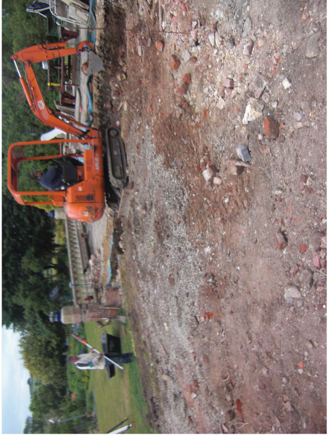
Plate 1. General View of Site. Facing South-west.