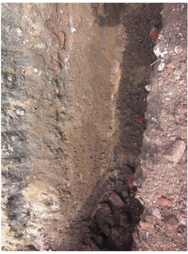
Plate 4. View of Footings.