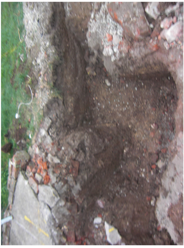
Plate 6. View of Footings.