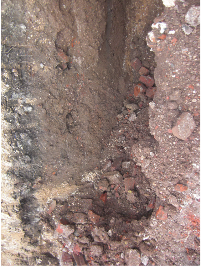
Plate 3. View of Footings.